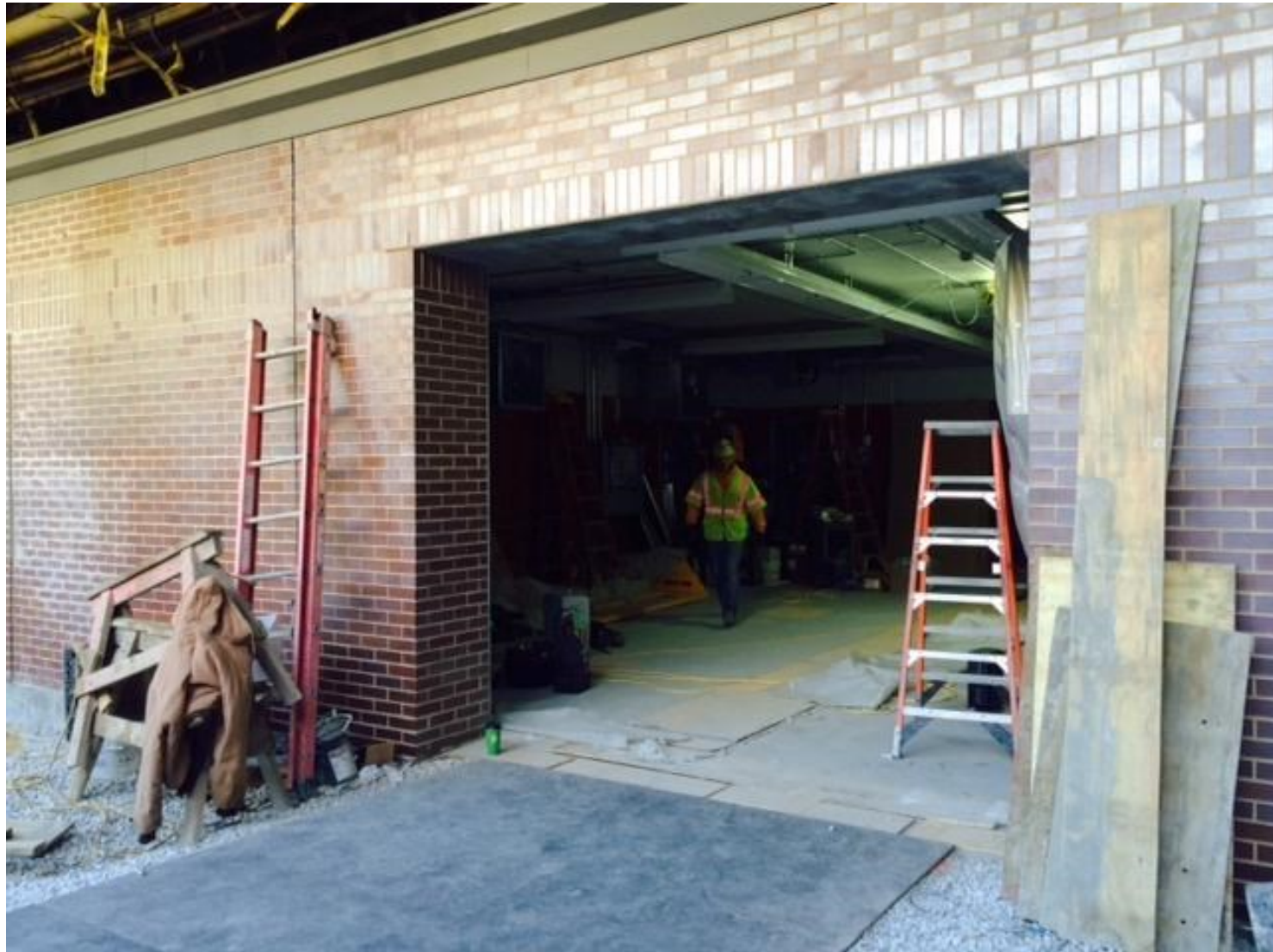
Armitage Substation: DC Building