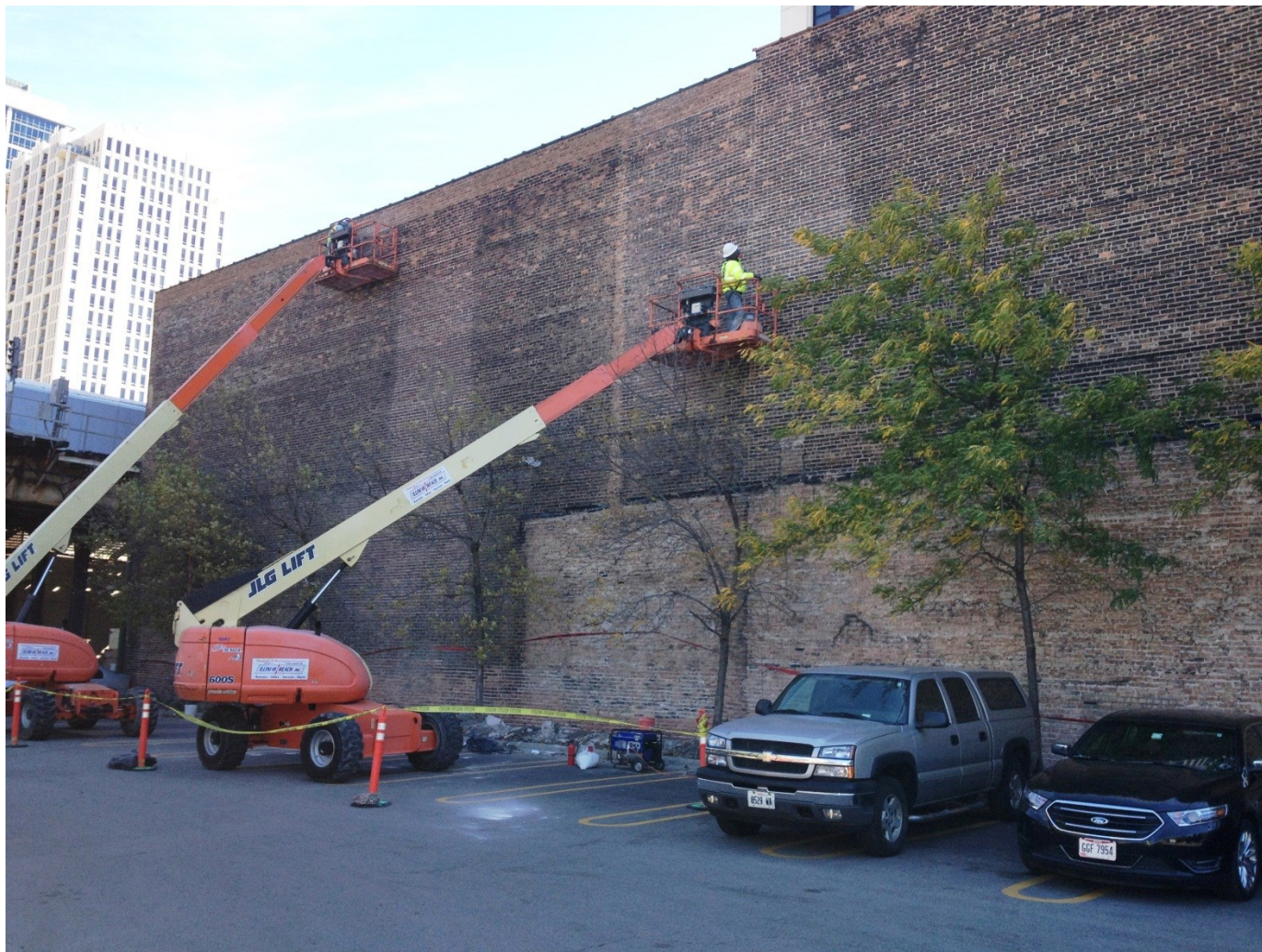
Masonry Rehabilitation Work (State St. Substation)