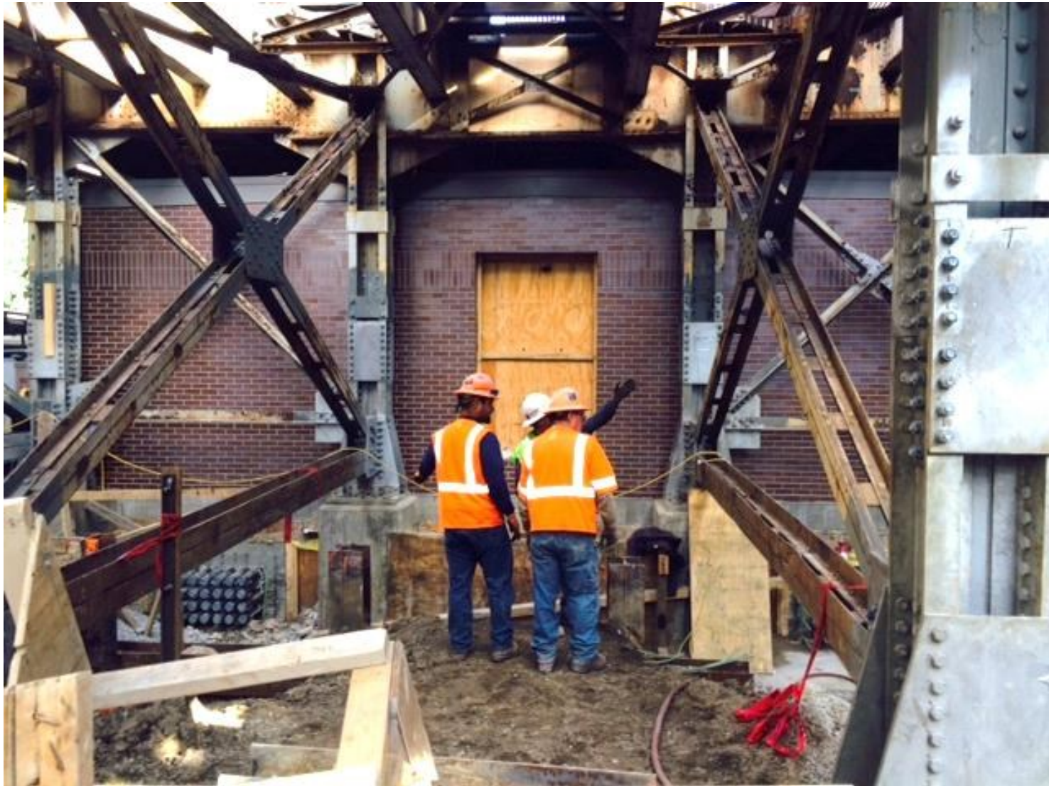
Armitage Substation: DC Building