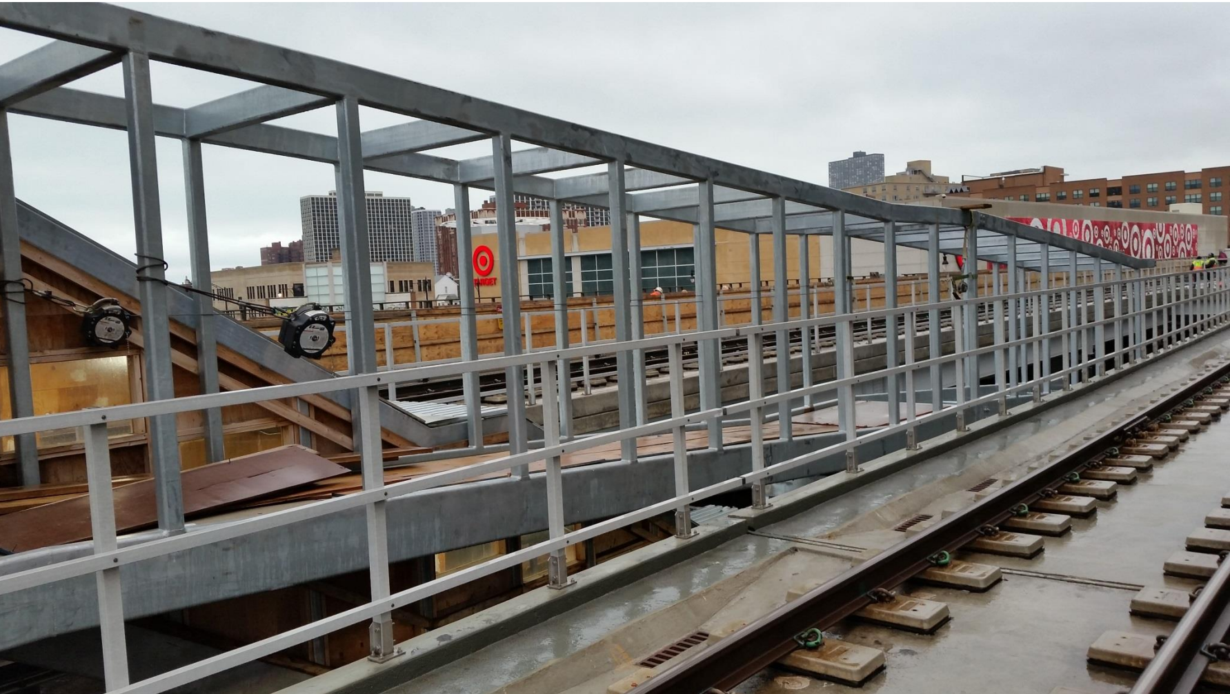
Sunnyside ramp steel structure