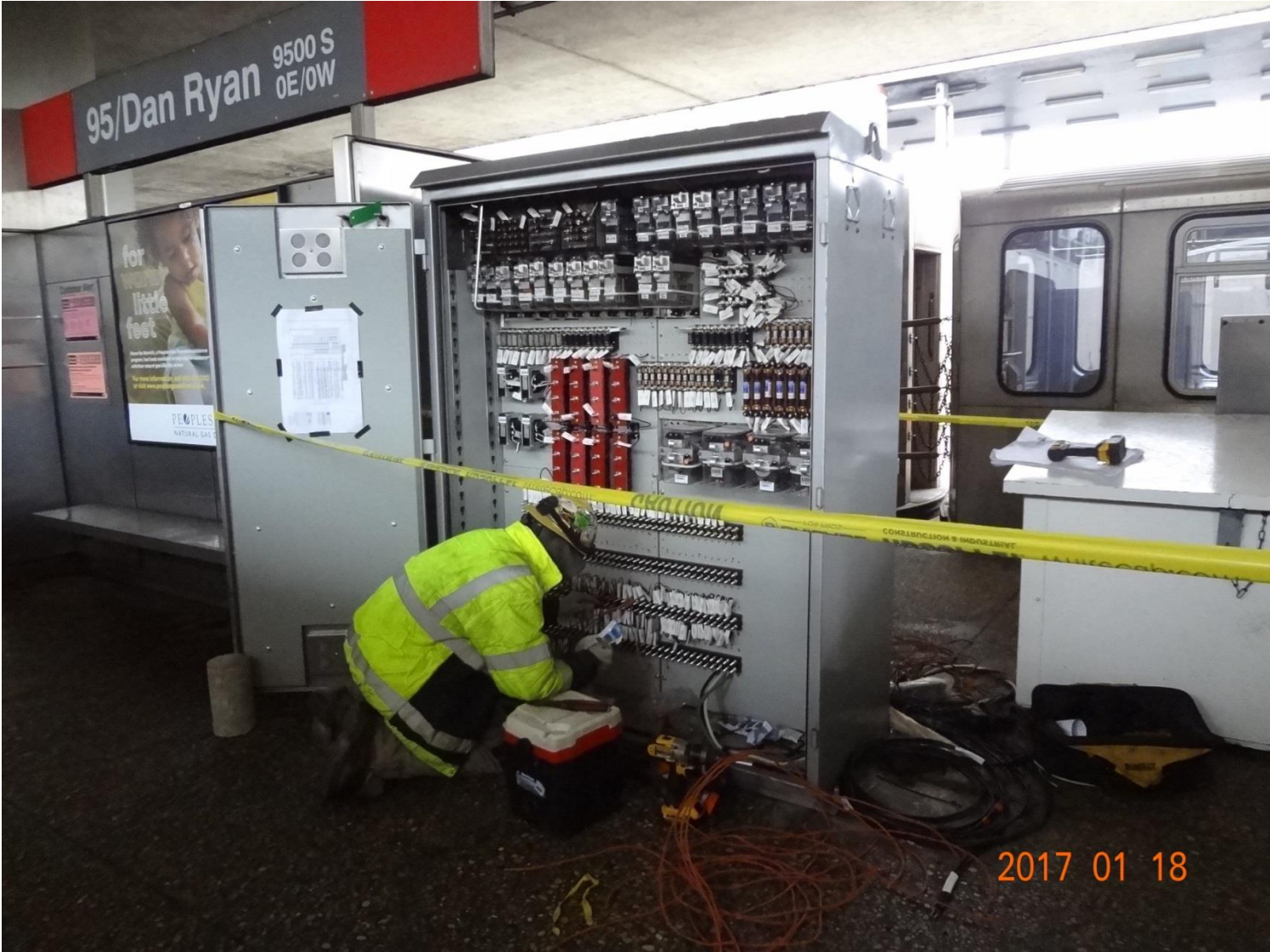
Temporary signal case installation