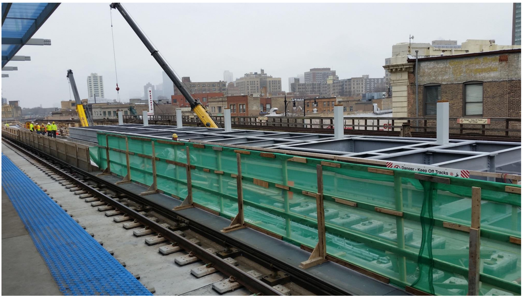
East platform steel structure