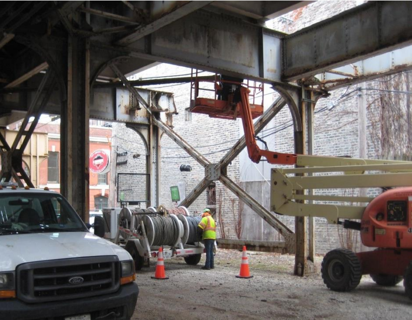
Installation of cable brackets and messenger wire