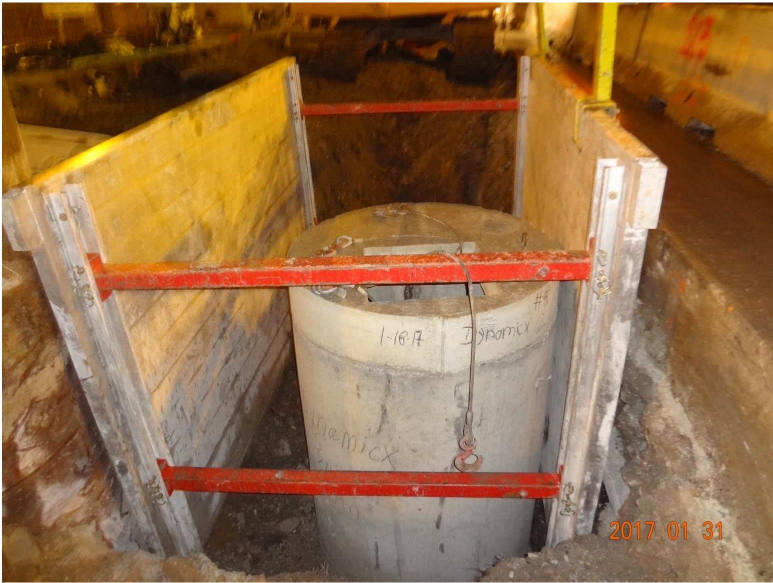
Drainage structure installed in CTA right-of-way