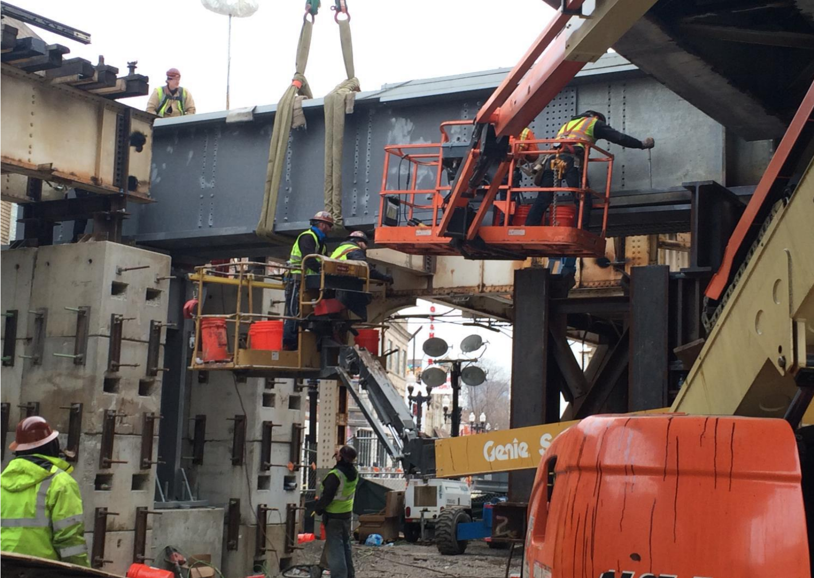
Bent steel structure installation