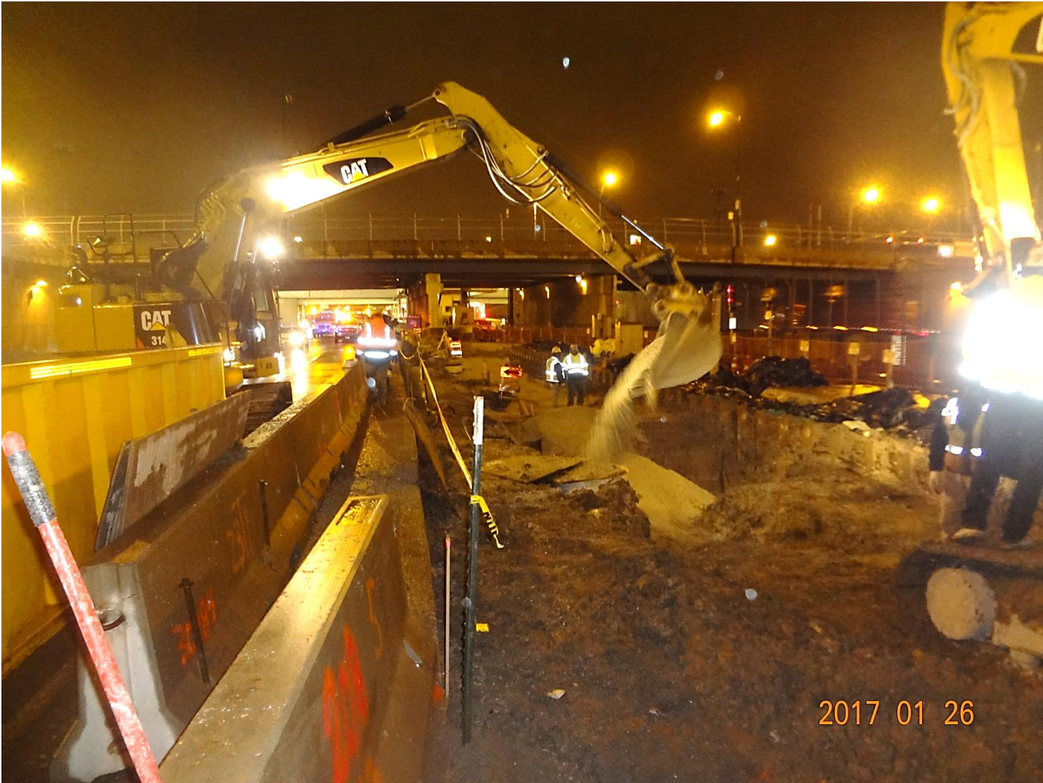
Backfill for removed ductbank areas