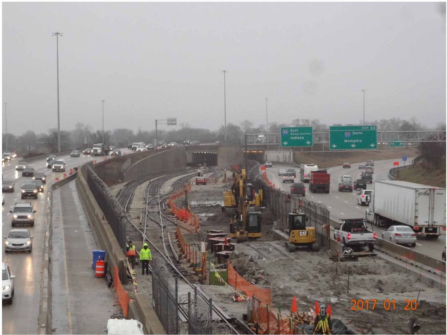
Excavation for track systems ductbanks and site drainage