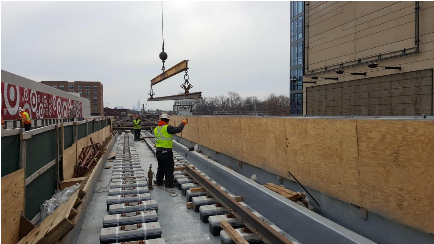
New track 3 running rail installation