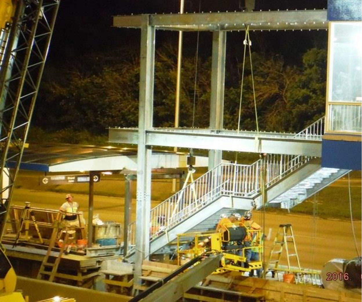
Addison Installation of New Steel and Stair