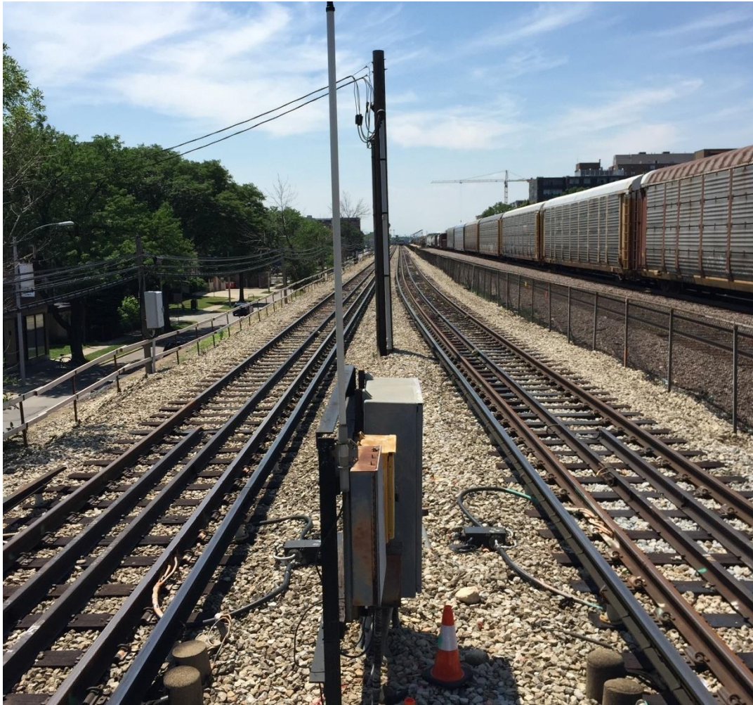
Completed Trackwork at Oak Park (Facing East)