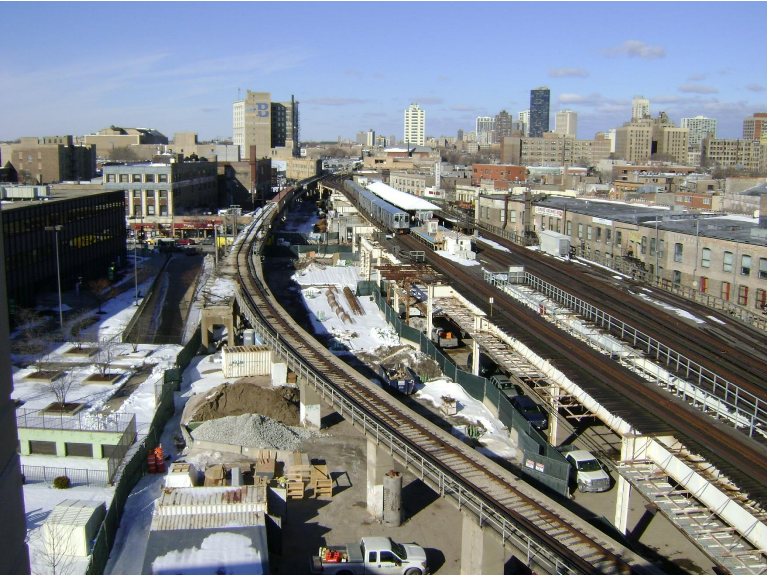
Early 2015 – Old Track 1 Concrete Structure