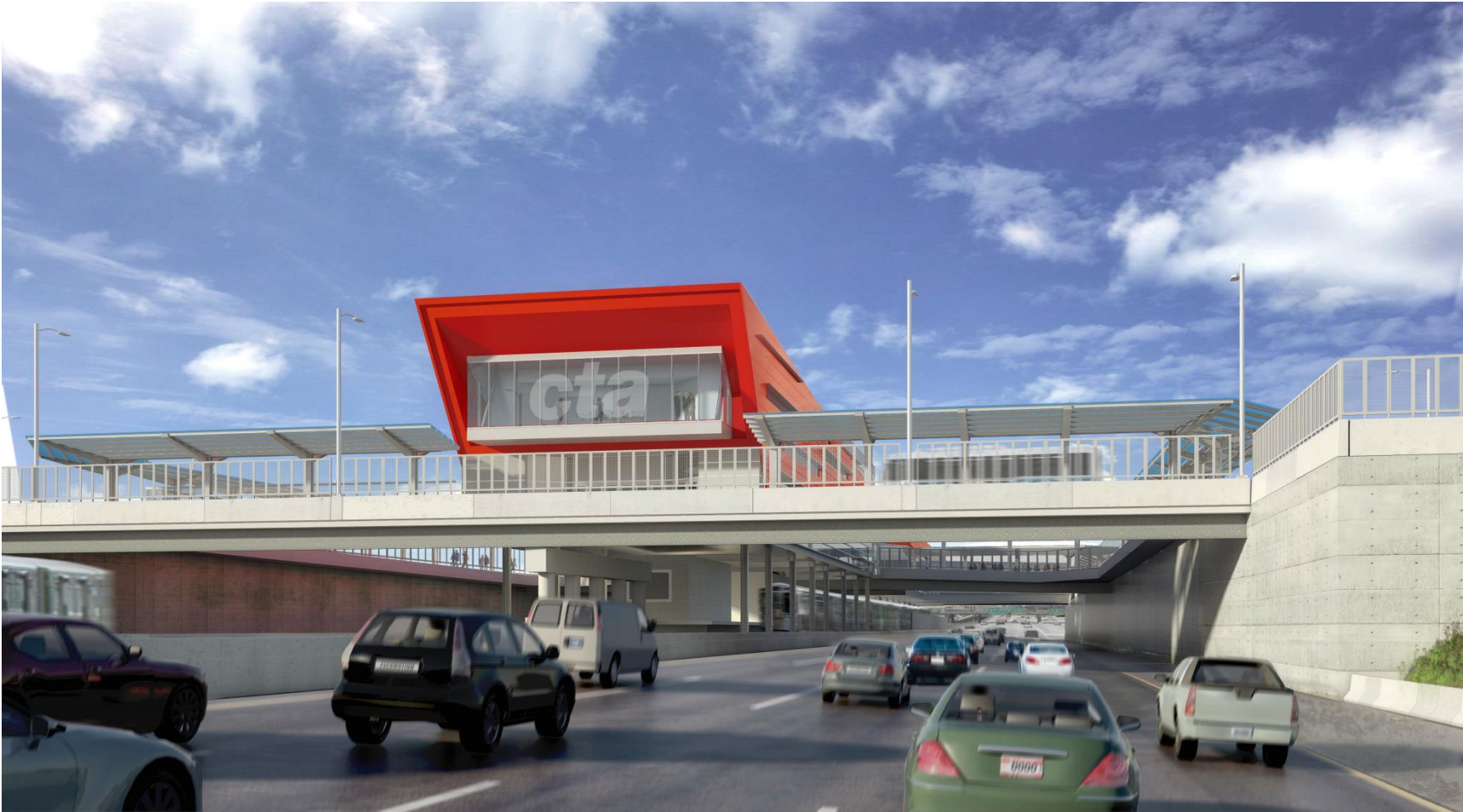
South Terminal Entrance from Expressway - Looking North