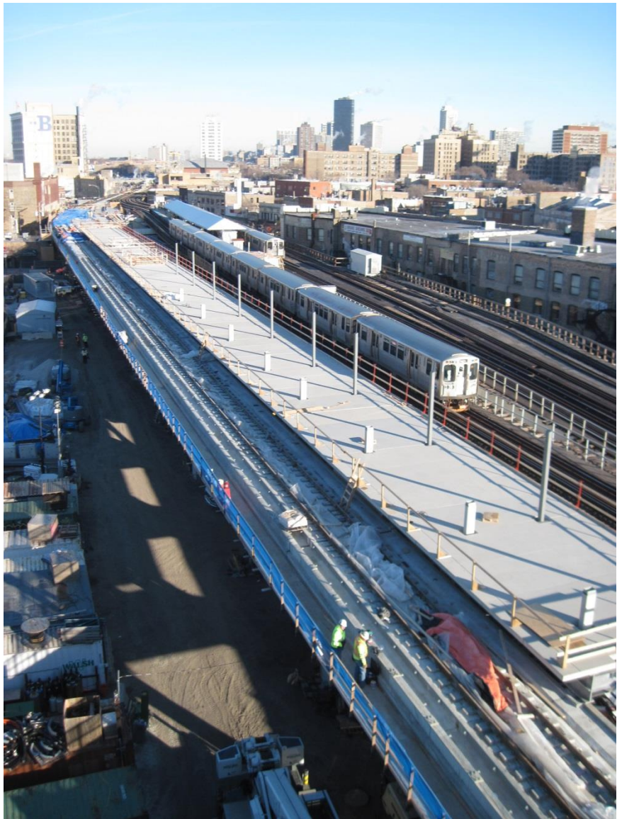
Early 2016 – New Track 1 and Precast Platform