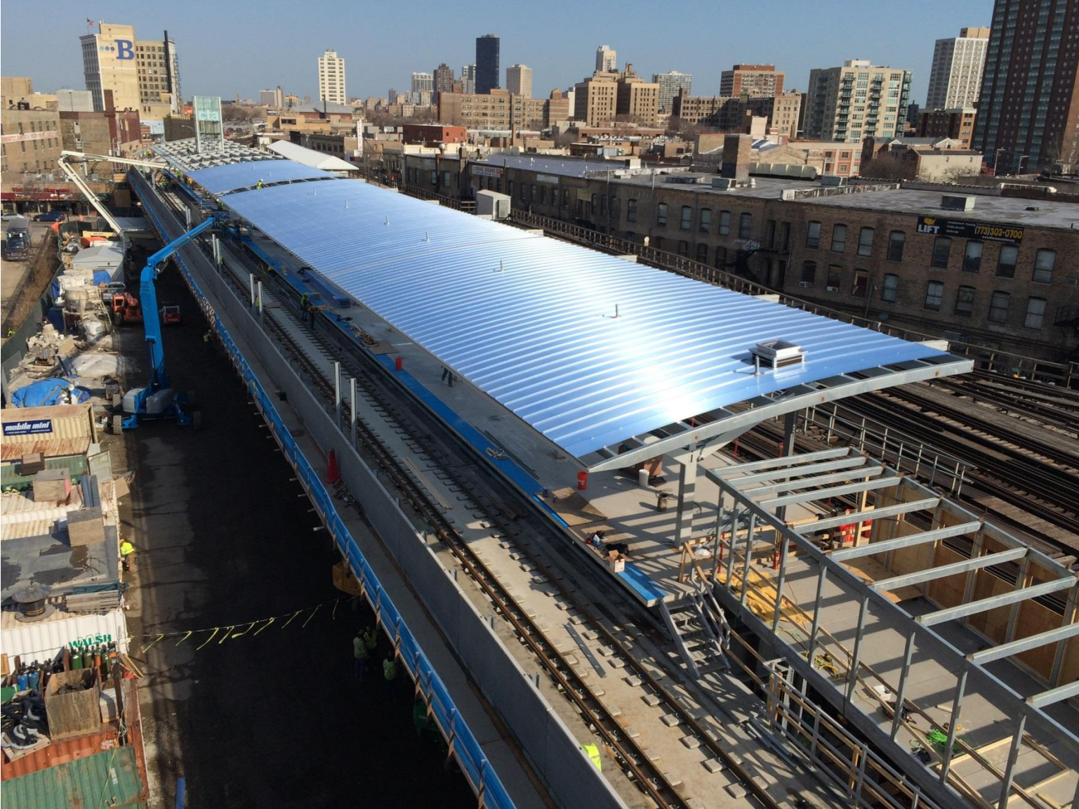
March 2016 - New Polycarb Canopy – SB Platform