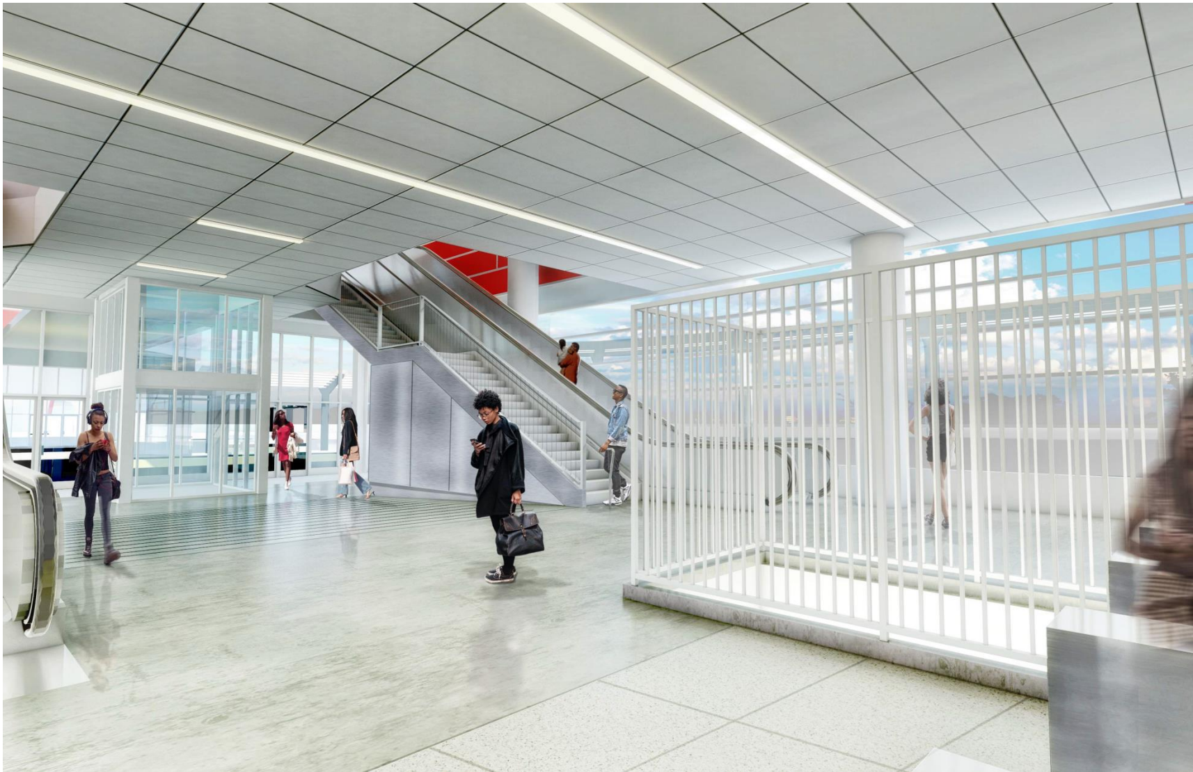
South Terminal Interior - Looking North to 95 th St.