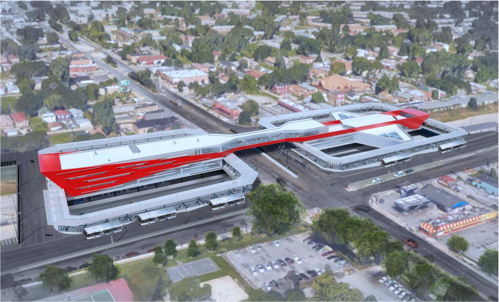
North and South Terminals – Aerial View of Entire Facility