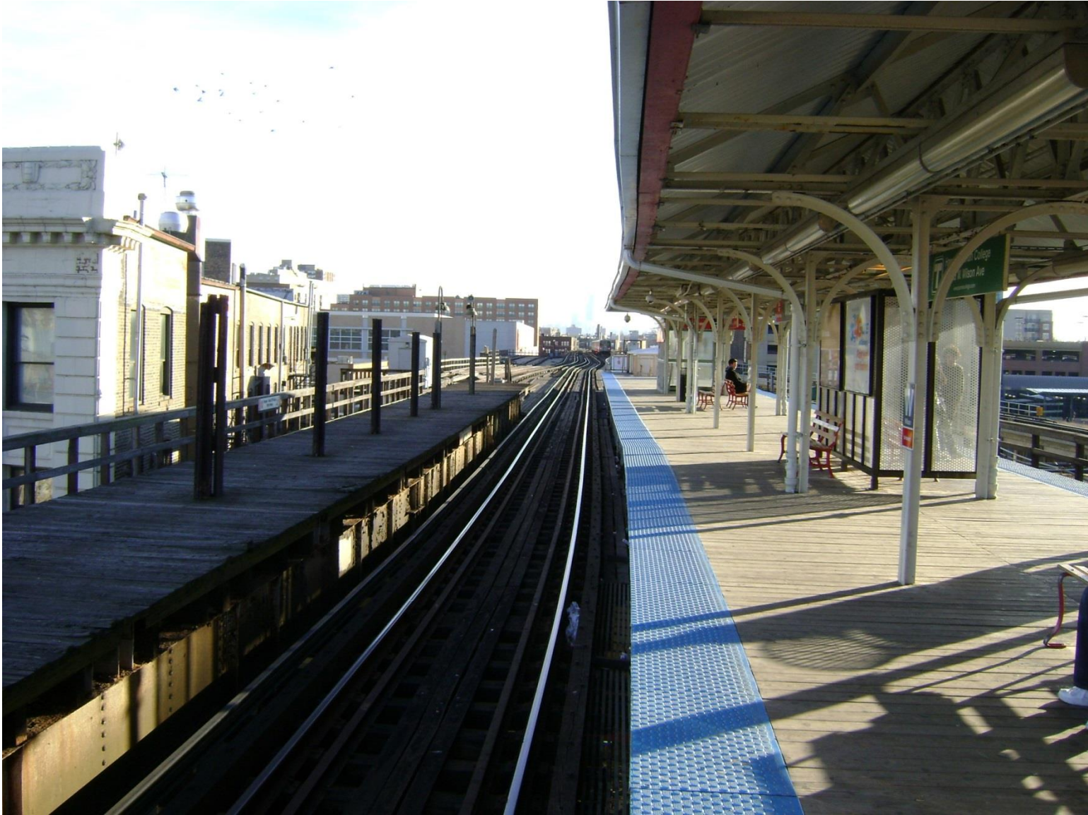
Existing Northbound Platform