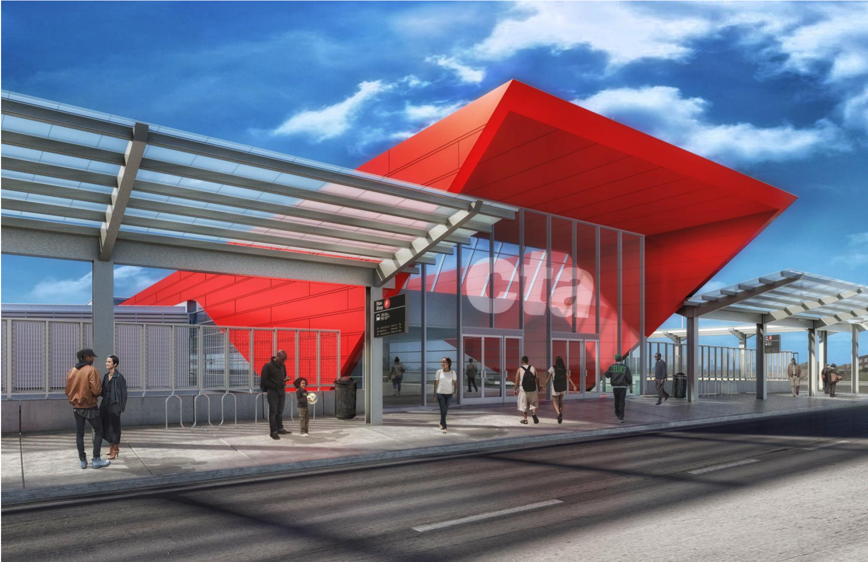
North Terminal Entrance on North Bus Bridge