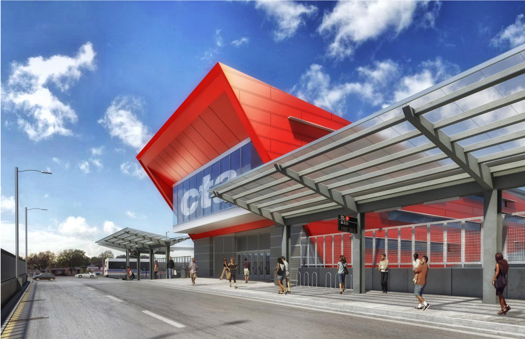
South Terminal Entrance on South Bus Bridge