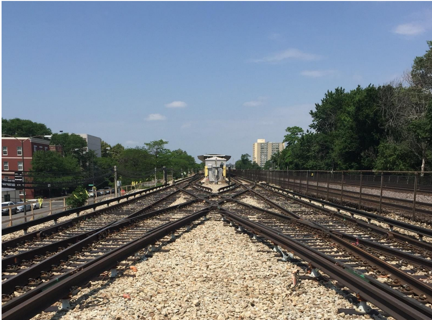
Austin Crossover (Looking West)