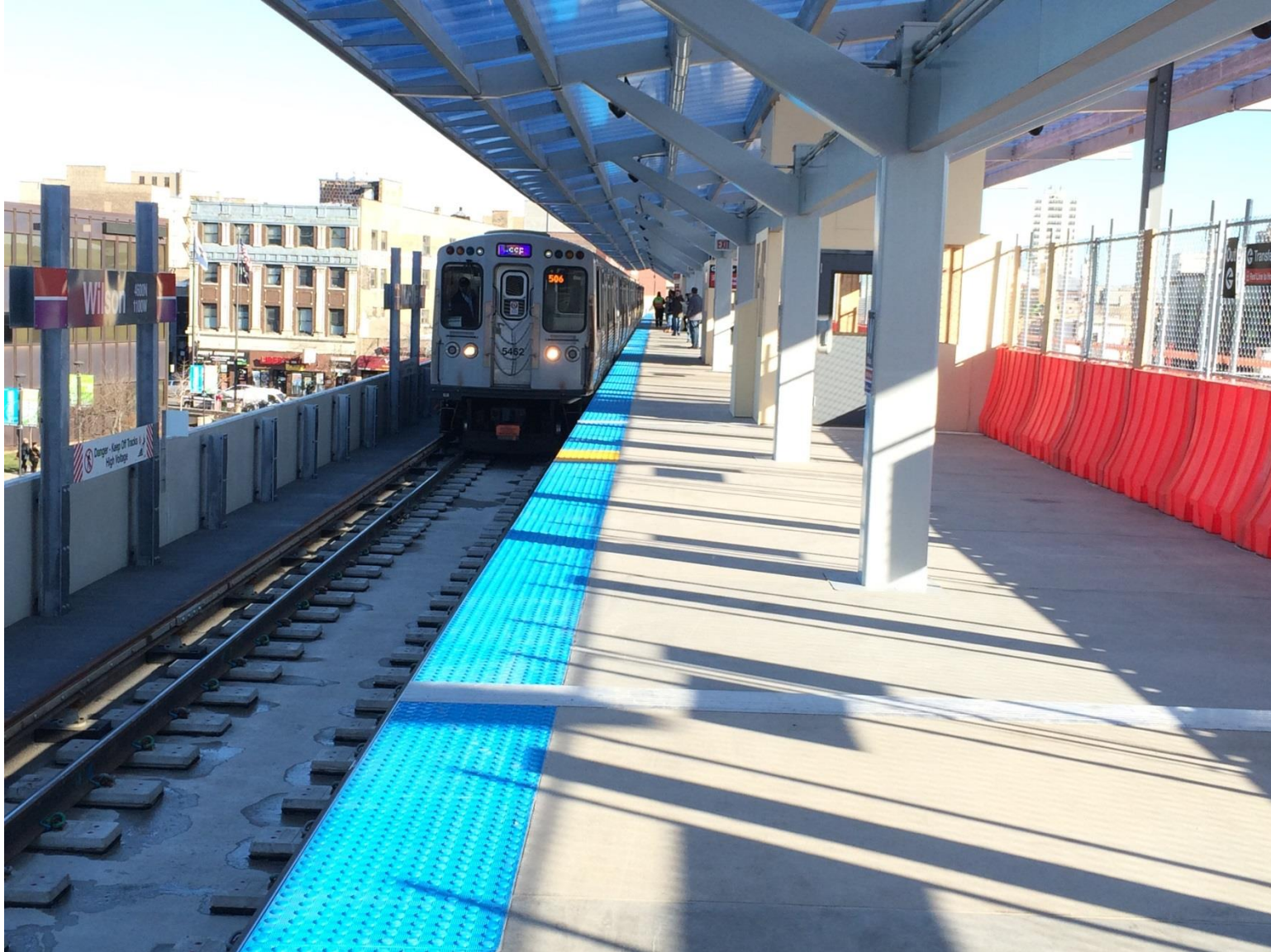
March 2016 – New Southbound Platform (1 st day of service)