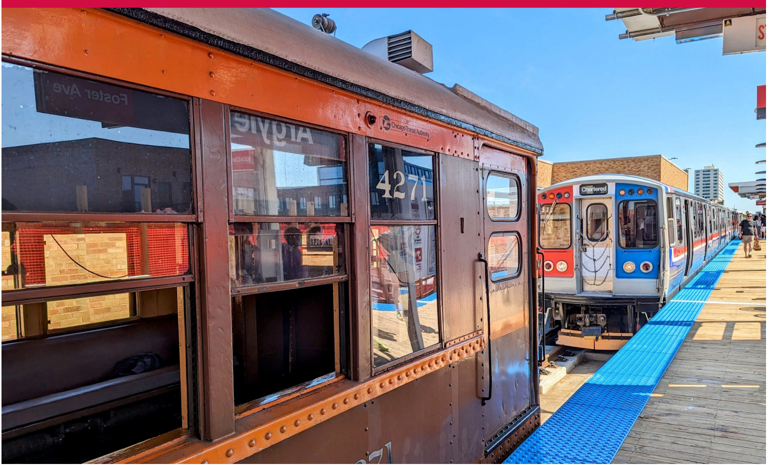
Car 4271-4272, left, and an eight-car group (consist) of the 2400-series, right, make a special photo stop on the newly re-constructed northbound Red Line tracks at the Red and Purple Modernization Project's temporary Argyle station on July 29, 2023. The event commemorated the 100th Anniversary of 4000-series railcars that are maintained by the CTA's Heritage Fleet Program.