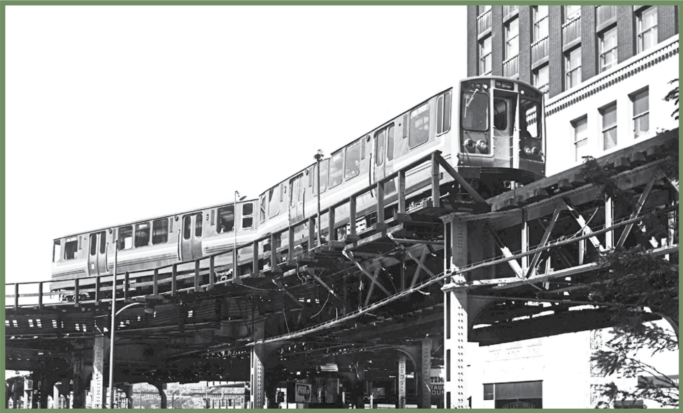
Cars #2401-2402, the first two cars of an order of 200 2400-series cars built by the Boeing-Vertol Company between 1976 and 1978, are seen here on a preview run, turning from Wells to head east above Lake Street on the Loop Elevated. During their life, these cars operated on most of the CTA rail lines at various times. However, by the 2000s, they were used exclusively on the Red, Green and Purple lines. This series of cars ran in their last revenue run on October 31, 2014. While the bulk of the 2400-series cars have been retired and scrapped, a handful of cars remain on CTA property – 24 were retrofitted for work service in the 1990s and continue in that capacity exclusively, while another eight cars have been kept by CTA as heritage cars. Additionally, cars #2433-2434 have been preserved at the Illinois Railway Museum in Union, IL.