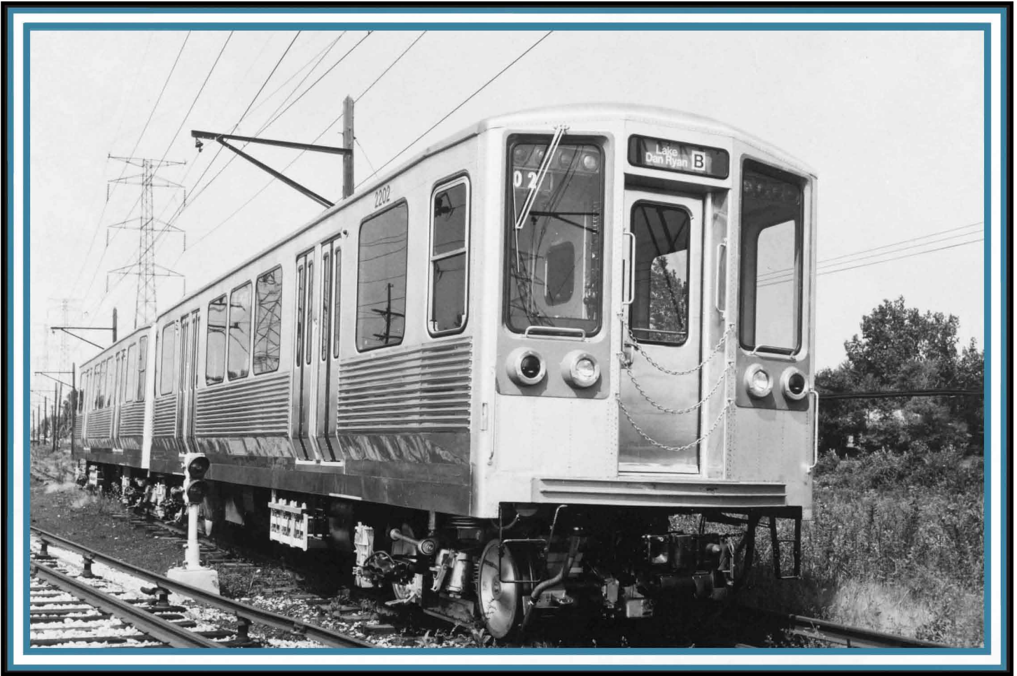
In this photo, rapid transit cars 2201-2202 are seen on the Skokie Shops freight lead, newly arrived from the Budd Company, the first two cars of an order of 150 cars delivered in 1969 and 1970. The delivery of these cars coincided with the opening of the new Dan Ryan line and the extension of the Milwaukee route to Jefferson Park in 1969 and 1970, respectively. With their rectilinear aesthetics and clean lines, the 2200-series cars complimented the modern, International-style design of the new stations opened along the extensions.