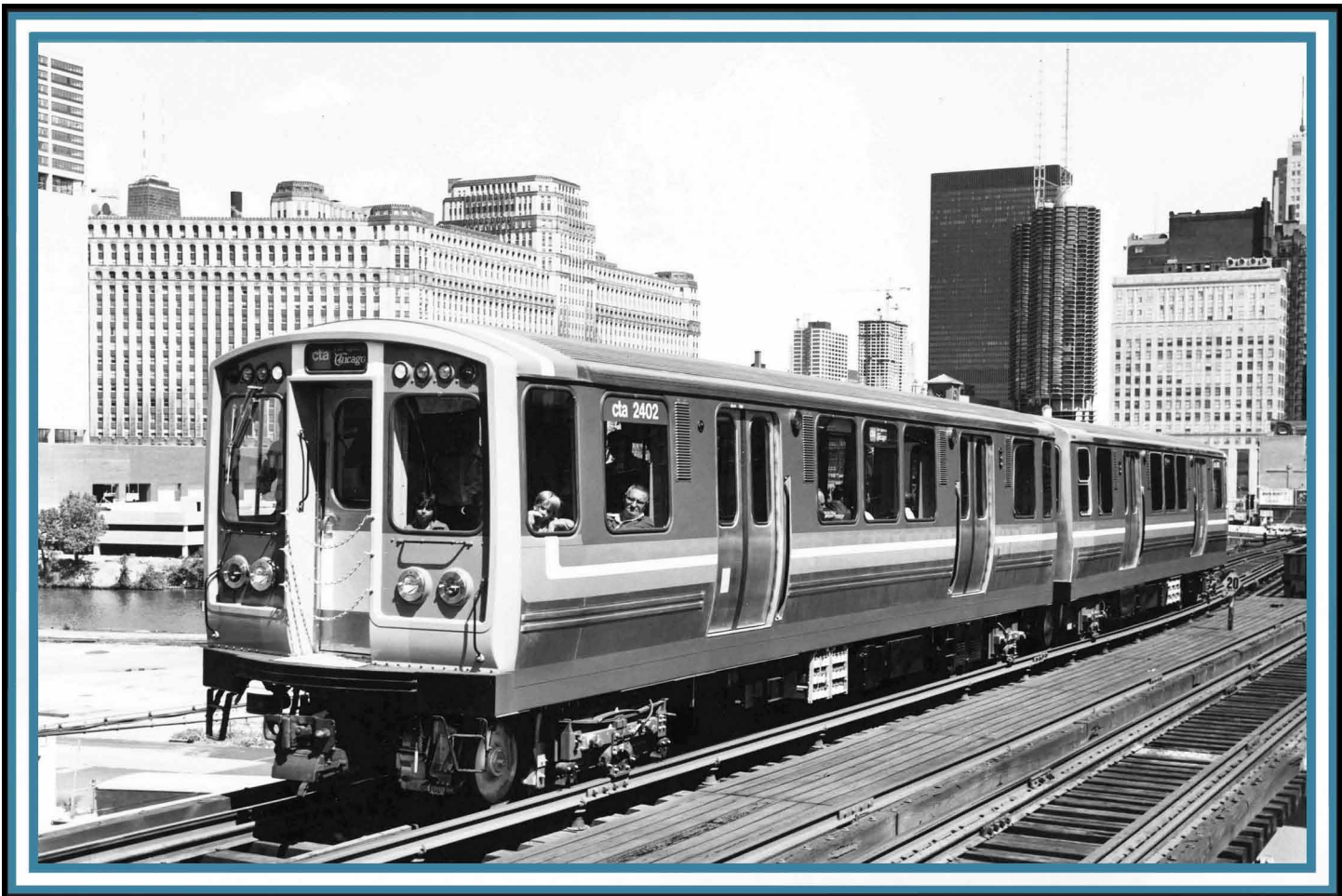
In this August 29, 1976 publicity photo, cars 2402-2401, prototypes of an order of 200 cars built by the Boeing-Vertol Company between 1976 and 1978, are traveling westbound on the Lake Street Elevated, having just crossed over the Chicago River before approaching the Clinton station. During their lifetime, these cars operated on most of the system's lines, with the exception of today's Yellow Line, though they spent most of their lives on the Evanston, North-South, and West-South routes.