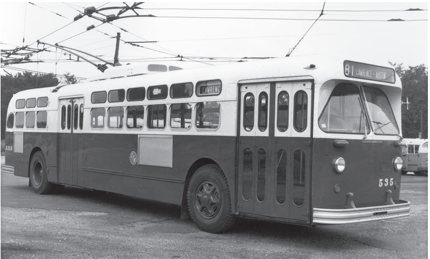
CTA trolley bus #535 (built by the Marmon-Harrington Company in 1951 and later renumbered #9535) had just recently been delivered and was assigned to the #81 Lawrence route. Three-hundred and forty-nine trolley buses of this type were delivered between 1951 and 1952, and operated on various routes until the end of trolley bus service in March of 1973. A number of these buses were sold to Guadalajara, Mexico, where they remained in service until 1993.