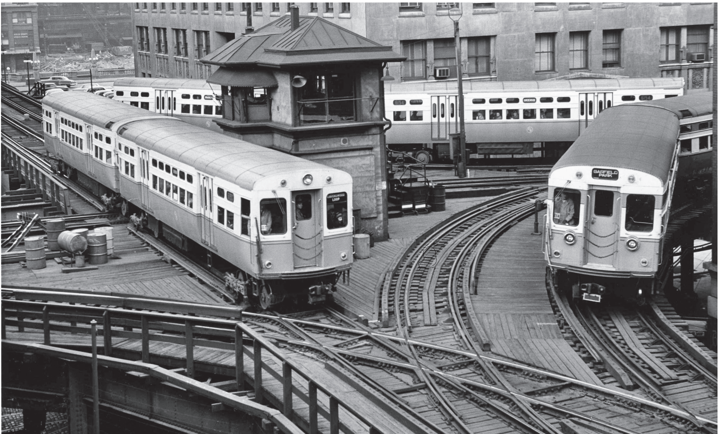
An inbound Ravenswood train is crossing Lake and Wells junction as a Garfield Park train turns south onto Wells Street while a northbound Ravenswood train rounds the curve heading to Kimball. For decades all trains operated in a counterclockwise direction on the Loop. In 1969 the tower was moved from the center of the junction to a new structure in the northwest corner of the intersection. A more modern structure in the same location as the 1969 tower was built in 2009. Today, the junction governs Green and Pink Line trains entering and exiting the Loop from the west, Brown and Purple Line Express trains entering and exiting from the north, and Orange Line trains circling around the Loop and returning to the Southwest Side and Midway Airport.