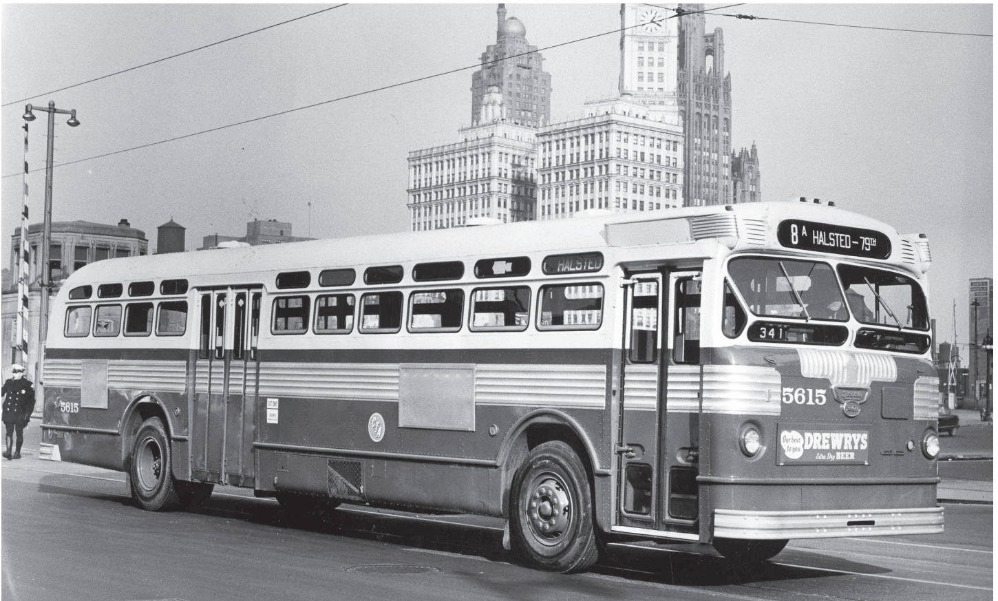
CTA Flexible Twin Coach bus #5615, manufactured by the Flexible Company in 1953, is posed on State Street at Wacker Drive. These buses were fueled by liquefied petroleum gas (propane). Chicago was one of the largest users of propane buses, with a fleet of 1,700, built by such companies as Fageol Twin Coach, Flexible, Mack, and ACF-Brill between 1950 and 1962. No doubt photographed to promote the modernization of CTA's fleet, the staged nature of the photo is revealed by the bus's destination signs – route #8A is a south extension of the Halsted Street bus and begins about 10 miles south of State and Wacker! The route designation #8A also didn't come into use until more than 20 years after the photo was taken; the route was designated #42B at the time.