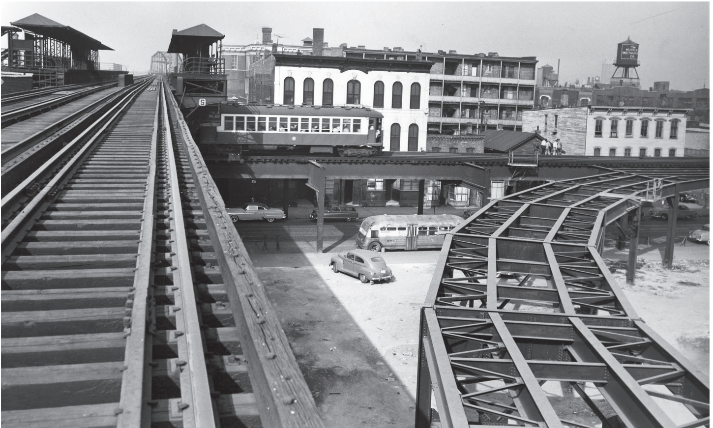
A Loop-bound Lake Street train consisting of 4000-series cars, led by a "Plushie" type car (built by the Cincinnati Car Company between 1922 and 1924), travels east. Pictured above it are the original Logan Square 'L' tracks and the Lake Street Transfer station, no longer in use at the time of the photo. Under construction is the connection between the two routes to form what would eventually become known as the Paulina Connector. The Connector allowed Douglas Park trains to reach the Loop during the 1954-58 period when its old route to the Loop was demolished to allow for construction of the Eisenhower Expressway and the Congress rapid transit line. Today, the connector is used by Pink Line trains to and from the Loop.