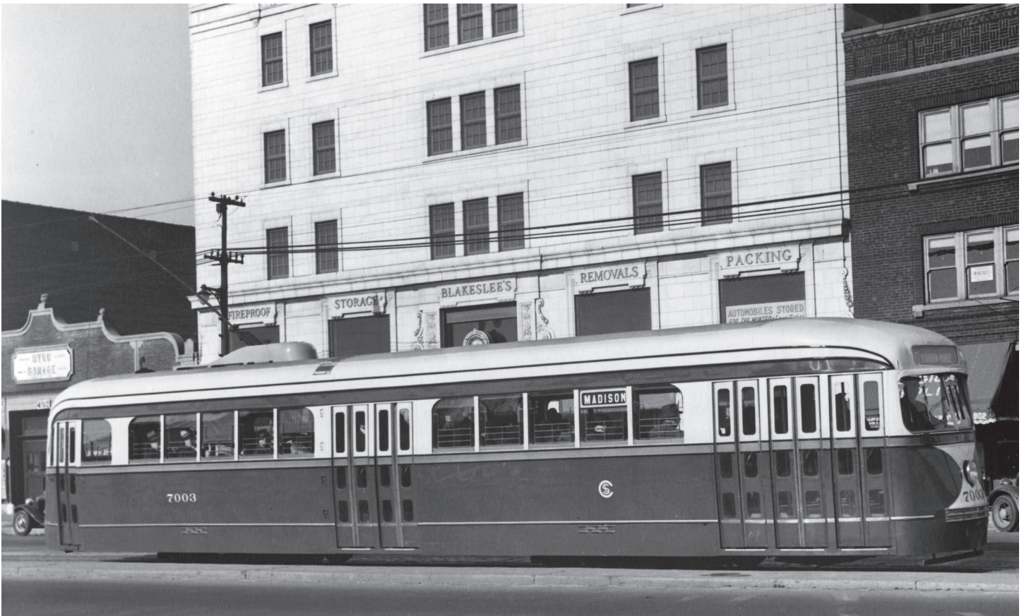
Chicago Surface Lines "Blue Goose" streetcar #7003, one of 83 built in 1936 by the St. Louis Car Company, heads toward the Loop along Madison near Cicero. The #20 Madison route was the first to receive these cars, nicknamed PCC cars for the Presidents Conference Committee. The Committee, comprised of the heads of the various street railways in North America, developed a standardized state-of-the-art streetcar design to provide a modern vehicle that would appeal to the public and be economical to produce. PCCs saw service in many American cities, including Chicago, Brooklyn, Baltimore, Boston and Pittsburgh.