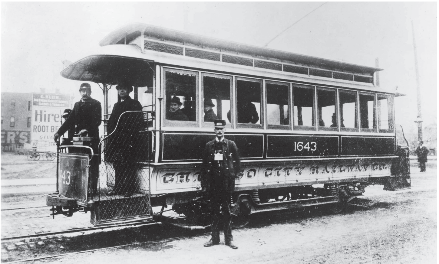
Car #1643 was an example of Chicago's first electric streetcars. The car was originally built for the Chicago City Railway, a predecessor of the Chicago Surface Lines. The introduction of electric streetcars launched significant improvements in the quality and efficiency of transportation to and from Downtown, helping to promote the establishment and growth of new neighborhoods. The streetcar system was absorbed into the Chicago Transit Authority in 1947.