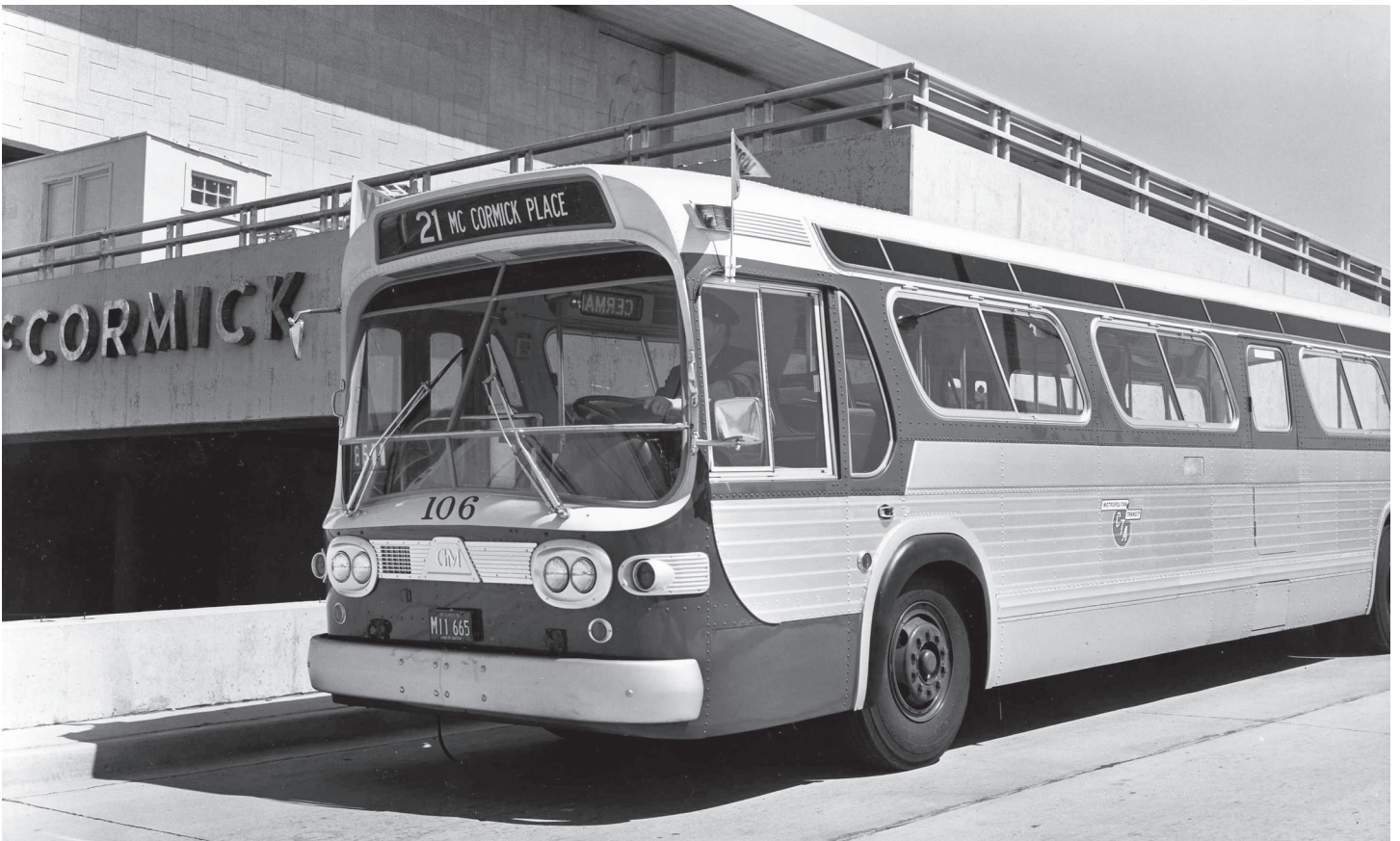
CTA #106 is pictured next to the original McCormick Place, which opened in November 1960. Manufactured by General Motors in 1961, this “New Look” bus included a number of progressive features such as large, double windows, fluorescent lighting and bright interiors. The bus is working the “Green Pennant Special,” a special event route that operated between McCormick Place and the Loop during the 1960’s. At the time, there was no direct bus service from the Loop to McCormick Place, so for some conventions and trade shows this special express route was operated via Lake Shore Drive. The buses were marked with green pennants on the front that said “SPECIAL”.