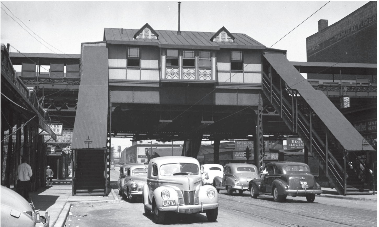
A mid-1940's view of the Lake Street Elevated Halsted station looking north on Halsted at Lake. The station was demolished in 1994 during the Green Line renovation. Similar stations remain in service today on the Green Line at Ashland/Lake and Conservatory-Central Park Drive.