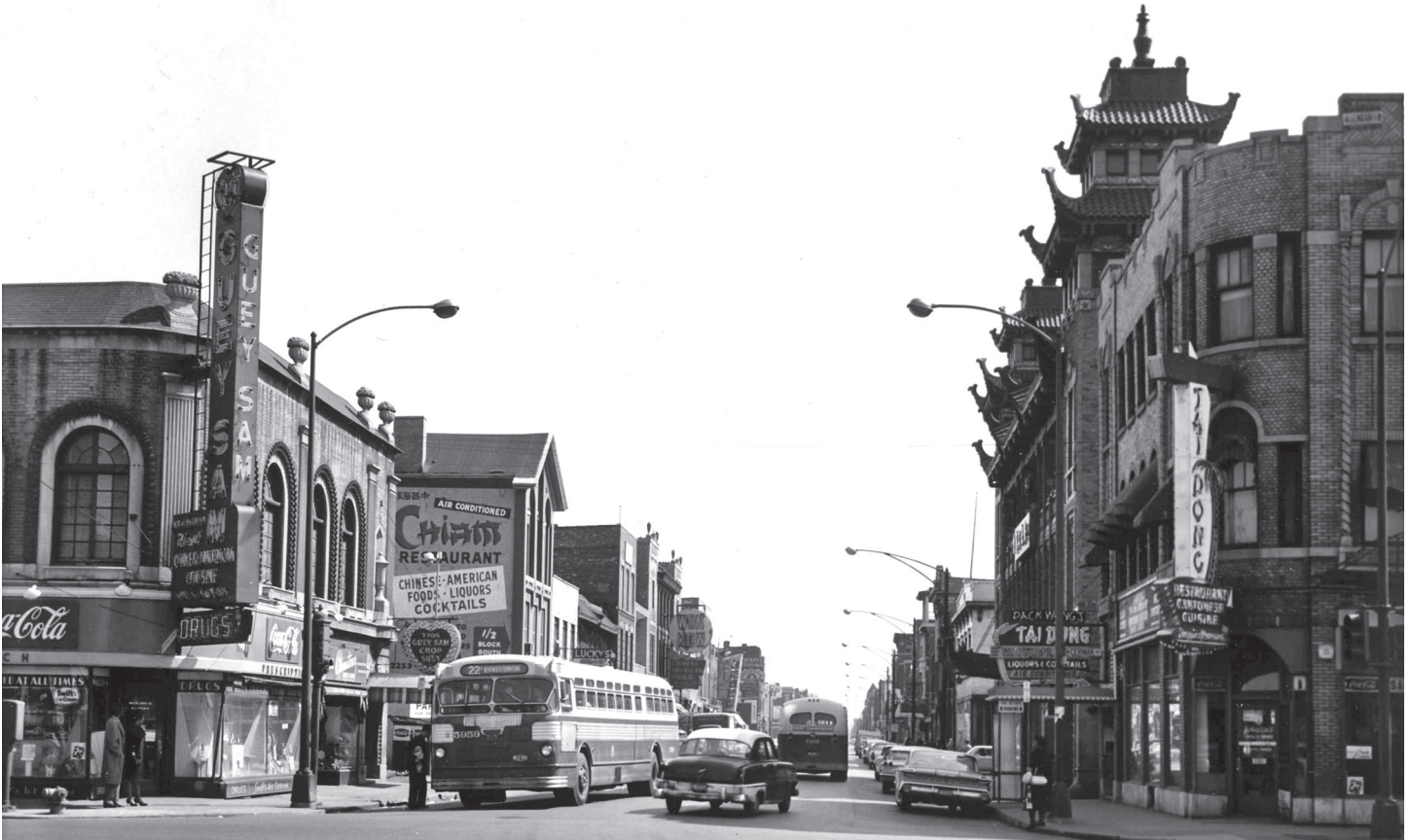
CTA #5959, manufactured by the Flixible Company in 1955, on its way northbound to downtown boards a passenger on Wentworth at Cermak in Chinatown in 1961. The bus was part of a fleet of 1,700 propane buses delivered from several manufacturers between 1950 and 1962. Aside from the addition of the Chinatown gateway arch, the Chinatown streetscape remains much the same today. The Won Kow Restaurant on the east side of the street continues to serve the community today.