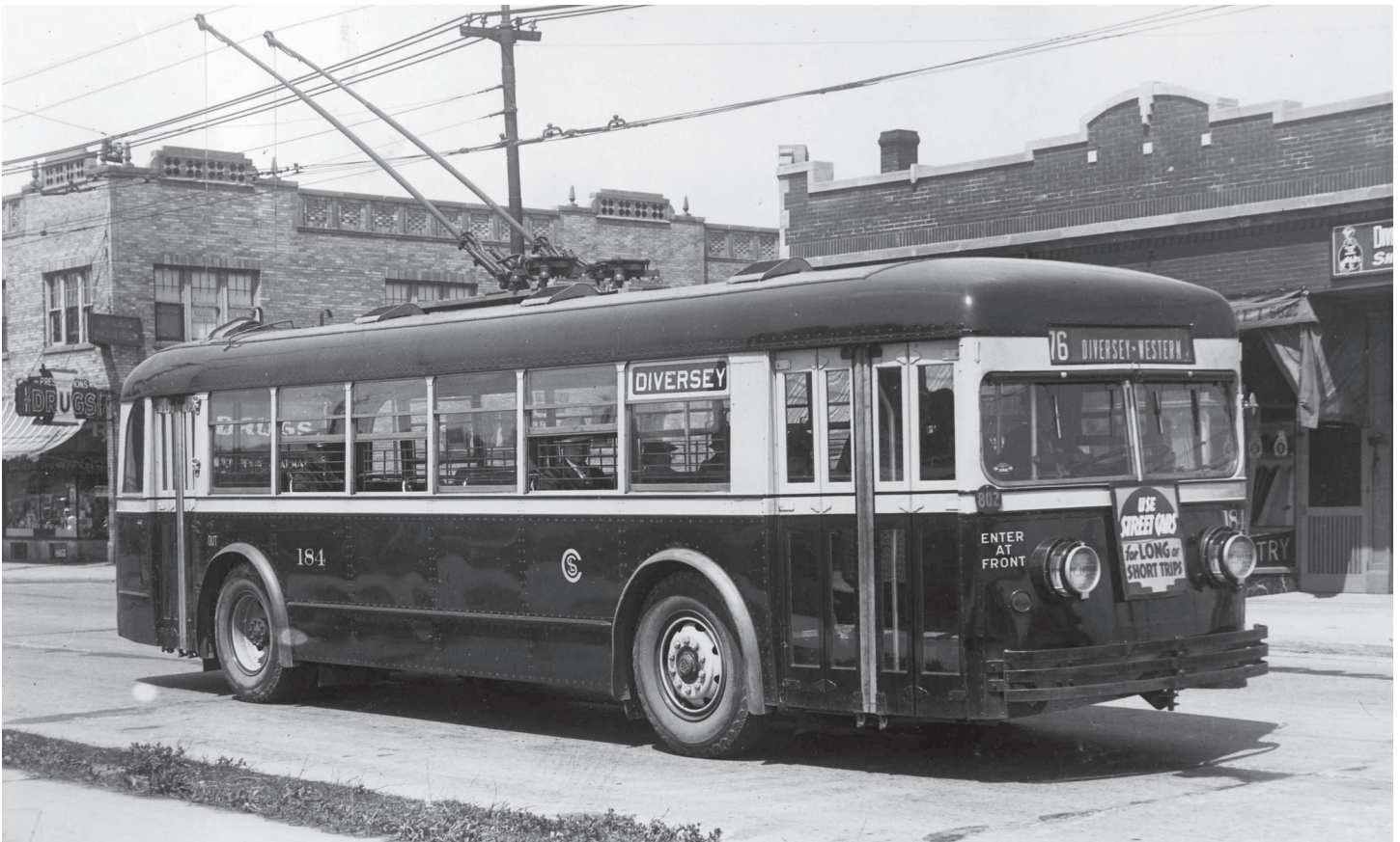
Built in 1936 by the St. Louis Car Company, Chicago Surface Lines trolley bus #184 heads eastbound via Diversey to Western. Trolley bus service was first introduced in Chicago on the #76 Diversey route in 1930. Other trolley bus routes were soon added, some as extensions of existing streetcar lines and later as conversions of streetcar lines to trolley bus service. Trolley bus extensions to existing streetcar lines were an economical way to serve new neighborhoods that were established in outlying parts of the city.