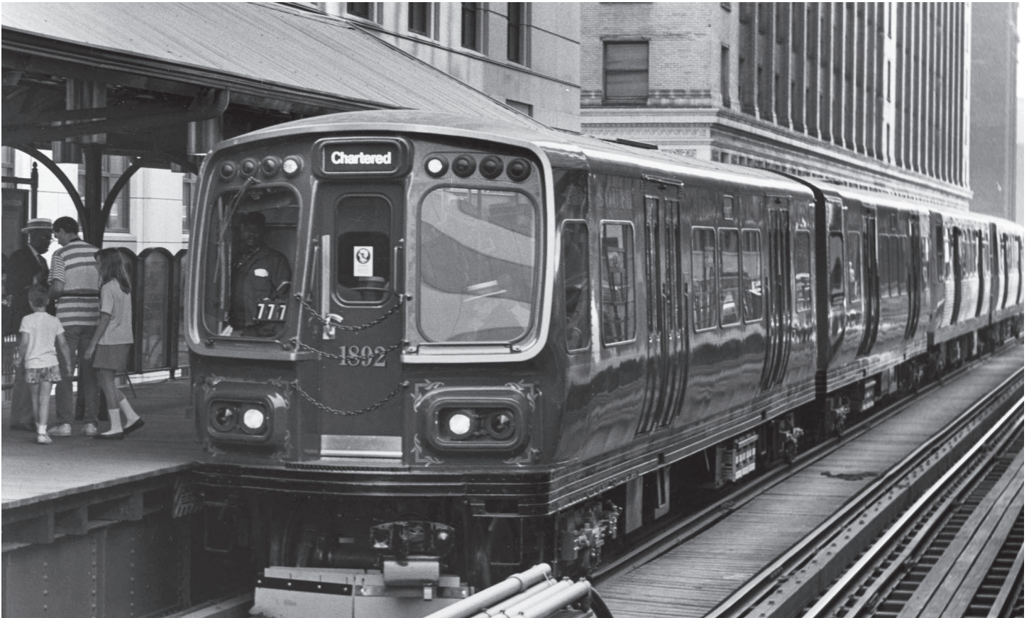
In 1992, CTA marked the 100th anniversary of Chicago's first elevated railway by painting a two-car set of Pullman 2000-series cars in the colors of the cars originally built for the South Side Rapid Transit in 1892. The commemorative cars traveled throughout the system during the anniversary. In this photo, cars #1892 (#2007) and #1992 (#2008) are leading a southbound, four-car train on Wells at Quincy station. Delivered to CTA in 1964, the 2000-series cars were the last rapid transit cars built by the Chicago-based Pullman-Standard Company for the "L" and were the first cars equipped with air conditioning. All were retired in 1994.