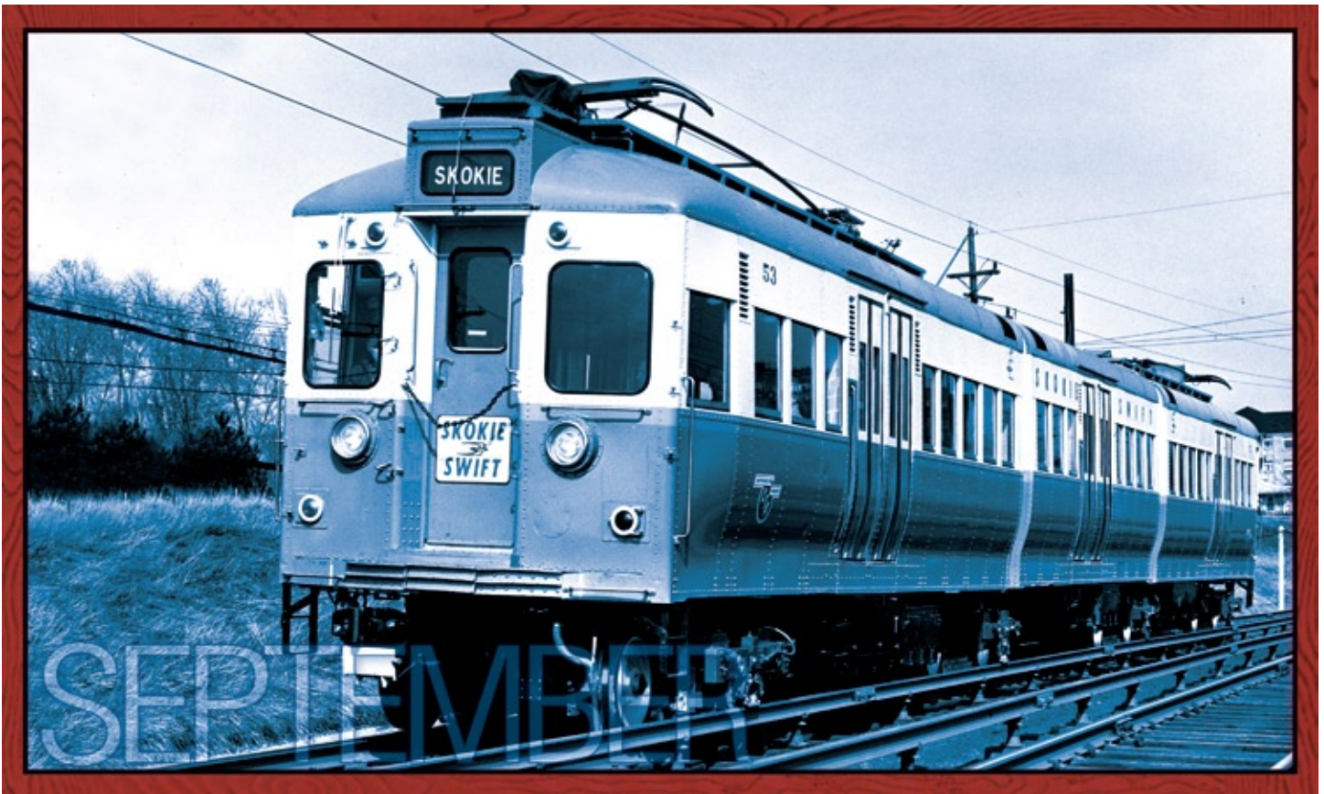
A three-car section articulated rail car is seen operating on the Skokie Swift rapid transit line near Ridge Avenue in April 1965. Four prototype cars were ordered by the Chicago Rapid Transit Company in 1946. Two cars were built by the Pullman-Standard Car Company (cars 5001 and 5002, later renumbered 51 and 52), and the other two were built by the St. Louis Car Company (cars 5003 and 5004, later renumbered 53 and 54). The 5000-series cars served as prototypes for the later 6000-series rapid transit cars built by the St. Louis Car Company between 1950 and 1959.