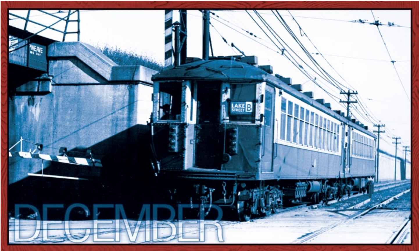
A two-car train of 4000-series 'L' cars built by the Cincinnati Car Company circa 1923, crosses Pine Avenue along the Lake Street rapid transit line. Lake Street trains descended from the elevated structure to grade level just west of Laramie and continued to operate alongside the Chicago & North Western Railway embankment to the Forest Park terminal just west of Harlem Avenue until 1962. Today, Green Line trains operate on top of the embankment.