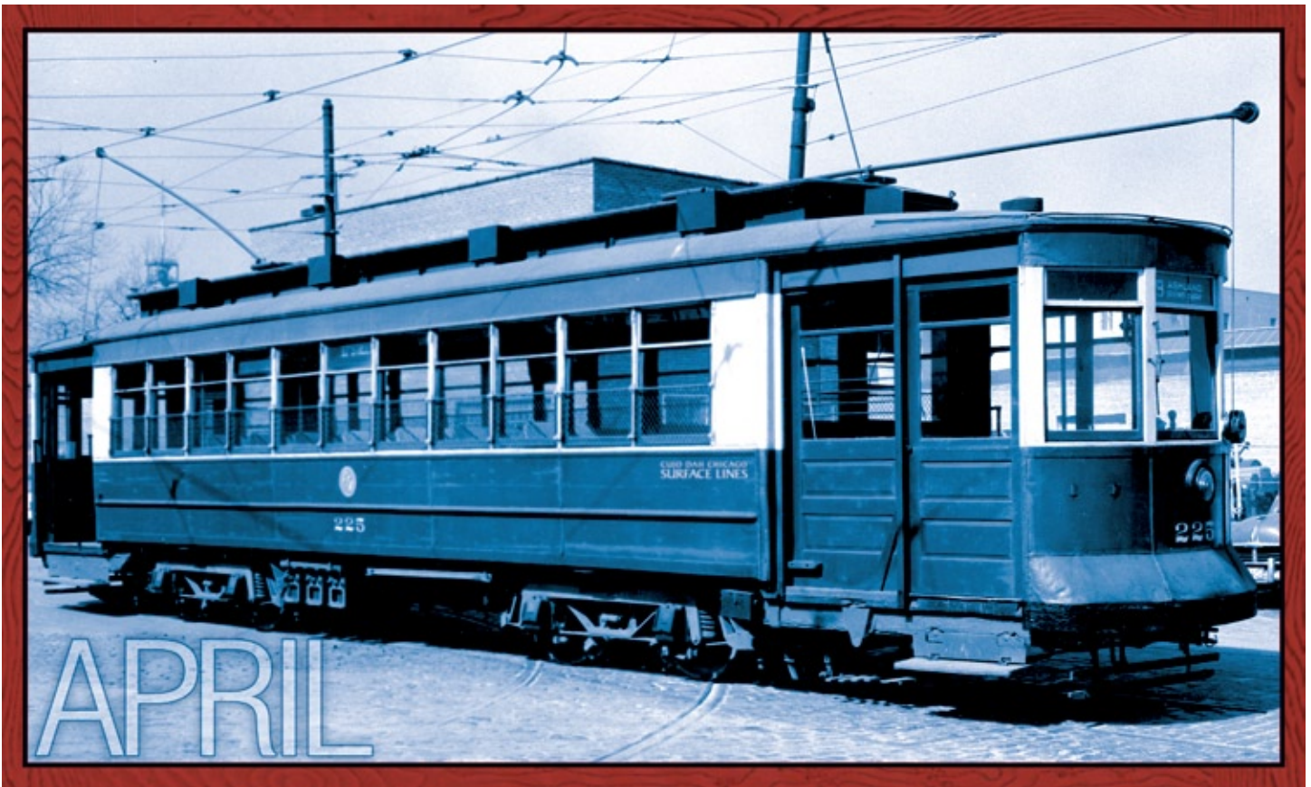
Chicago Surface Lines #225 “Old Pullman” streetcar, built by the Pullman Car Company in 1908, is most likely already out of service and being used on a fantrip at the time of this photo. These streetcars, known affectionately as the “Red Rockets,” served Chicago until May 30, 1954. Car #225 is currently preserved at the Seashore Trolley Museum in Kennebunkport, Maine.