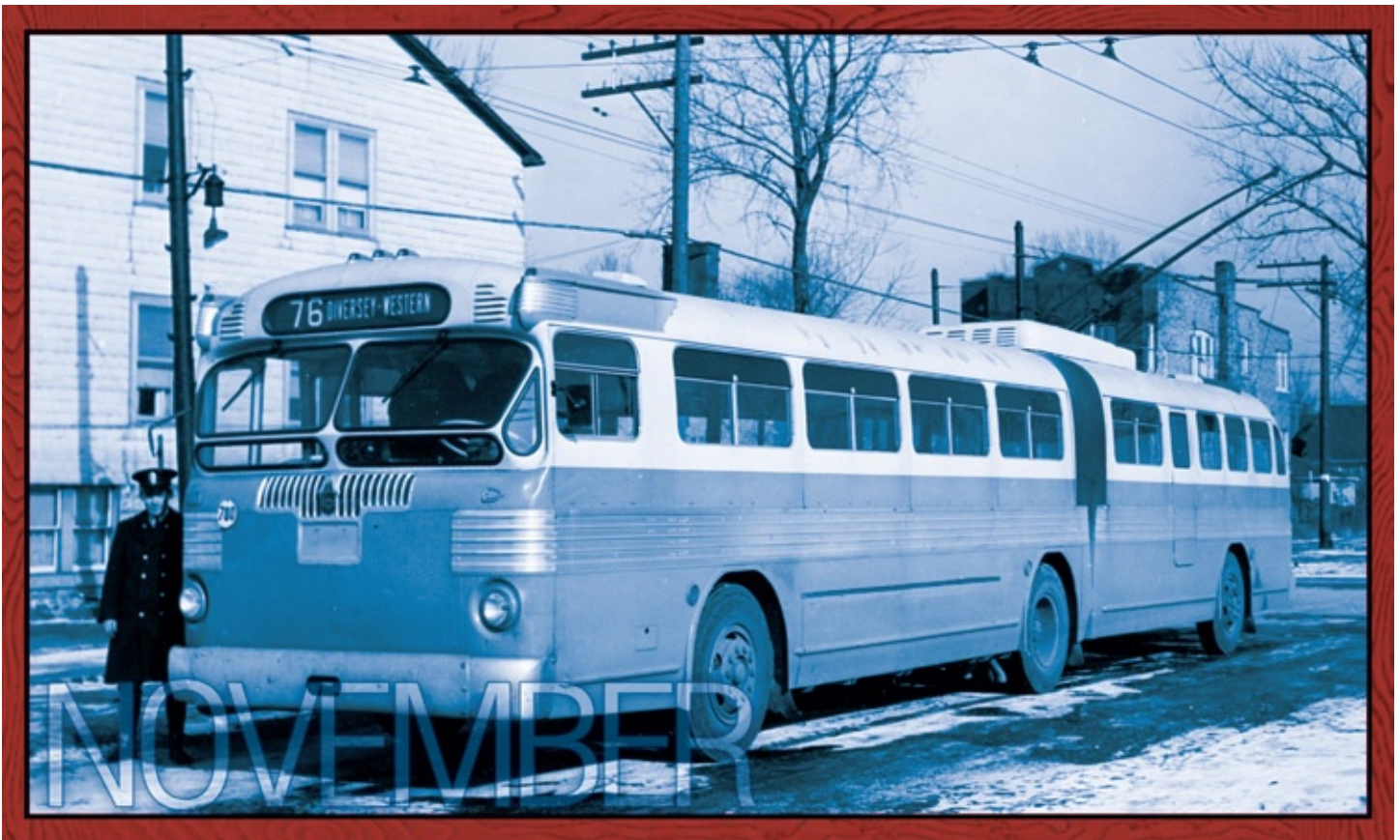
Chicago's "Queen Mary" trolley bus (built by Twin Coach in 1946) was assigned to the #76 Diversey route. Originally built with two gasoline engines in 1946, it was converted to electricity in 1948 and spent its entire service life on either the #76 Diversey or #77 Belmont routes. Once leased, the "Queen Mary" was bought by the CTA in 1954 and renumbered #9763. It was retired in 1963 and is preserved at the Illinois Railway Museum in Union, Illinois.