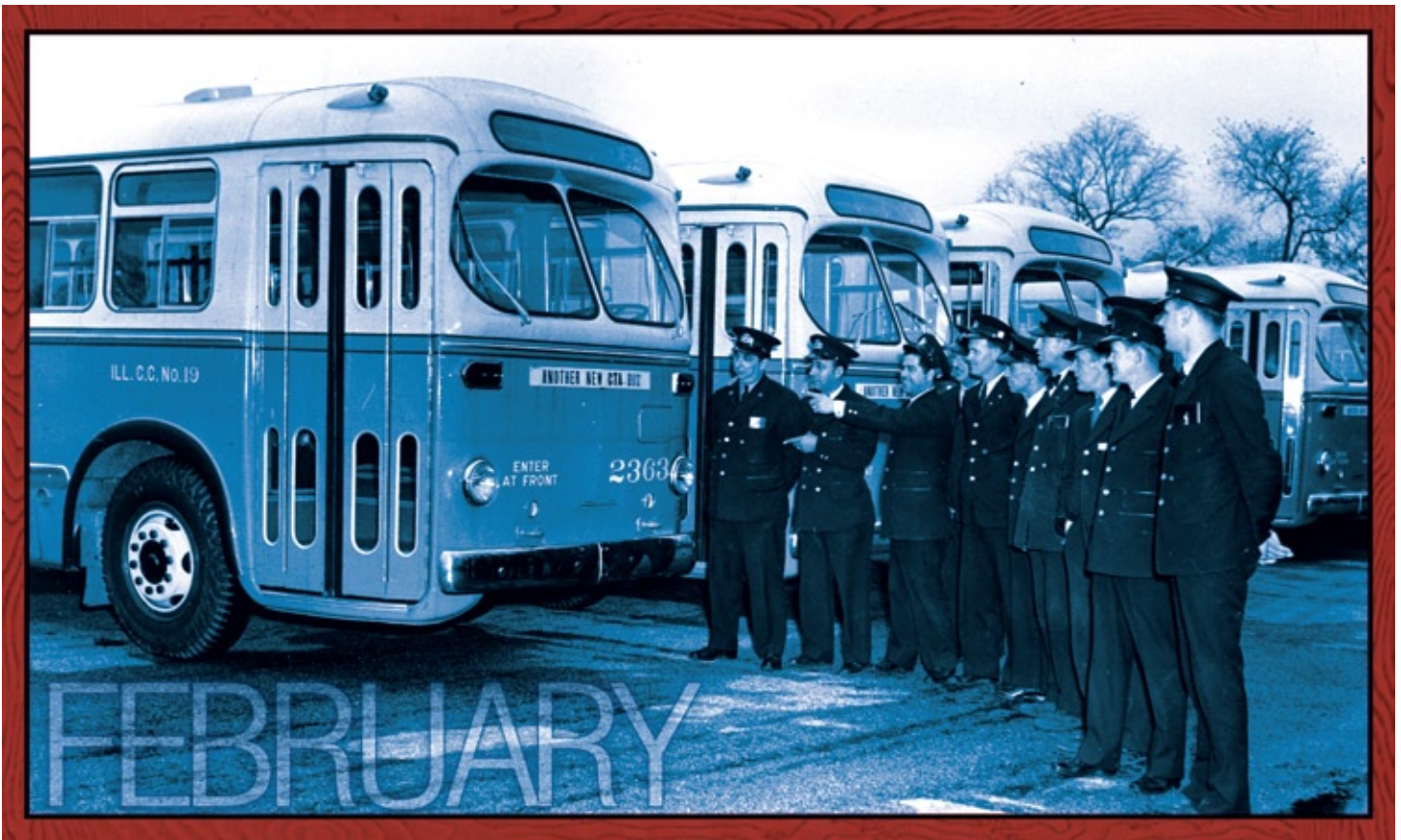
A lineup of new buses built in 1947 by ACF-Brill Company awaits the inspection of smartly clad bus operators. This group of Brill buses were ordered by the Chicago Surface Lines (CSL), but delivery was taken after the Chicago Transit Authority assumed CSL's operations. As part of its modernization program, CTA would accelerate the acquisition of new buses in the years that followed. Ultimately, a policy decision was made to phase out streetcars in favor of the new buses.