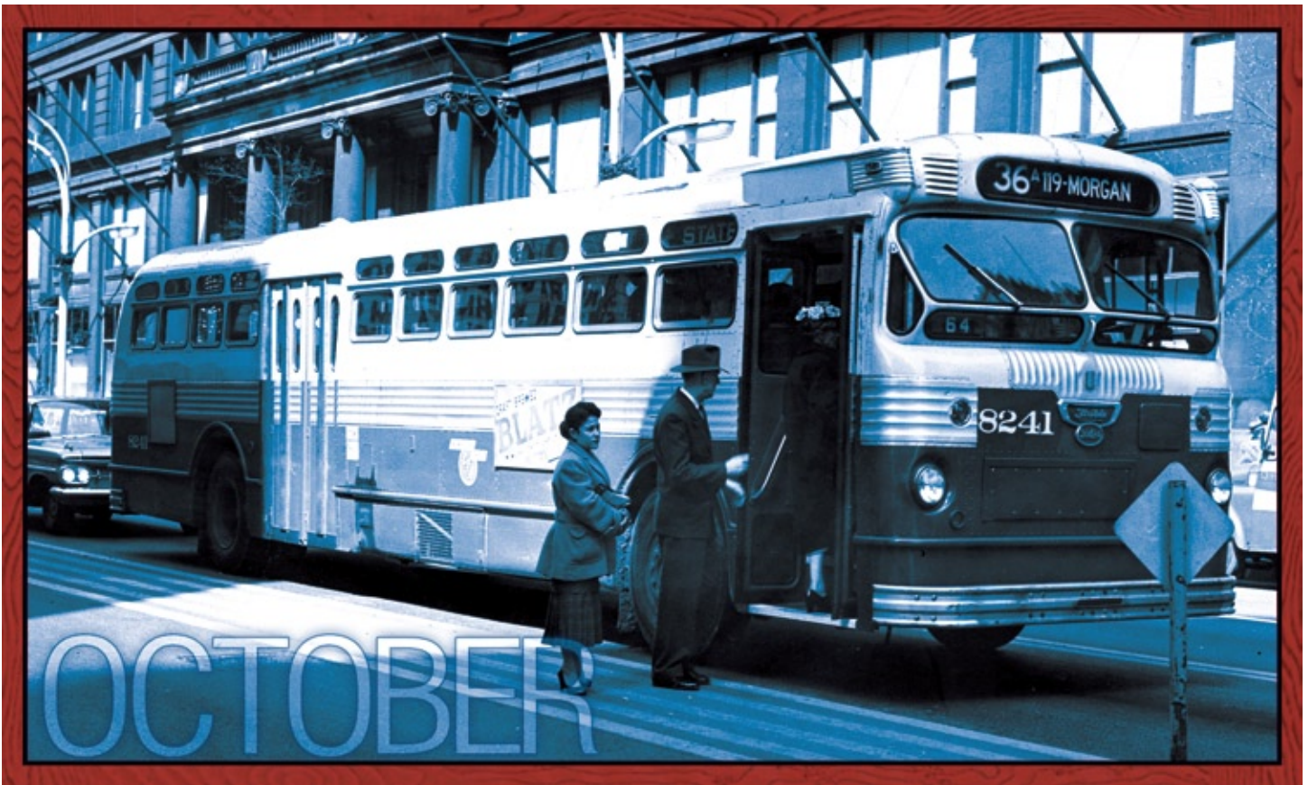
CTA #8241, manufactured by the Flxible Company in 1958, is boarding passengers in front of Marshall Field's on State Street at Washington. These buses were fueled by propane. CTA had one of the largest fleets of propane-powered motor buses, 1,700 in all, built by such companies as Fageol Twin Coach, Flxible, Mack, and ACF-Brill between 1950 and 1962.