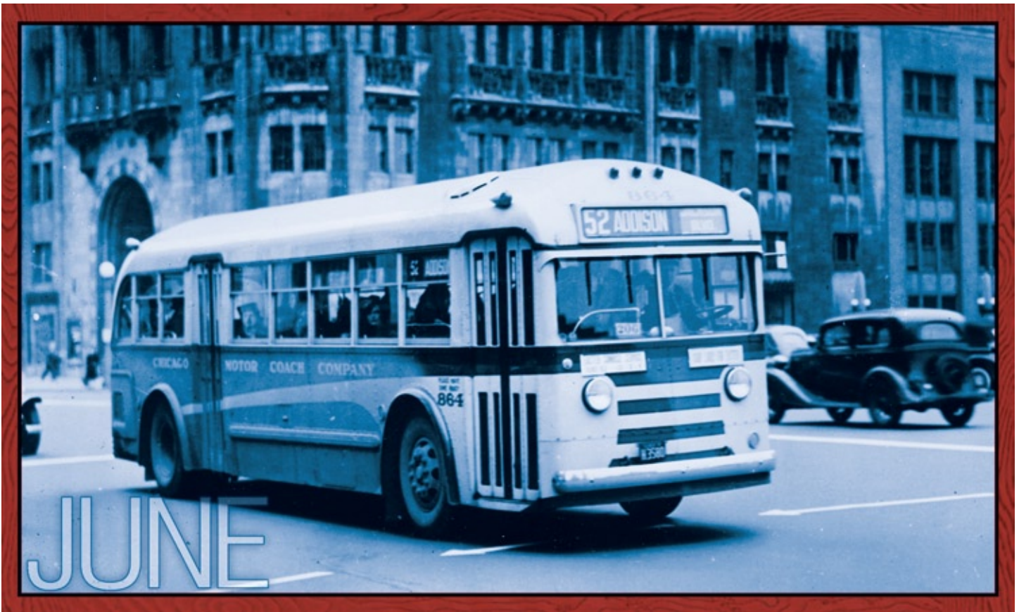
It is 1939, and Chicago Motor Coach Company bus #864 signed for the #52 Addison route has just passed the Tribune Tower heading southbound on Michigan Avenue. Most Chicago Motor Coach routes operated on streets and boulevards not served by the Chicago Surface Lines. Its routes, rolling stock and property became part of the Chicago Transit Authority in 1952.