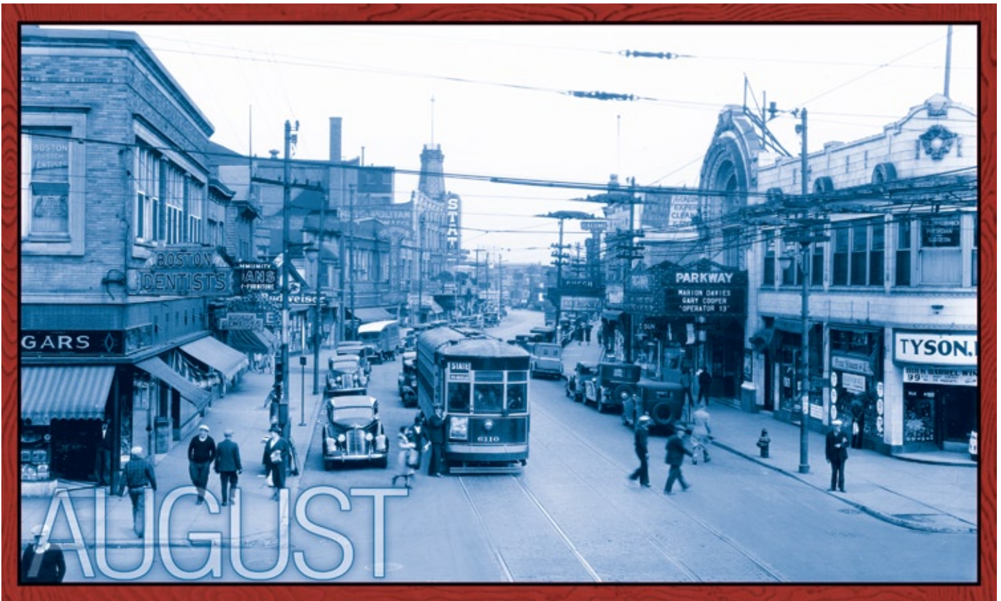
This view, taken in October 1934, is looking north on Michigan Avenue at 111th Street. Chicago Surface Lines streetcar #6110 has been traveling on Michigan Avenue from 95th Street, and is on its way to the end of the line at 119th and Morgan. The State and Parkway theatres seen here were among numerous neighborhood theatres that once thrived all over the city in the days before television.