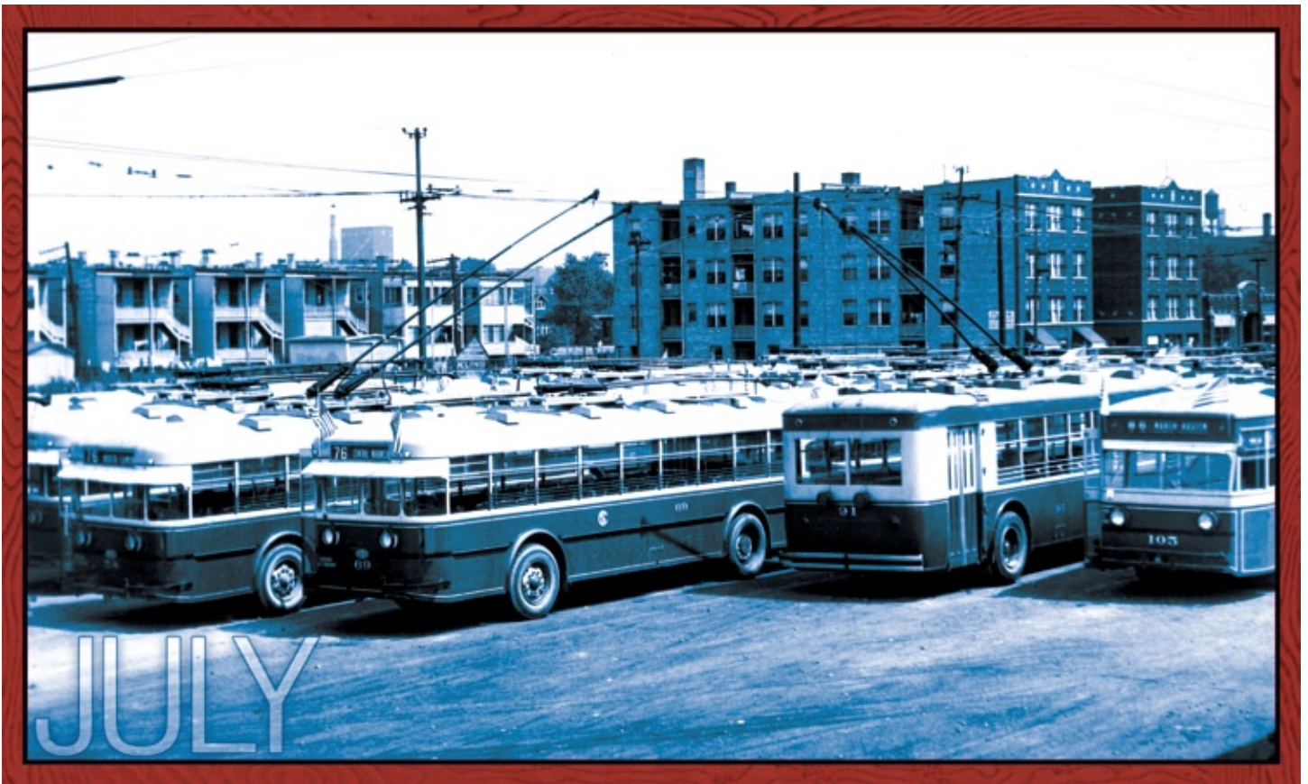
This 1930's view of the yards at the North Avenue Depot shows the city's first trolley buses ordered by the Chicago Surface Lines (which was incorporated into the Chicago Transit Authority in 1947). These trolley buses were used primarily on the north side of the city. As new neighborhoods grew beyond the ends of the streetcar lines, trolley buses were used to extend these routes, and later, as replacements for streetcar lines.