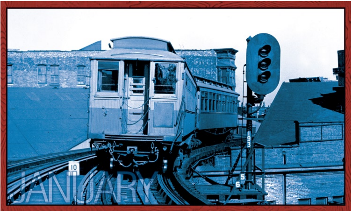
This two-car train of wooden “L” cars (built circa 1900) takes the curve heading for Logan Square and Humboldt Park, cutting through the roof of the Dreamland Ballroom just west of Marshfield Junction. Similar wooden elevated cars operated in Chicago from the beginning of rapid transit service in the 1890s until the end of 1957. Today, this location is in the Eisenhower Expressway where the Pink Line trains cross over the expressway and the Blue Line to Forest Park.