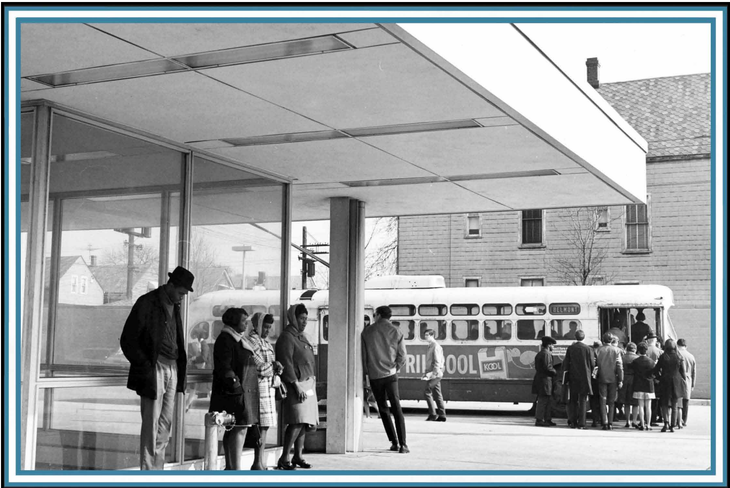
It is April 14, 1970, and a westbound trolley bus is loading a large crowd of passengers at the recently opened Belmont subway station of the West-Northwest rapid transit line that has just been extended from Logan Square to a new terminal at Jefferson Park. The Belmont station was built with an off-street bus terminal to facilitate intermodal transfers. The bus shown here was built by the Marmon-Herrington Company, and was part of the last trolley bus order by the CTA.