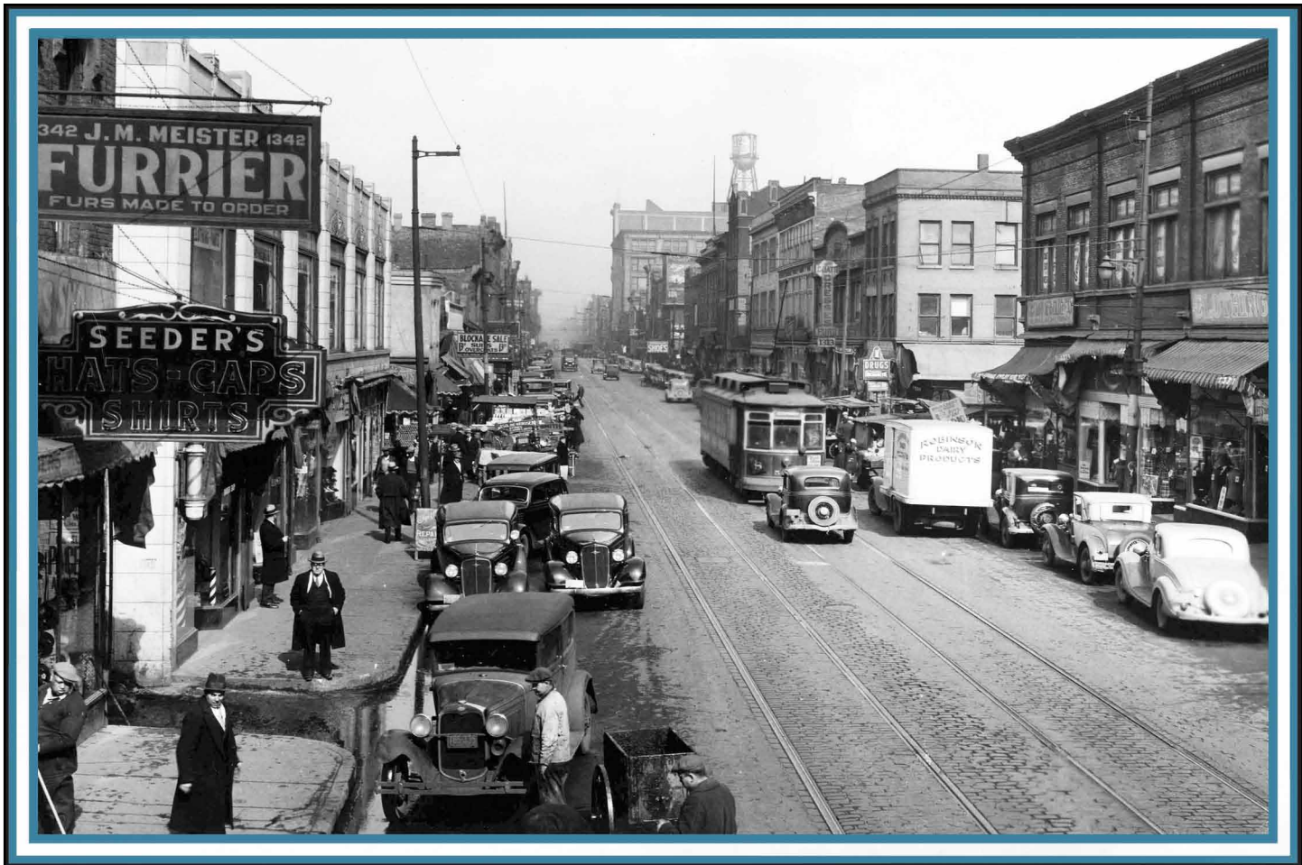
It's business as usual on March 5, 1935, as a "Red Rocket" streetcar, built by the Brill Company for the Chicago City Railway between 1907 and 1908, trundles its way northbound along Halsted, passing through the famous Maxwell Street Market. Almost everything in this photo is gone today, including the streetcars; the entire area is part of the University of Illinois at Chicago Campus, and the market has been relocated.