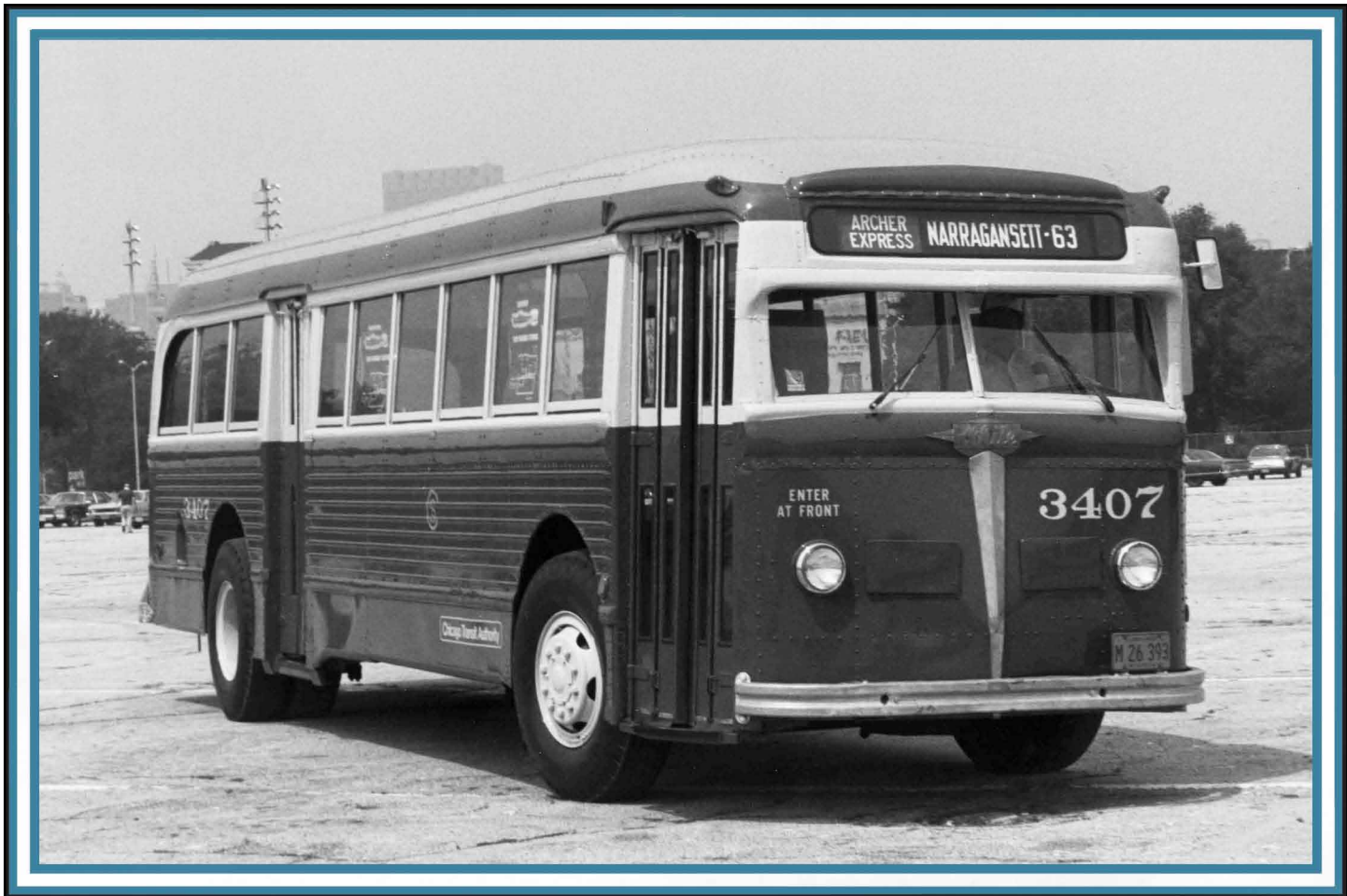
In this photo we see bus 3407 posed at Soldier Field circa 1980 after being restored by CTA, sporting the well-known CSL red and cream livery, looking very much like the day it began service. It was manufactured by the White Motor Company as part of one of several orders for gasoline-powered buses delivered between 1944 and 1948 that totaled 297 buses, and operated in passenger service until 1959. This bus is currently preserved at the Illinois Railway Museum in Union, Illinois.