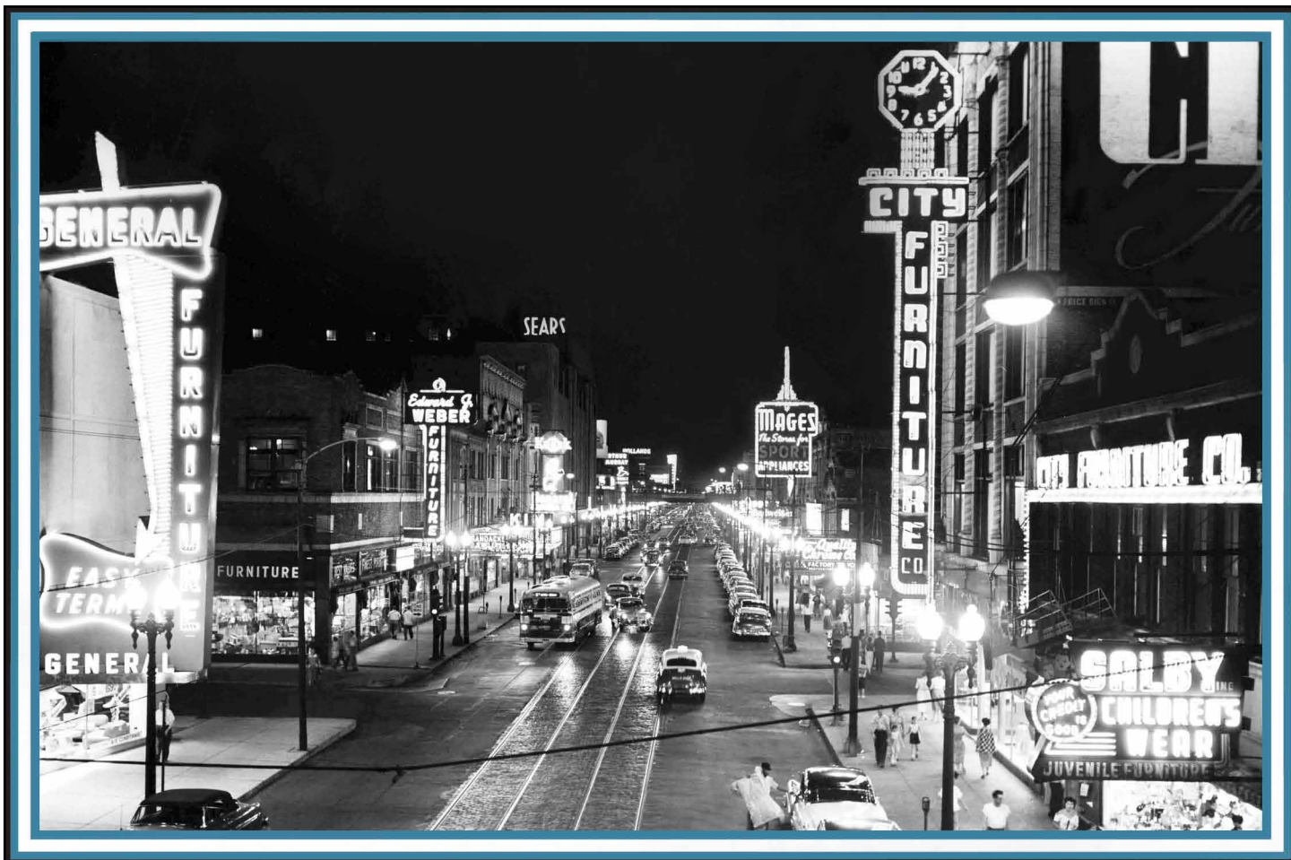
It is a warm summer evening in May of 1955 as shoppers are strolling along Halsted window-shopping. In this 1950s view looking south from 62nd Street, a wide variety of stores on both sides of the street can be seen as far as the eye can see. By this time, buses have replaced streetcars on the #8 Halsted route, as propane bus 5764 makes its way northbound on Halsted at 62nd. 63rd and Halsted was the largest and busiest shopping district outside of the Loop.