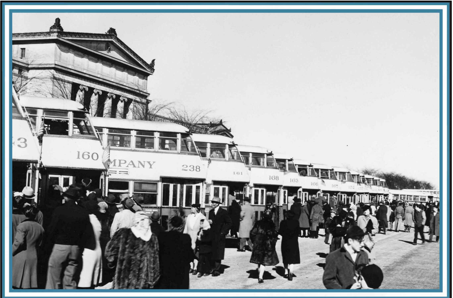
It is April 6, 1946, and Chicago's Army Day celebration at Soldier Field, which included addresses by President Harry Truman and General (later President) Dwight Eisenhower, has just ended. Crowds of people are heading to a lineup of Chicago Motor Coach buses for their trips home.