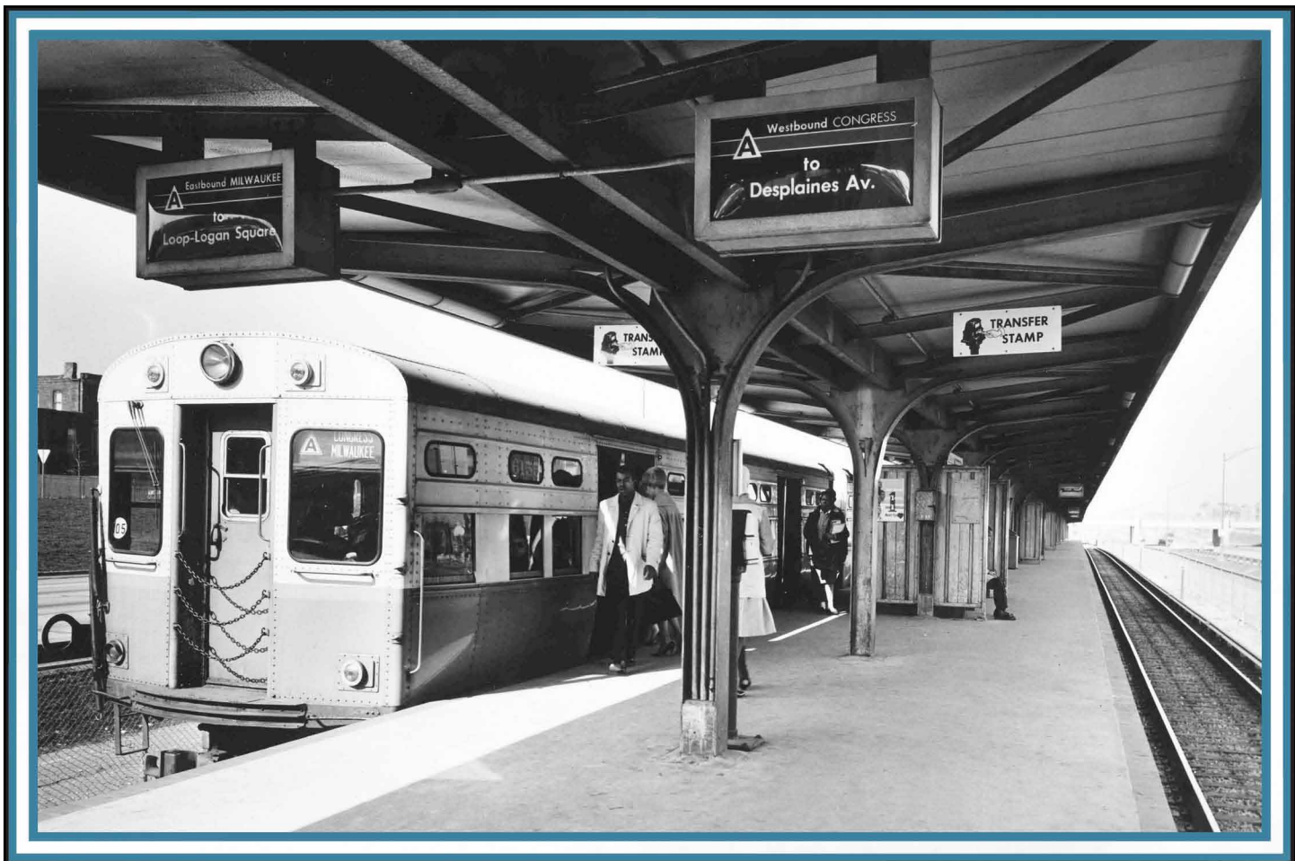
An inbound train of 6000-series rapid transit cars is seen boarding and alighting passengers at the Western station of what was then known as the Congress line of the West-Northwest Route, now part of today's Blue Line, on its way to Downtown and Logan Square. The Western station was typical of the stations along the Congress line. They were unique in that they were the first rapid transit stations to be set in the median of an expressway.