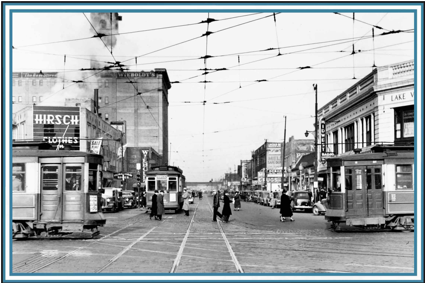
There's a flurry of activity in this 1940's view, looking north on Ashland at Lincoln/Ashland/Belmont, as neighborhood residents go about their daily errands. Two Pullman-built streetcars operating on the #77 Belmont line meet as they proceed through the intersection. A southbound #9 Ashland streetcar, originally built by Brill for the Chicago City Railway Company, patiently waits its turn through the intersection on its way to 69th Street.