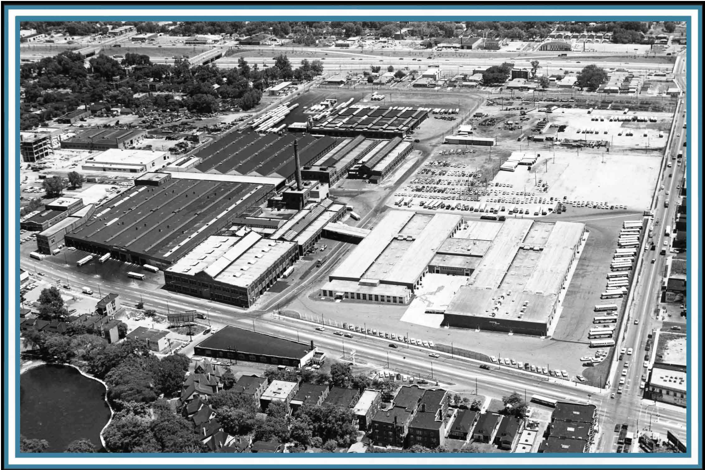
This is an aerial view of CTA's 77th Street Bus Garage and South Shops complex, taken June 25, 1964. A large portion of the 77th Street Garage was built as a streetcar barn by the Chicago City Railway (CCRY) in 1907. The streetcar maintenance facility that would eventually become the nucleus of the South Shops complex was opened in 1902 as an overhaul shop for CCRy.