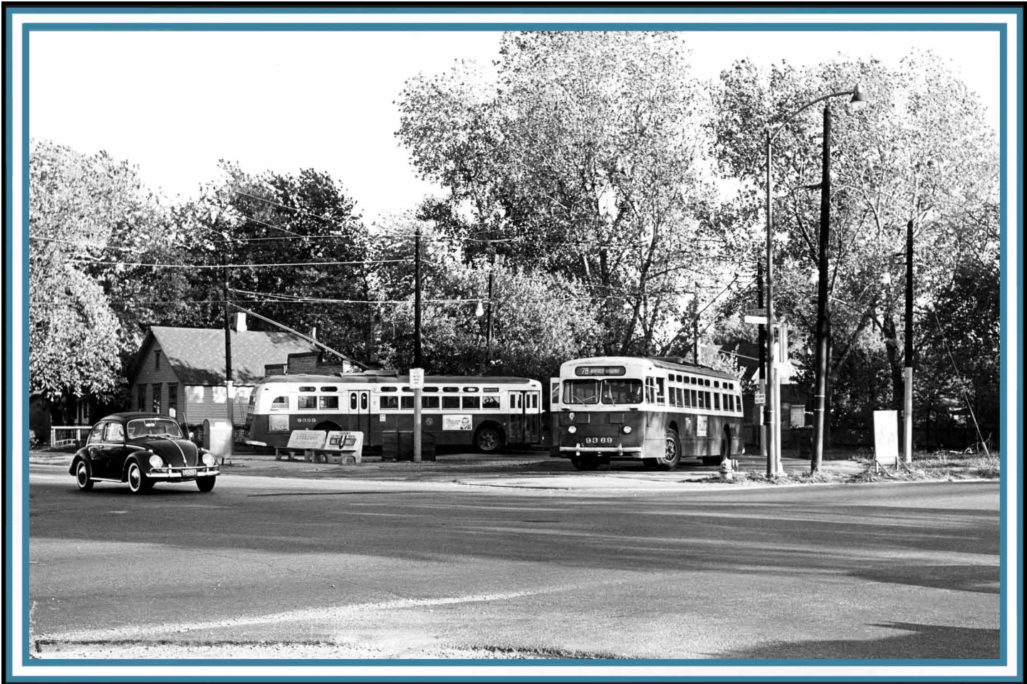
Trolley buses 9399 and 9369, built by the St. Louis Car Company in 1948 and originally numbered as 399 and 369, are seen in 1959 laying over in the off-street terminal loop at Montrose/Narragansett, at the Chicago-Harwood Heights border. Operating on the #78 route, the buses are awaiting their departure times to begin their eastbound trips on Montrose to Broadway.