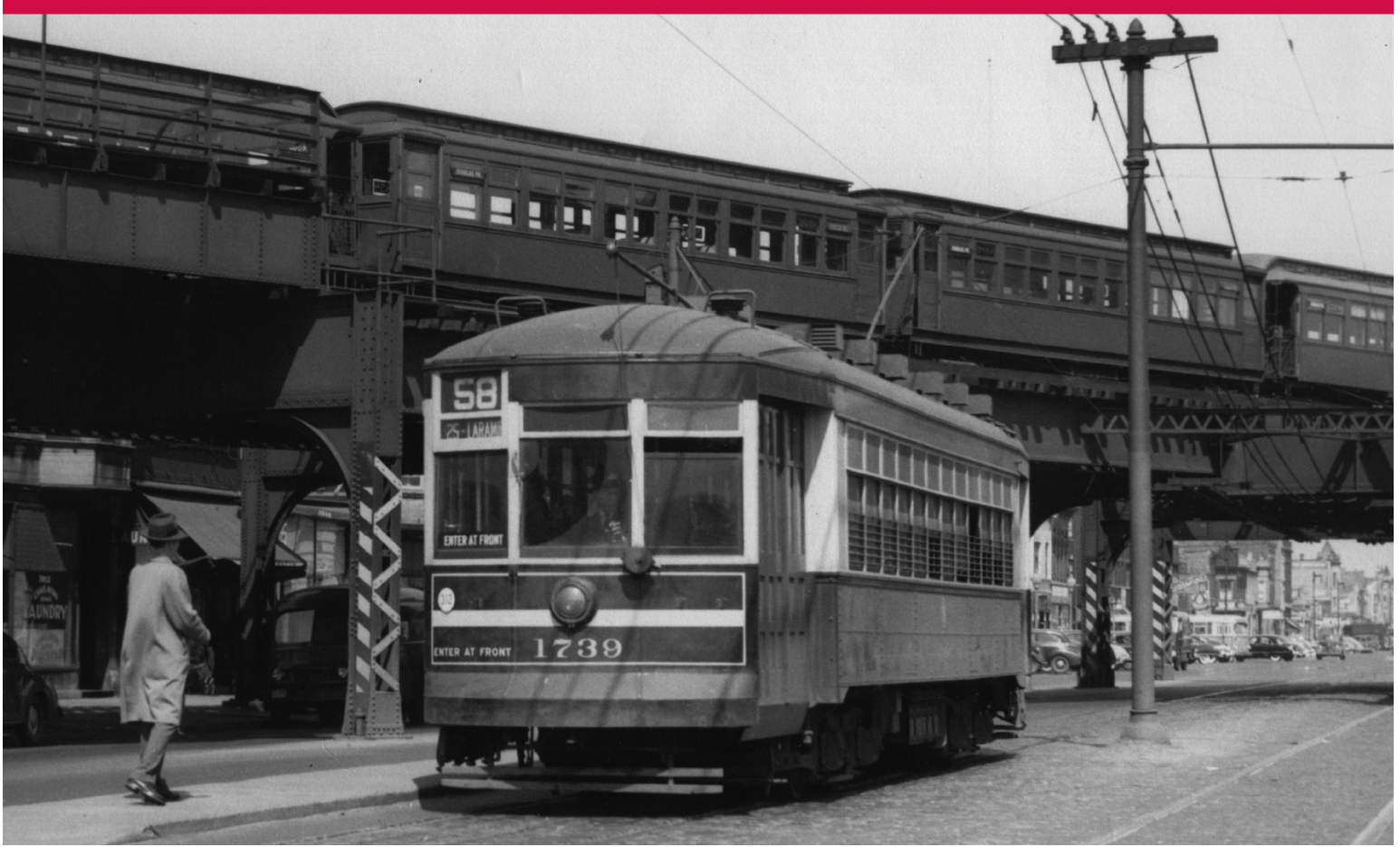
Chicago Surface Lines car 1739 heads southwest on Ogden, passing under the then-Douglas Park 'L' at Lawndale, with a train of at least four wooden railcars in view. Ogden Avenue was an important thoroughfare between downtown and places southwest of the city, in the era before superhighways and Interstate expressways—and long part of the famous former U.S. Route 66 from downtown Chicago to Los Angeles.