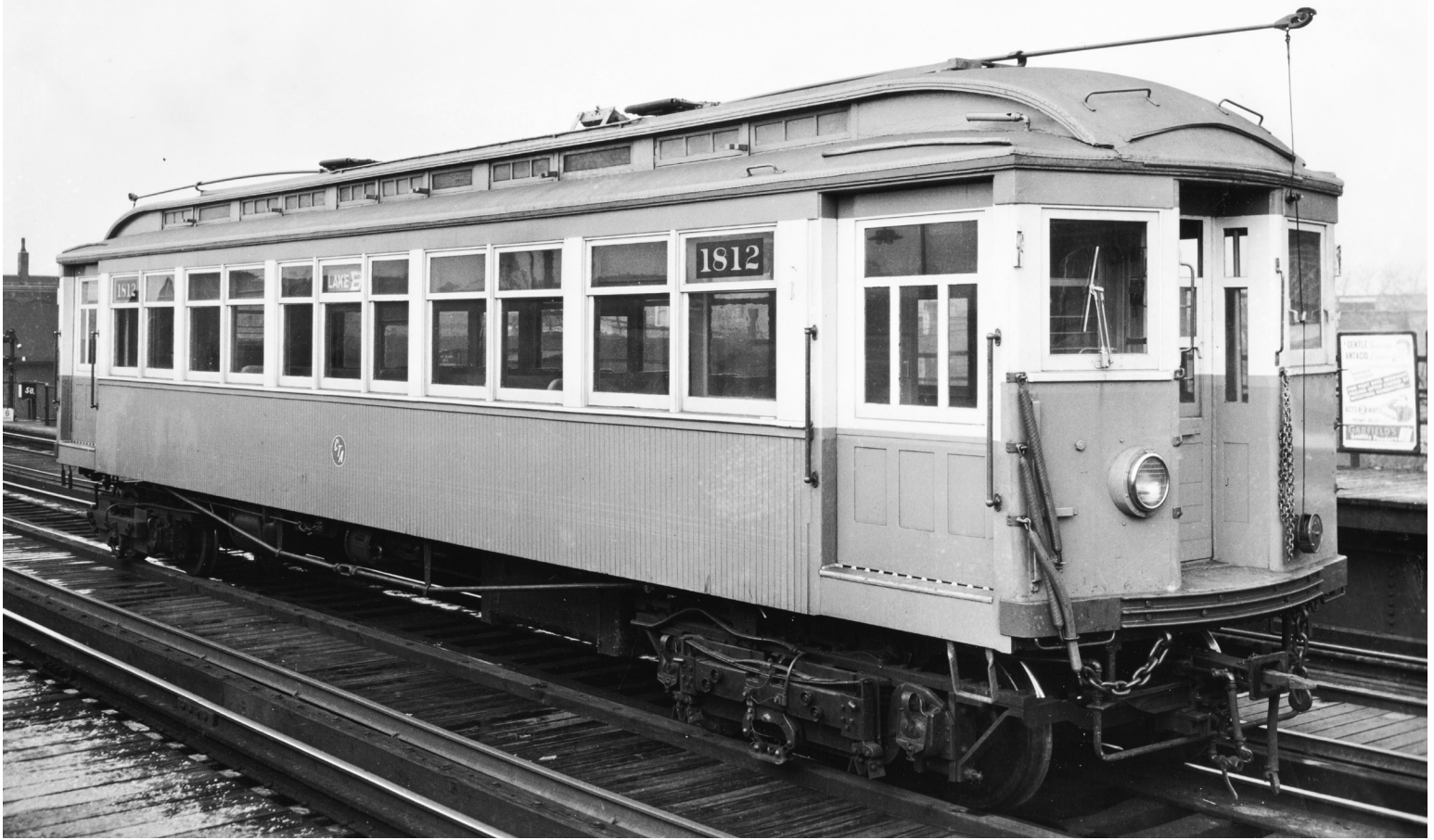
Car 1812, painted with an experimental Mercury Green, Croyden Cream and Swamp Holly Orange livery cruises down the Lake Street Line in 1951. Only one other wooden railcar, car 1814, was painted in such a way. The scheme was then adopted for the CTA's 6000- and 1-50 series railcars in the 1950s. In June of 2022, a Red Line train featured a wrap with the same paint scheme in celebration of the CTA's 75th Anniversary.