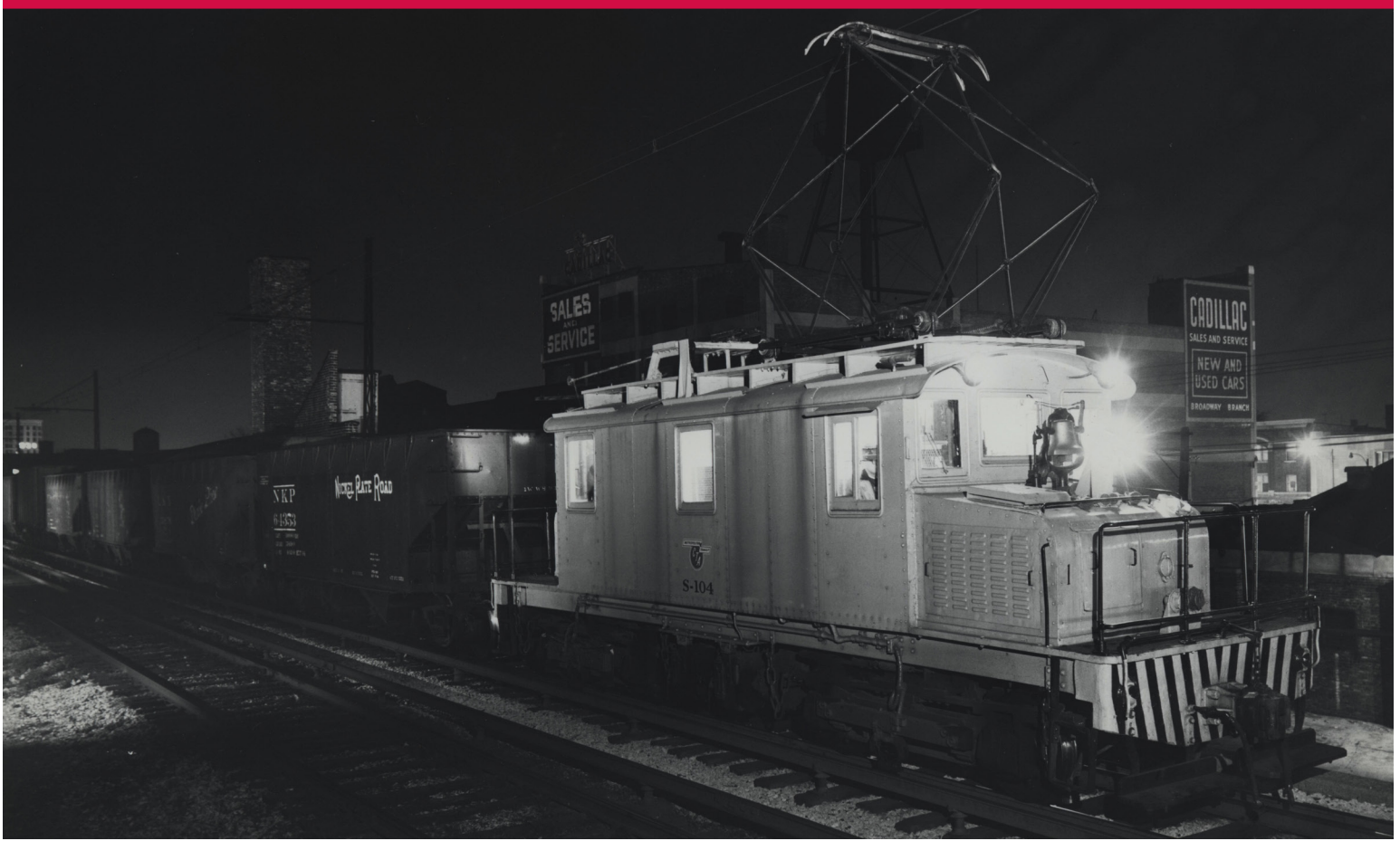
S-104 pulls a freight consist, including several hopper cars belonging to the Nickel Plate Road, on the night of November 2, 1965, looking southwest from Berwyn station. The embankment that this train is operating on, which includes the two southbound tracks, was demolished throughout the Fall of 2023 as part of the second phase of the Lawrence to Bryn Mawr Modernization Project, part of the CTA's Red and Purple Modernization Project (RPM) Phase One. The CTA opened the two tracks that'll ultimately be used by northbound trains in July 2023, with work now moving into reconstructing the two southbound tracks and new stations.