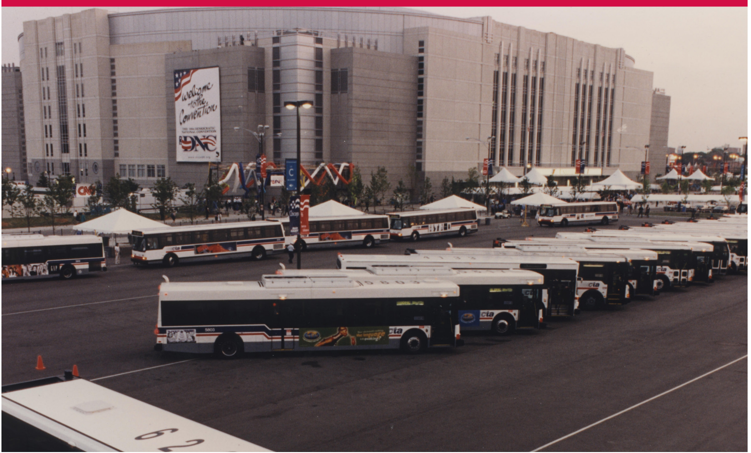
Oodles of buses wait in the parking lot at the United Center during the 1996 Democratic National Convention. For the convention that nominated Incumbent Democratic President Bill Clinton, the CTA ran a series of bus shuttles that moved 200 delegates per minute. Chicago is hosting the Democratic National Convention again in 2024. On November 11, 2023, the Chicago Transit Board approved an ordinance authorizing an agreement with Development Now for Chicago to provide for transportation services for next year's convention. Specifics are still in the planning phases