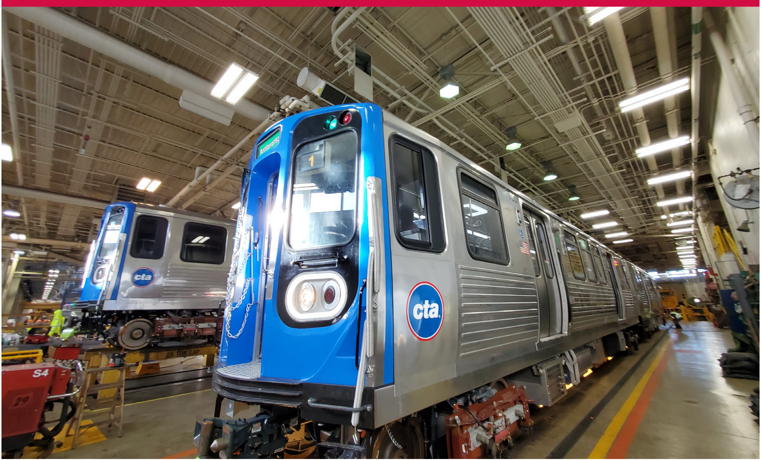
Two 7000-series railcar prototypes are delivered to CTA's Skokie Shops on January 22, 2021, prior to undergoing testing on each of the CTA's eight rail lines. Manufactured in Chicago's Hegewisch neighborhood by CRRC Sifang America, the initial order of 400 cars feature bold, blue end caps; new layout of headlights and taillights; as well as a redesigned interior featuring a new seating configuration that includes a mix of forward-facing and aisle-facing seats.