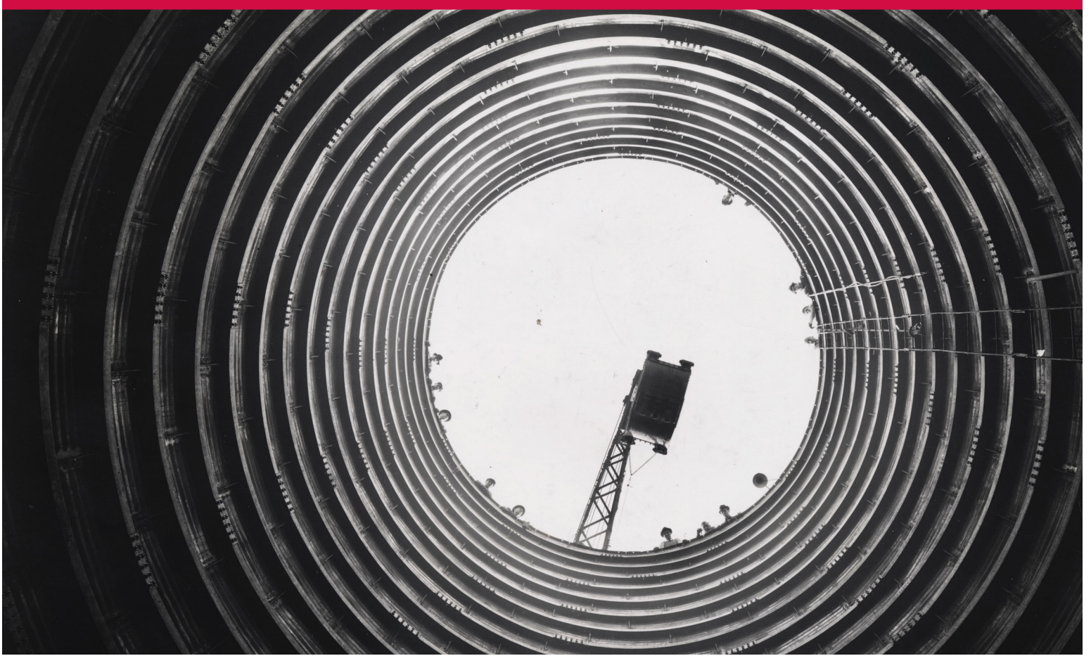
On March 24, 1939, construction workers look down on a completed vertical shaft during construction on what will eventually become the Milwaukee-Dearborn Subway. From out of this hole will be dug the horizontal train tubes that run today's CTA Blue Line. The $46 million dollar project featured $18 million of Federal PWA funds carved out of President Franklin D. Roosevelt's New Deal.