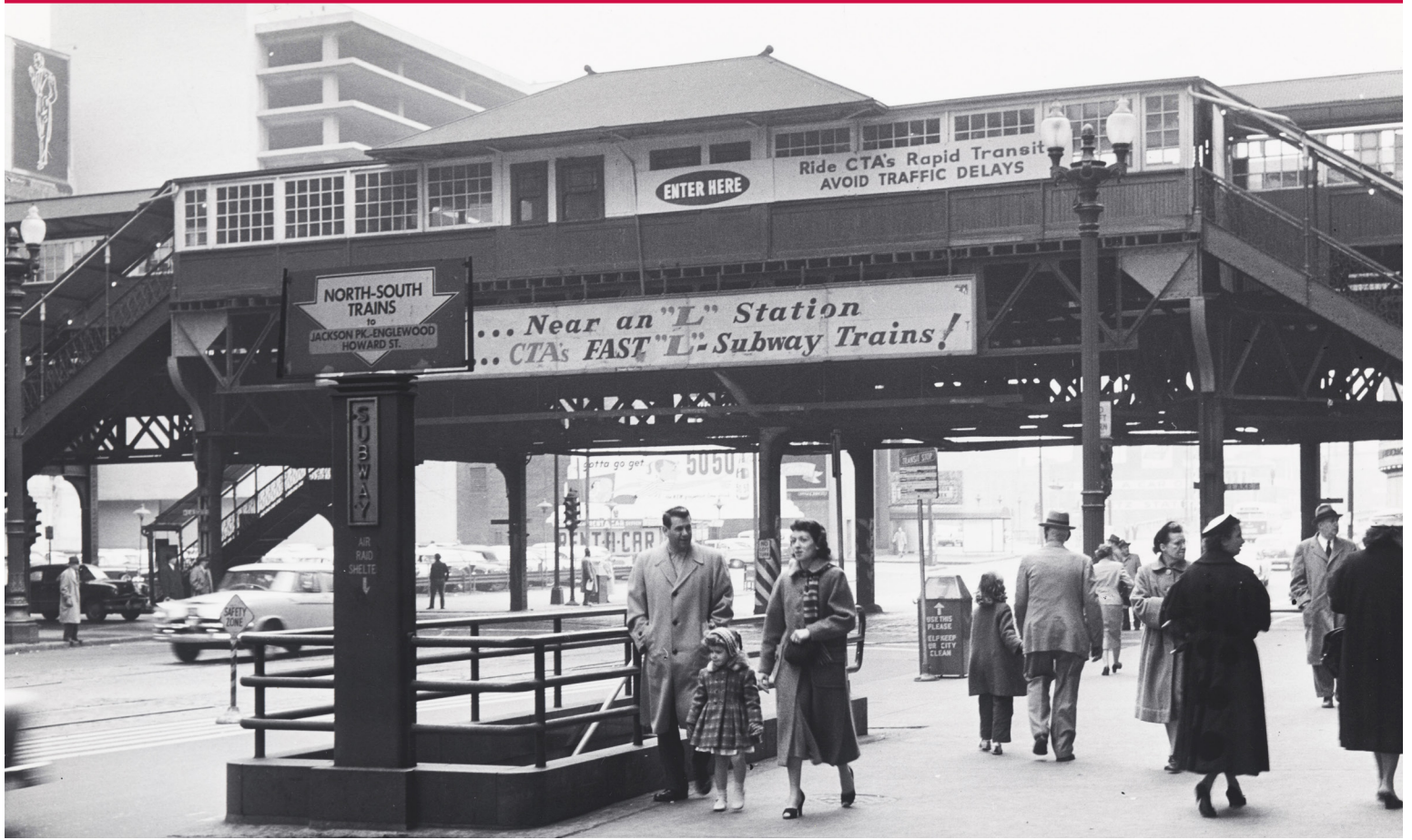
The State/Lake elevated station is seen looking northwest on December 11, 1957, with the northeast stairway down to the Lake-Randolph subway mezzanine also visible in the foreground. The elevated station had this appearance from around the 1920s to 1960s. CTA often used the high-visibility real estate of the station's facade over the street for ads promoting service.