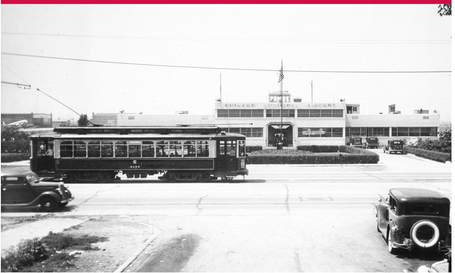
In this 1935 photo, Chicago Surface Lines streetcar 1577 strides down Cicero Avenue past Chicago Municipal Airport, now Chicago Midway International Airport. Just 13 years old at the time of this photograph, the airport concourse is nowhere close to the size of the concourses at Chicago O'Hare International Airport or even today's Midway. At the time, however, air travel was a rare and thrilling event.