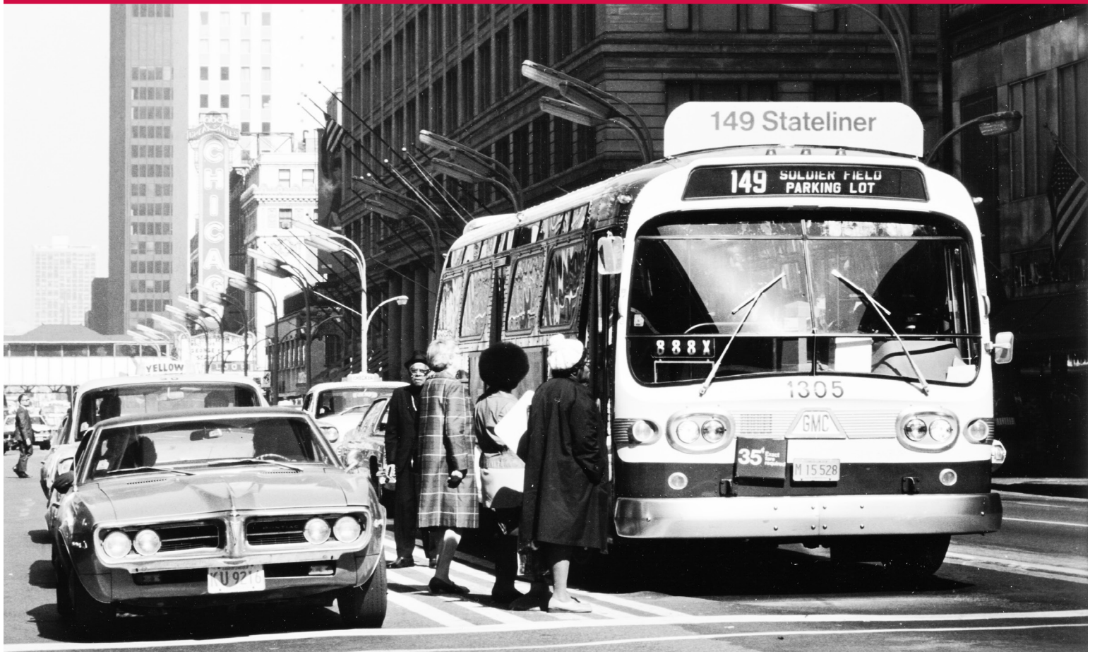
On October 2, 1972, a CTA route #149 Stateliner bus boards passengers southbound on State at Madison in the center lane of the road. Here, passengers stand in a painted-out bus staging area. Instead of having buses pull in-and-out of traffic to make curbside stops, painted pedestrian islands used to be a feature of State Street while buses used special bus and taxi lanes. The purpose was to expedite bus boarding process, improving the general flow of traffic.