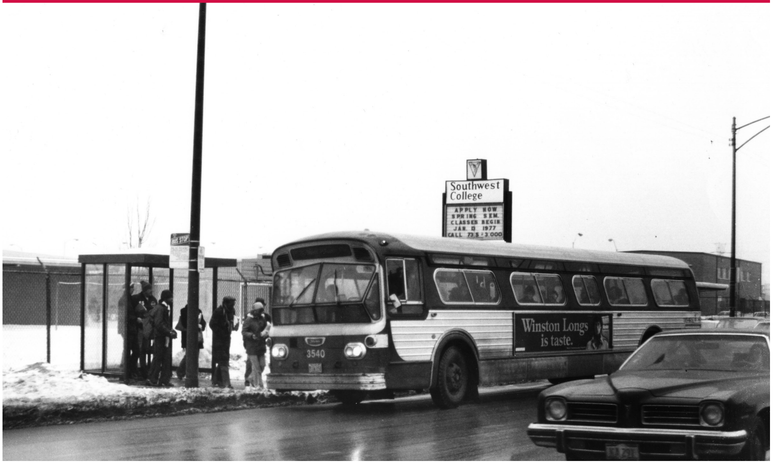
Bus 3540 boards intending passengers southbound on Pulaski in front of a sign that reads “Southwest College” advertising enrollment in the classes for the spring semester of 1977. The college moved to Pulaski in 1970 (after originally using classrooms in the evenings at Bogan High School, and being called Bogan Junior College), originally opening an “interim” campus of six prefabricated buildings and four trailers at the site. Chicago Mayor Richard Daley broke ground on the current facility not long before his death in December of 1976, and a few months after his death the school was renamed “Daley College” in honor of him. The new building opened its doors in 1981.