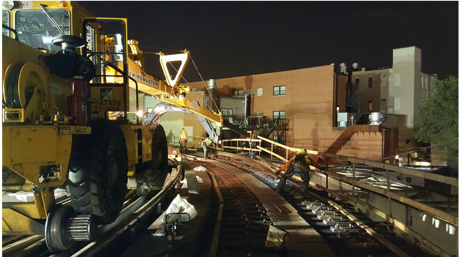
Contractor Installing Curved Rail at Halsted Curve