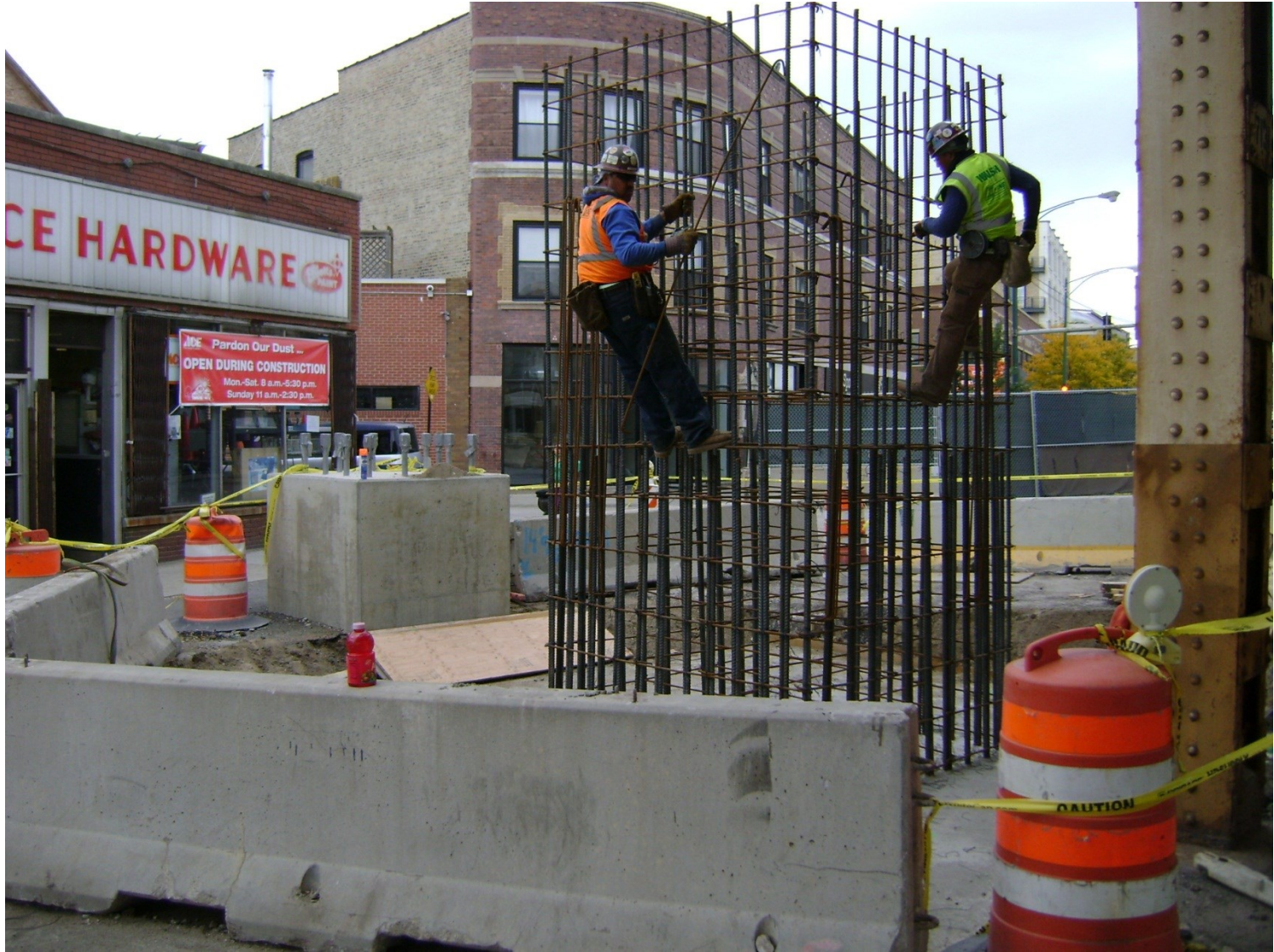
Installing reinforcement for temporary shoring tower at Broadway