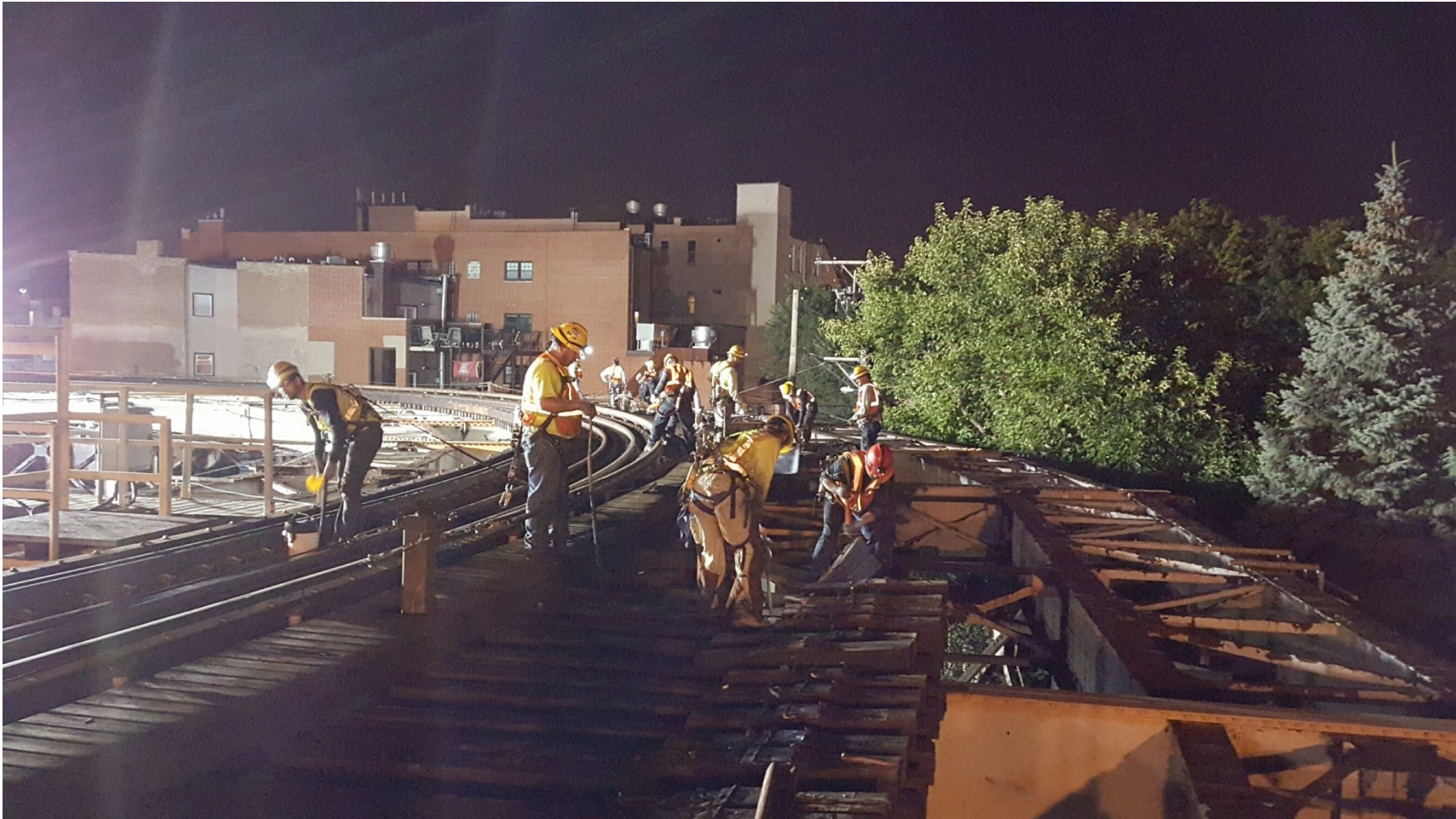
Contractor demolishing ties at Halsted Curve