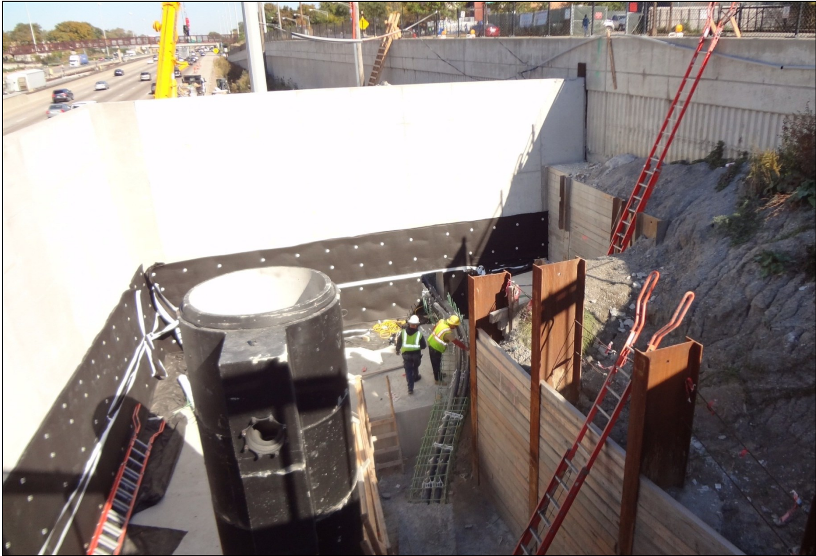
AP2: Concrete Wall Pours Complete at Wall 6