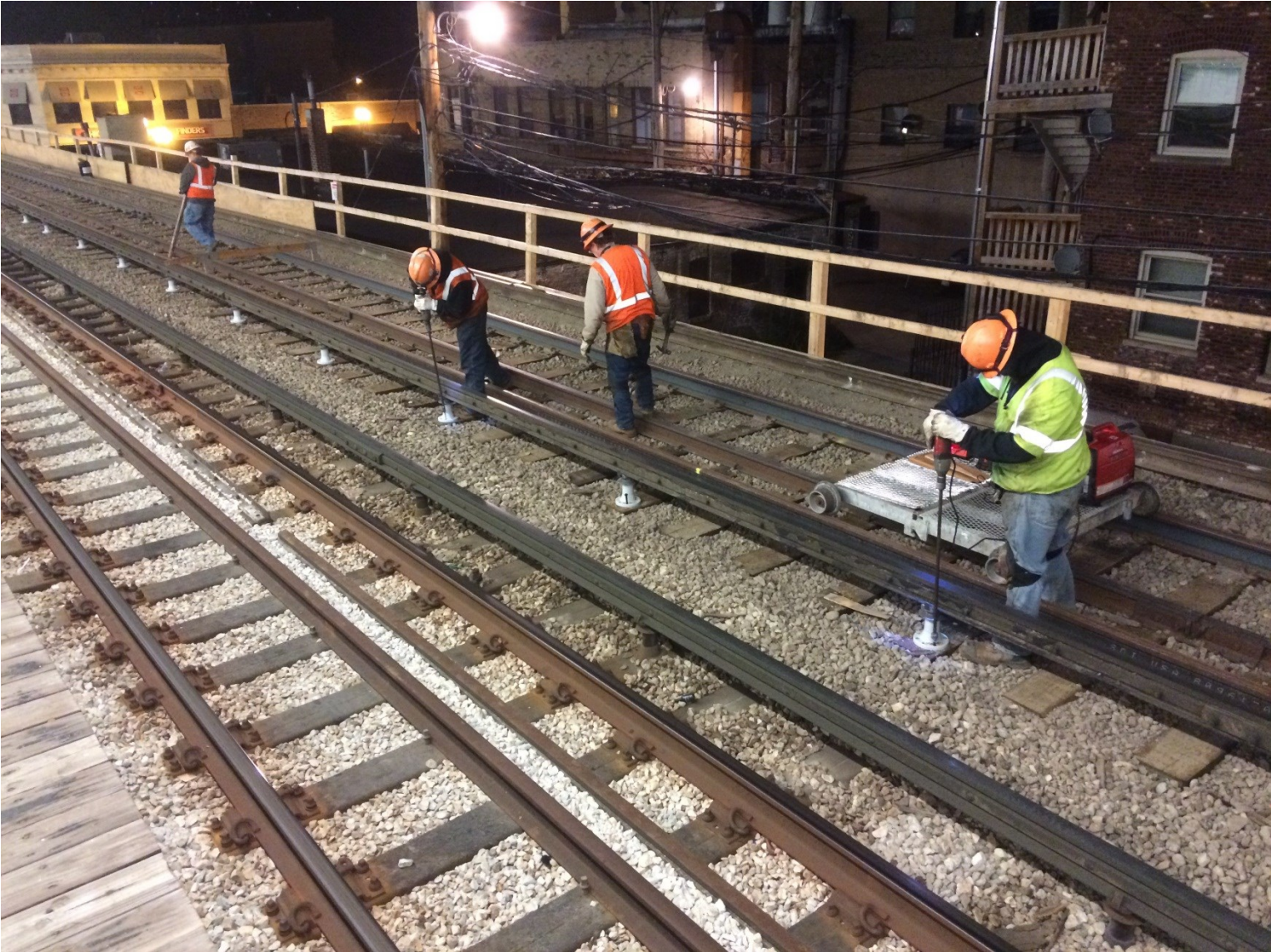
Track 4 – Chair replacement crew