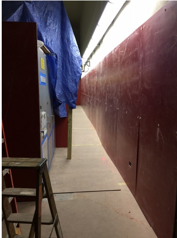
State Substation: Installation of GPO Board