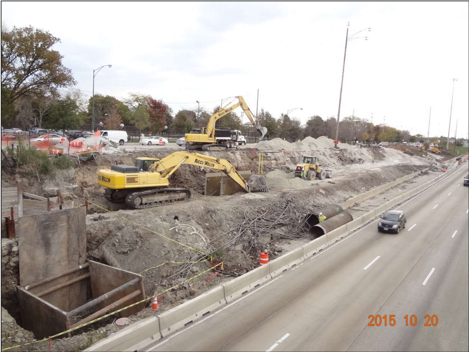
AP2: Excavation and Drainage Work at Wall 4