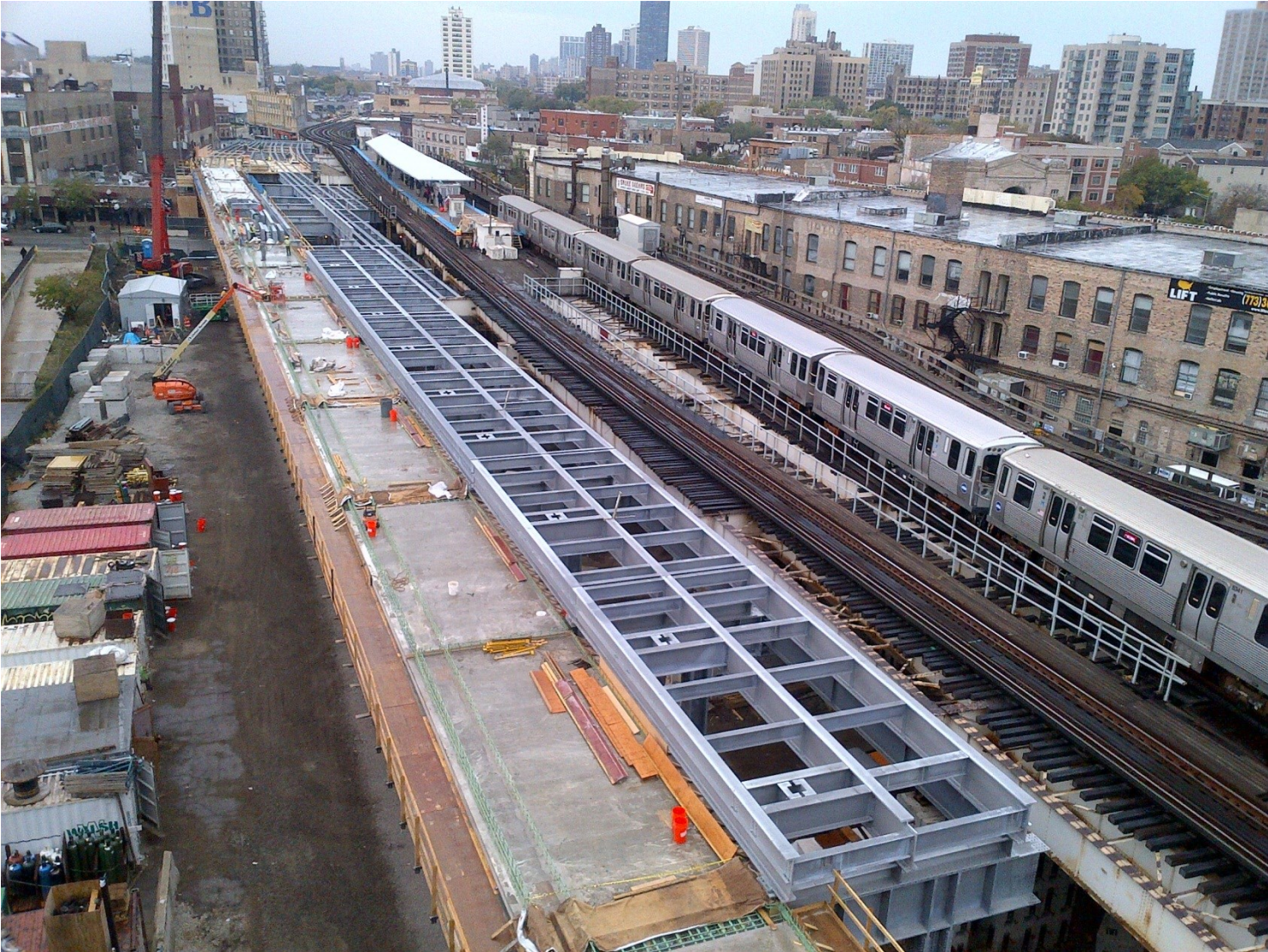
Crews placing structural concrete deck south of Wilson