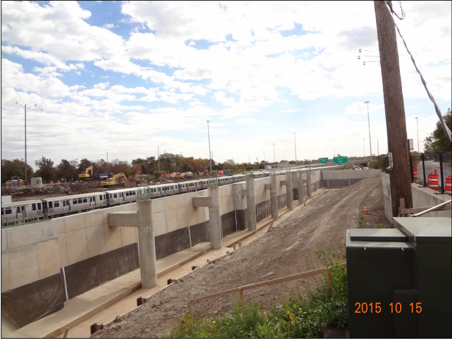
AP2: Concrete Work and Grading at Wall 1