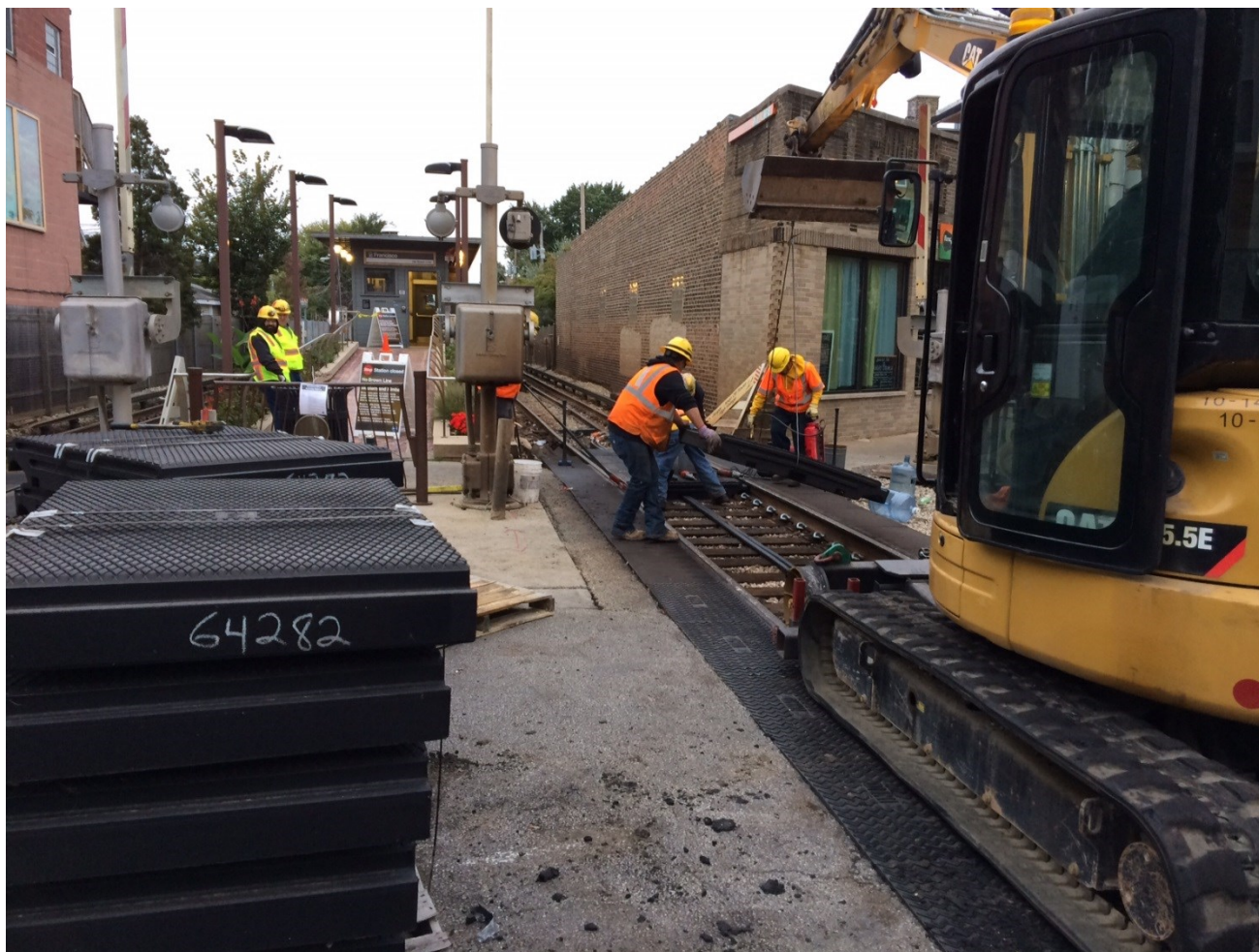
Kimball Substation: Installation of Negative Cables and Gauge Pads