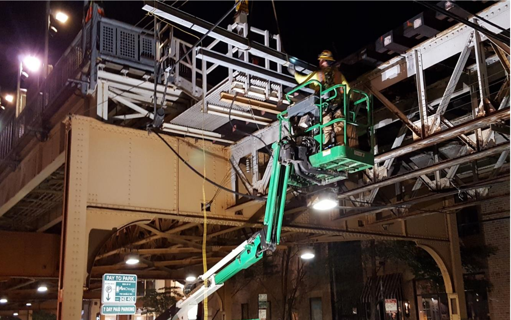
Installing Platform Support Beams at Chicago Ave