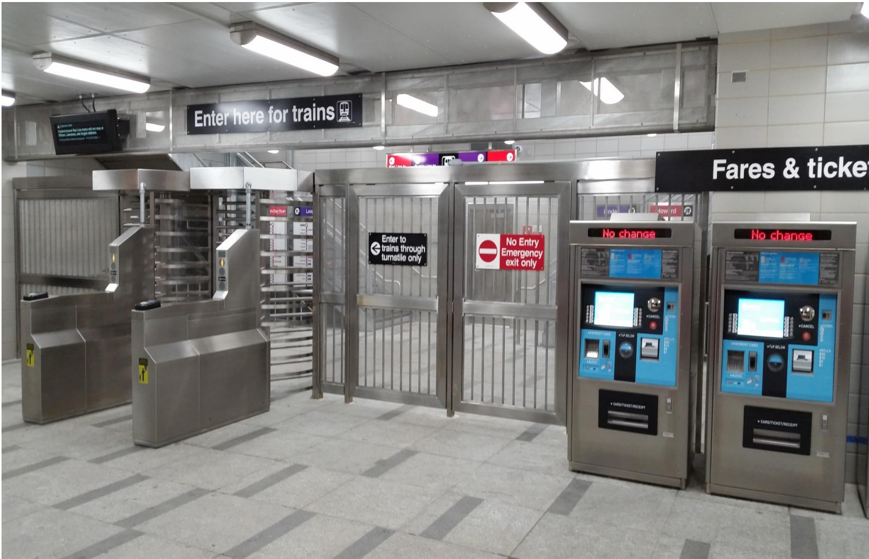
New Wilson Auxiliary Entrance