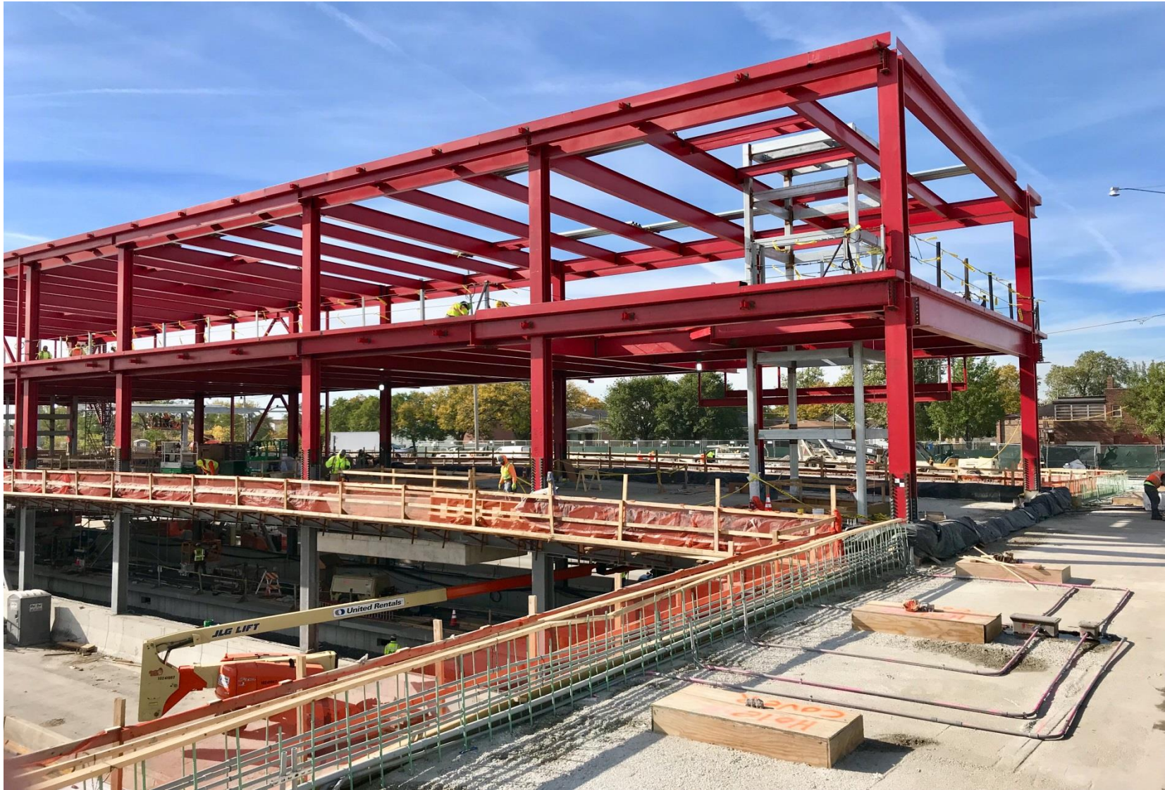
South Terminal Concourse Floor and 95th Bridge South Widening