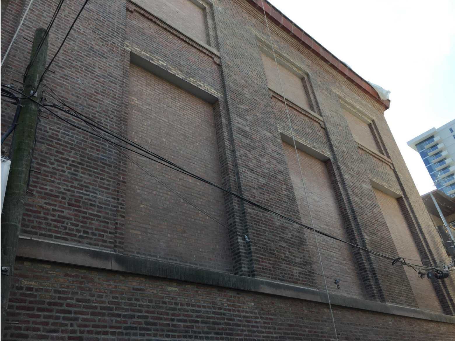
Illinois Substation North Side Tuck-pointing Completed