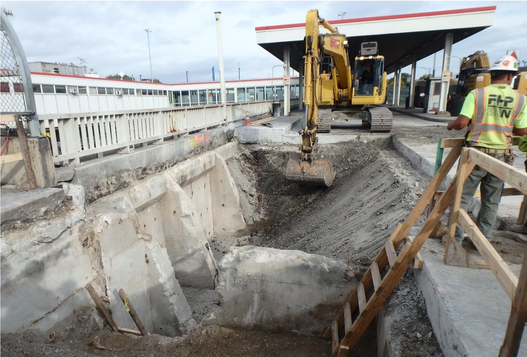
95 th North Widening East Abutment Demolition