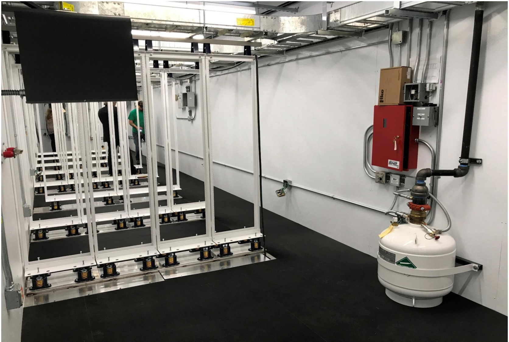
Willow Relay House Interior