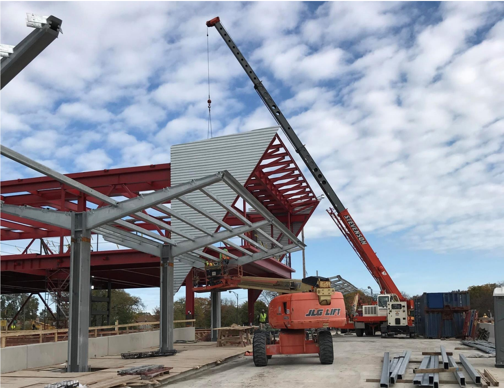
South Terminal Bus Canopy Installation