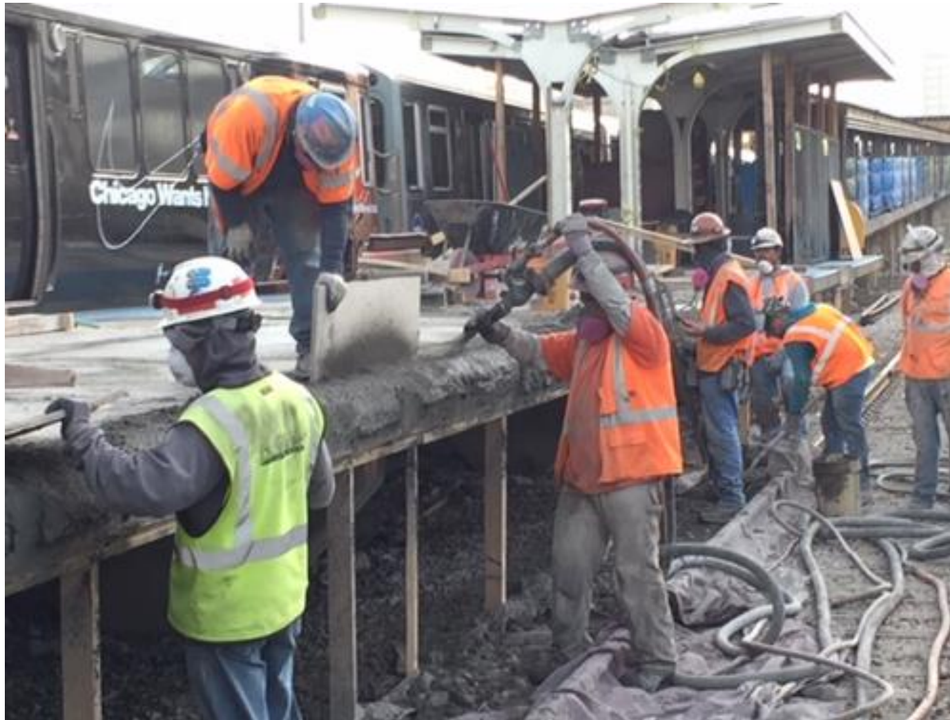
Platform Improvements – Structural Concrete Repairs