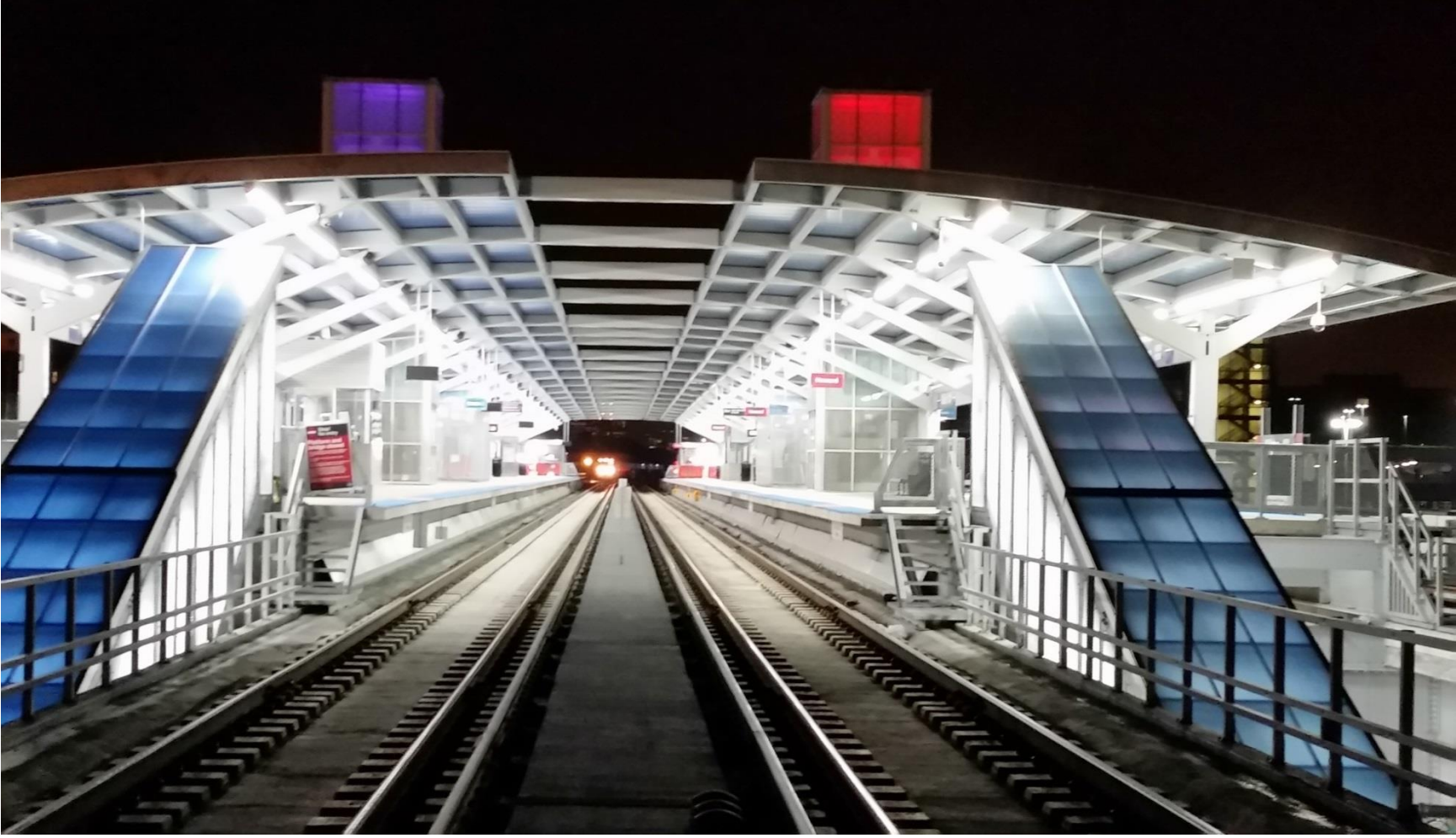
New Platforms and Elevator Towers