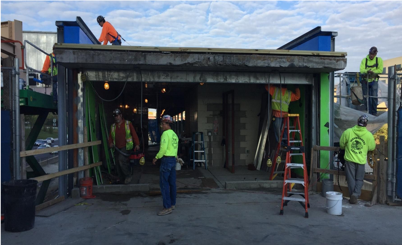
Paulina Stationhouse – Entrance, Roof and Facade Construction