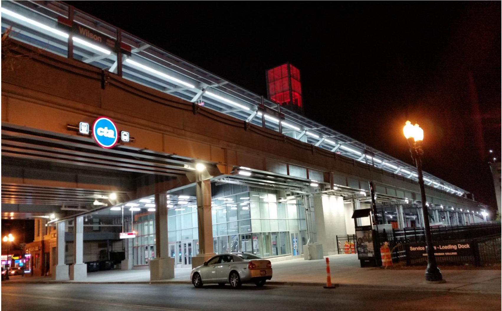
New Wilson Station