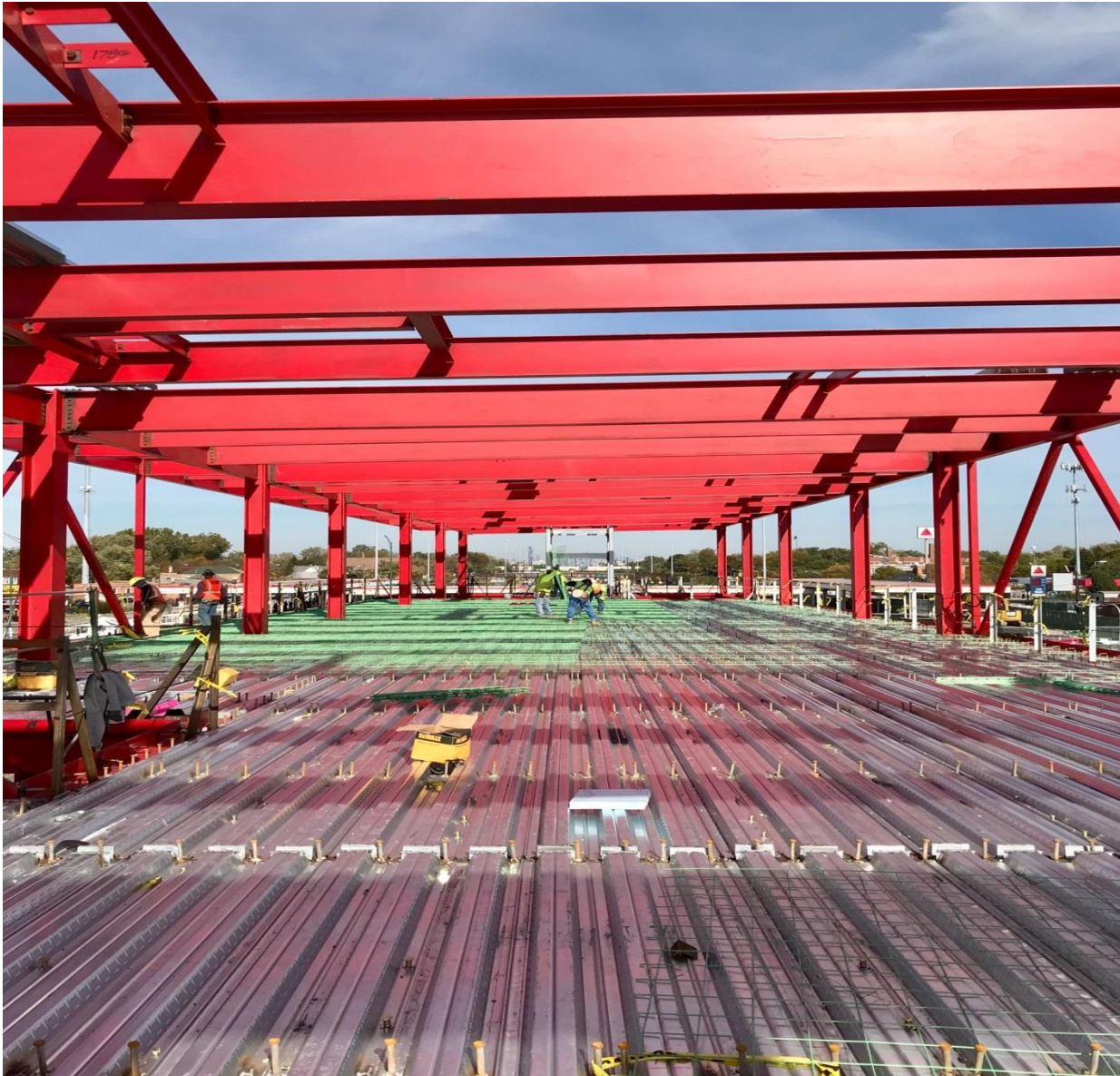
South Terminal Second Floor Deck Installation