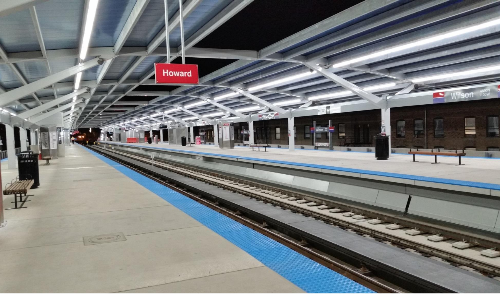
New Tracks and Platforms