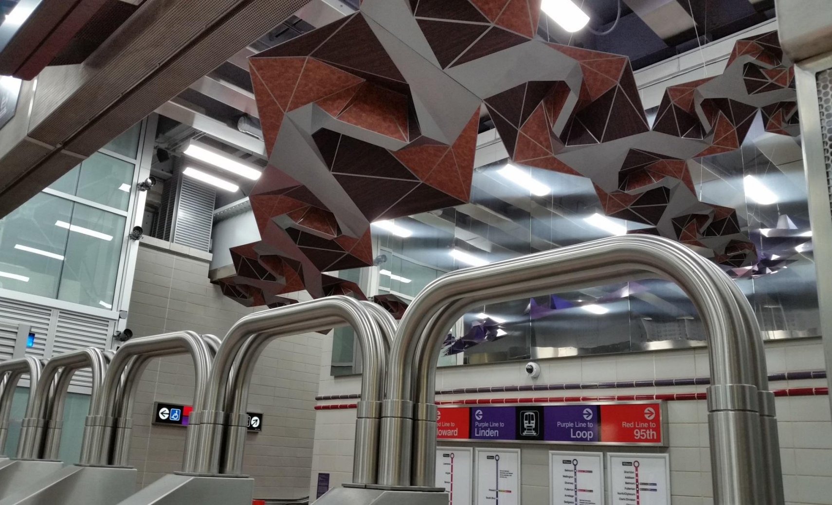
New Wilson Art Sculpture