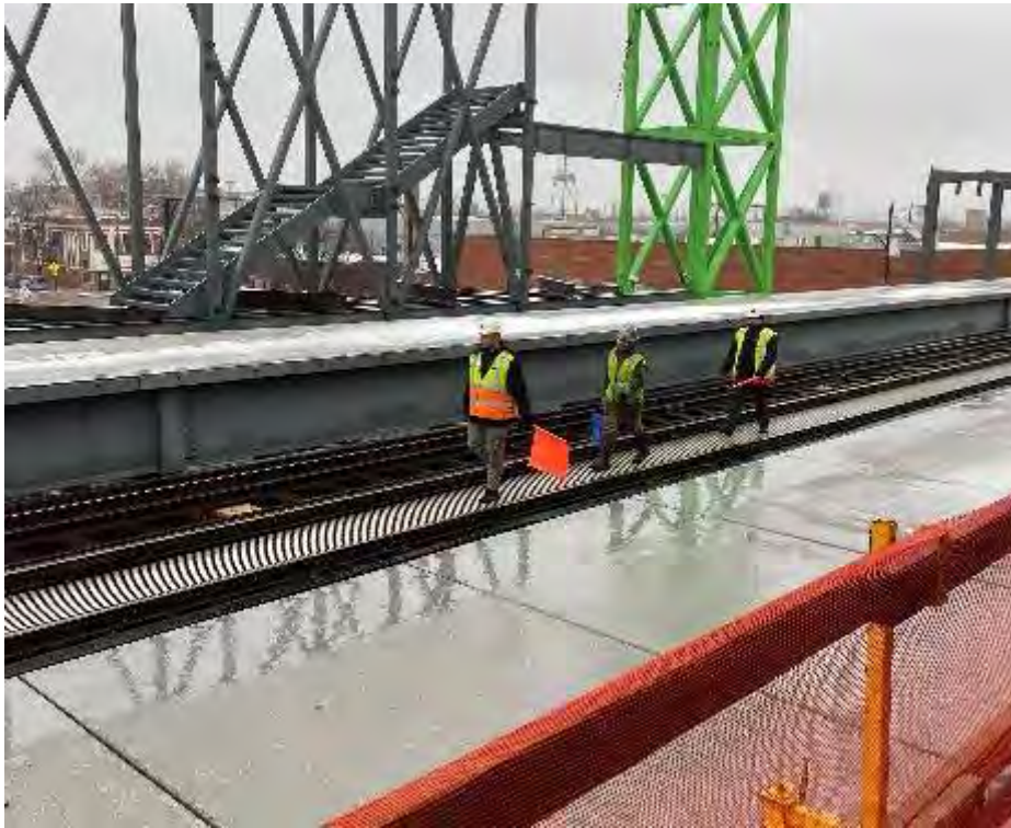
Precast Platform at Station House