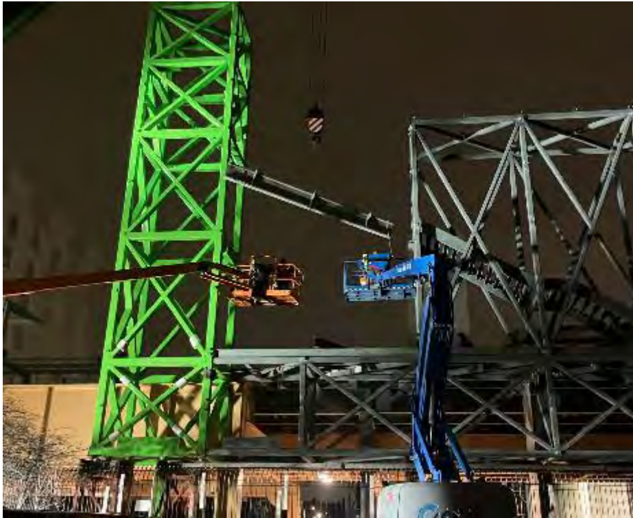
Lifting Elevator Steel at Night – North Tower