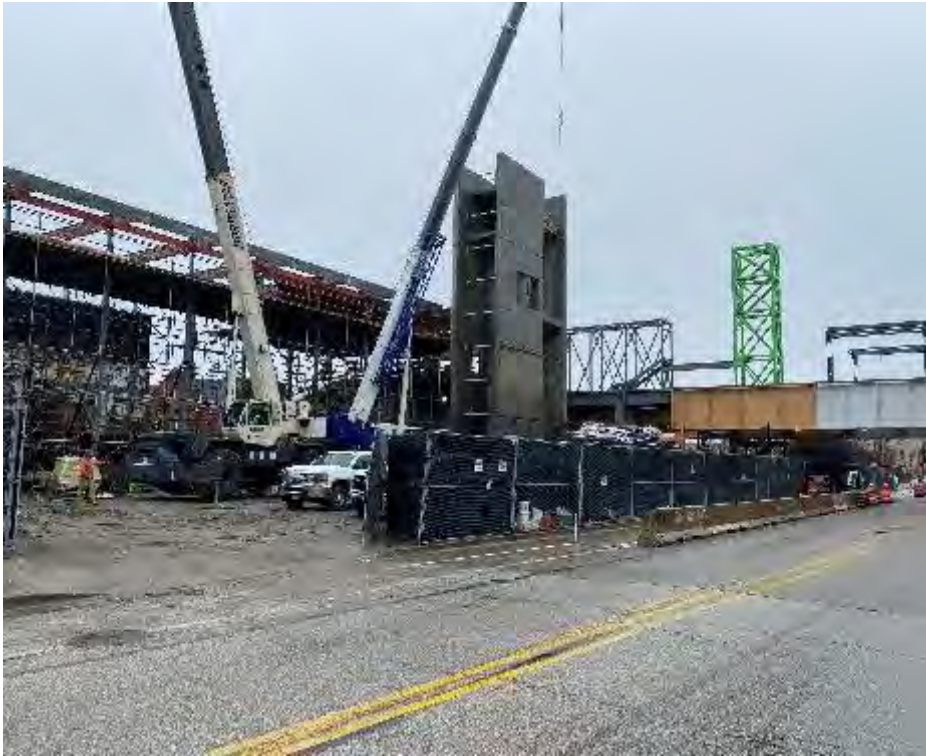
Station House looking North from Damen