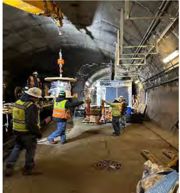
Interior Build-Out and Equipment Delivery at Canal