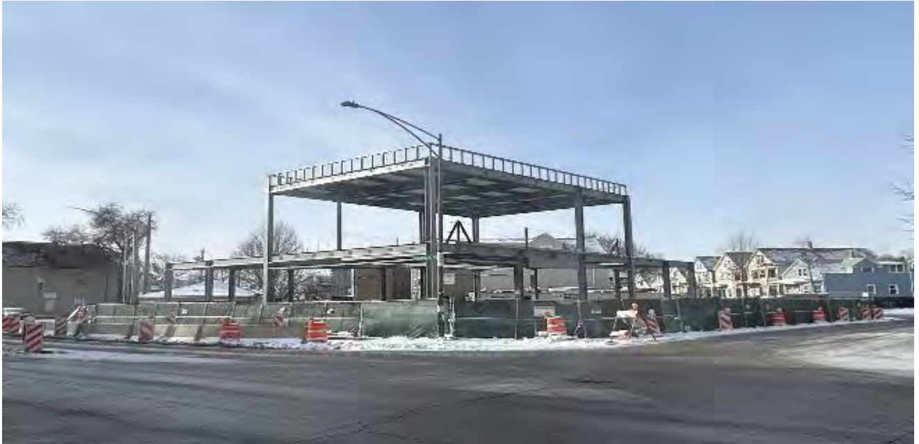
Completed Structural Steel Installation at Barry