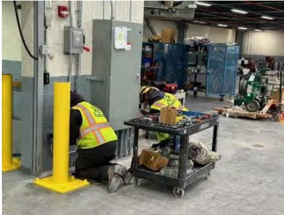
Electrical Wire Trimming