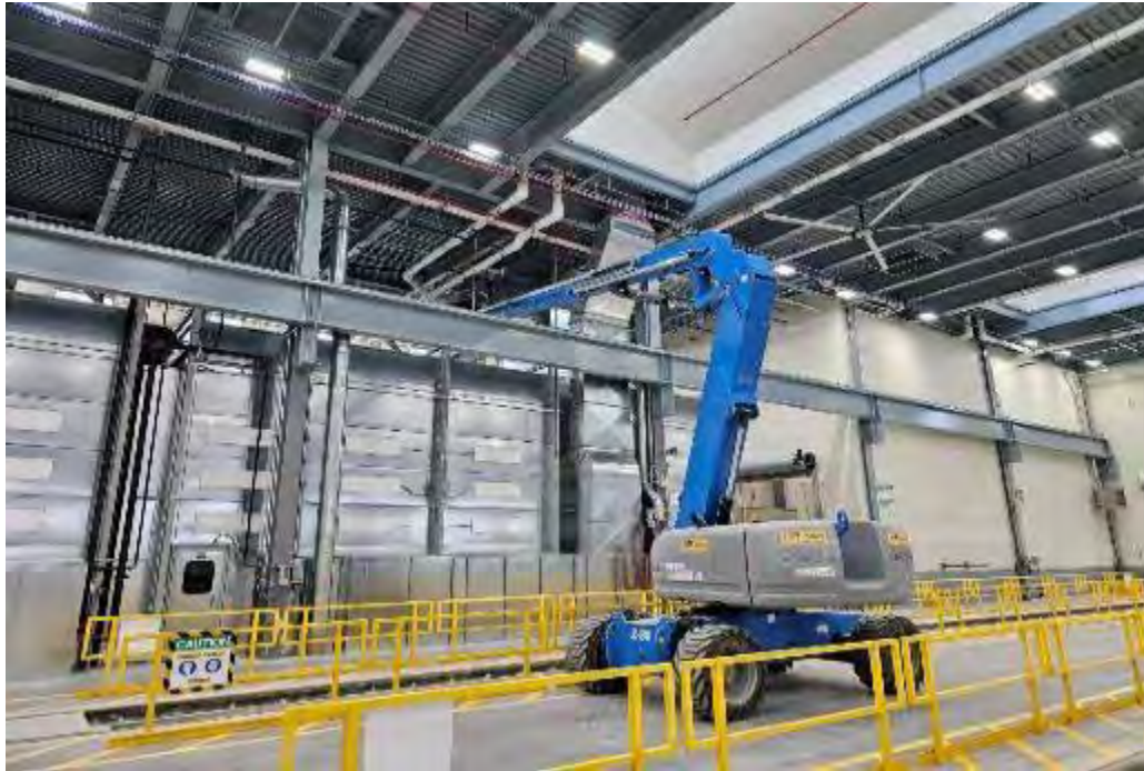
Painting Overhead Pipes