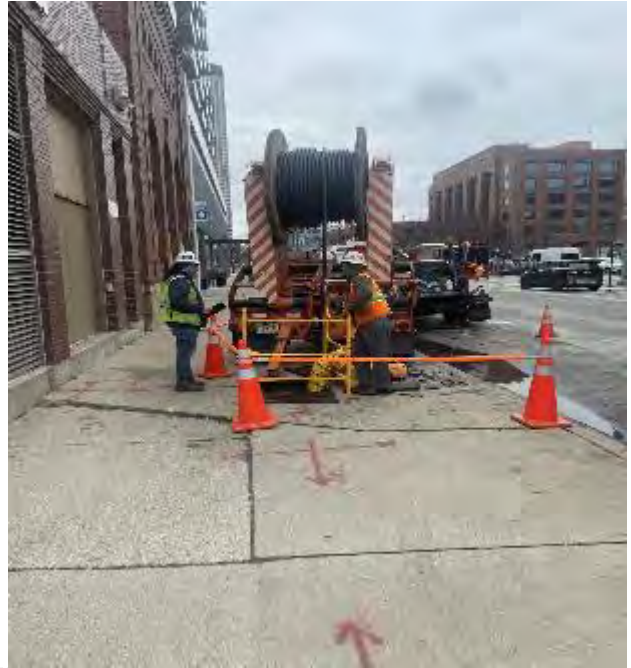
Cable Installation at Haymarket