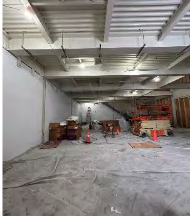
Weather Proofing and Interior Painting at Damen