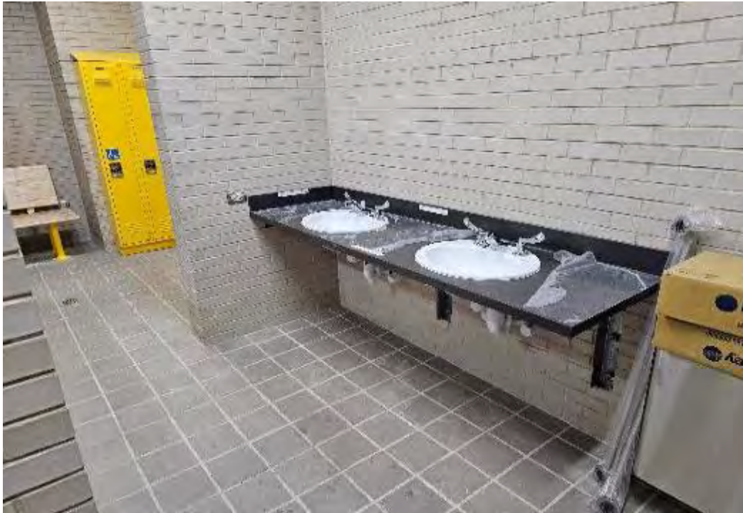
Bathroom Trim out