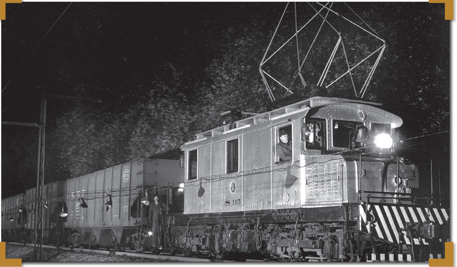
The photographer's flood lamps illuminate CTA S-105 electric locomotive pulling a load of coal cars at the Buena interchange yard adjacent to Graceland Cemetery, in this 1965 view. Freight operations ceased in 1973.