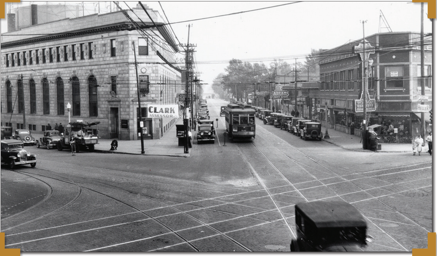
A serene view in 1934 looking southeast along Milwaukee Avenue at Irving Park/Cicero/Milwaukee. Known as "Six Corners," this intersection saw the meeting of three major streetcar lines. A northbound Chicago Surface Lines (a CTA predecessor) streetcar built by the Pullman Company in 1908 is on its way to the terminal at Milwaukee/Imlay.