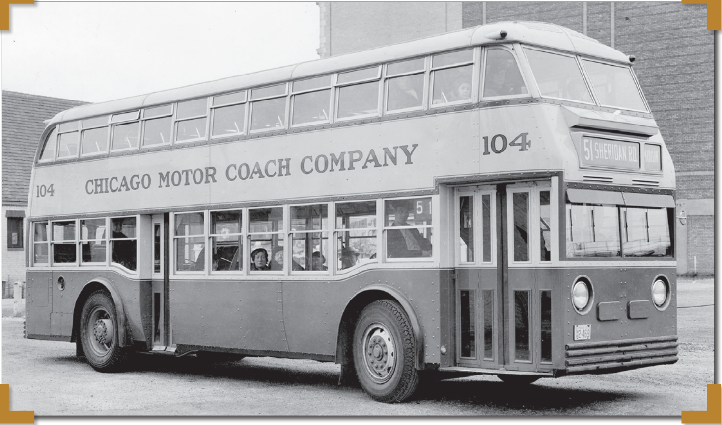
Chicago Motor Coach Company bus #104, built in 1934 by Yellow Coach (a division of General Motors Corporation) waits at the #51 Sheridan terminal at Sheridan/Devon/Broadway. All double decker buses were retired in 1950. The Chicago Motor Coach company was absorbed by the CTA on October 1, 1952.