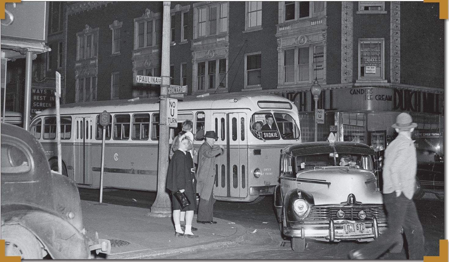
Bus 2575, built by the ACF-Brill Company in 1947 and still in its Chicago Surface Lines (CSL) paint scheme, begins service on the first run of the #97 Skokie bus route on March 27, 1948, which replaced rapid transit service to Skokie.