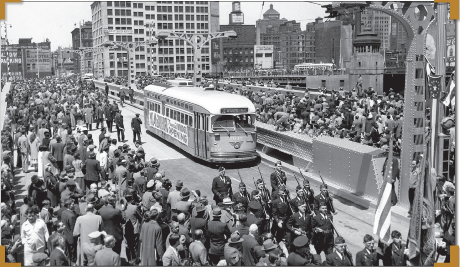
A southbound Presidents' Conference Committee (PCC) "Green Hornet" streetcar on State Street, one of 600 built by both the St. Louis Car Company and Pullman-Standard Car Manufacturing Company that entered service in 1948, celebrates the opening of the new State Street bridge over the Chicago River in this 1949 view. Streetcar service ended in Chicago fifty years ago, in the early morning hours of June 21, 1958.