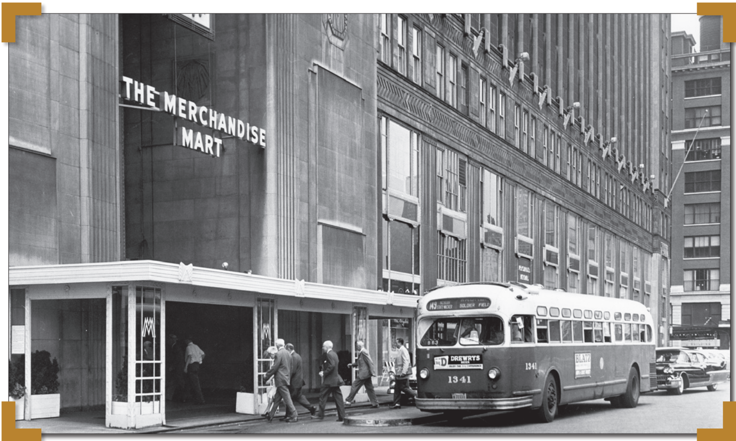
CTA bus 1341, manufactured by General Motors Corporation in 1946 for the Chicago Motor Coach Company, which later became part of CTA, drops off passengers at the Merchandise Mart in 1958.