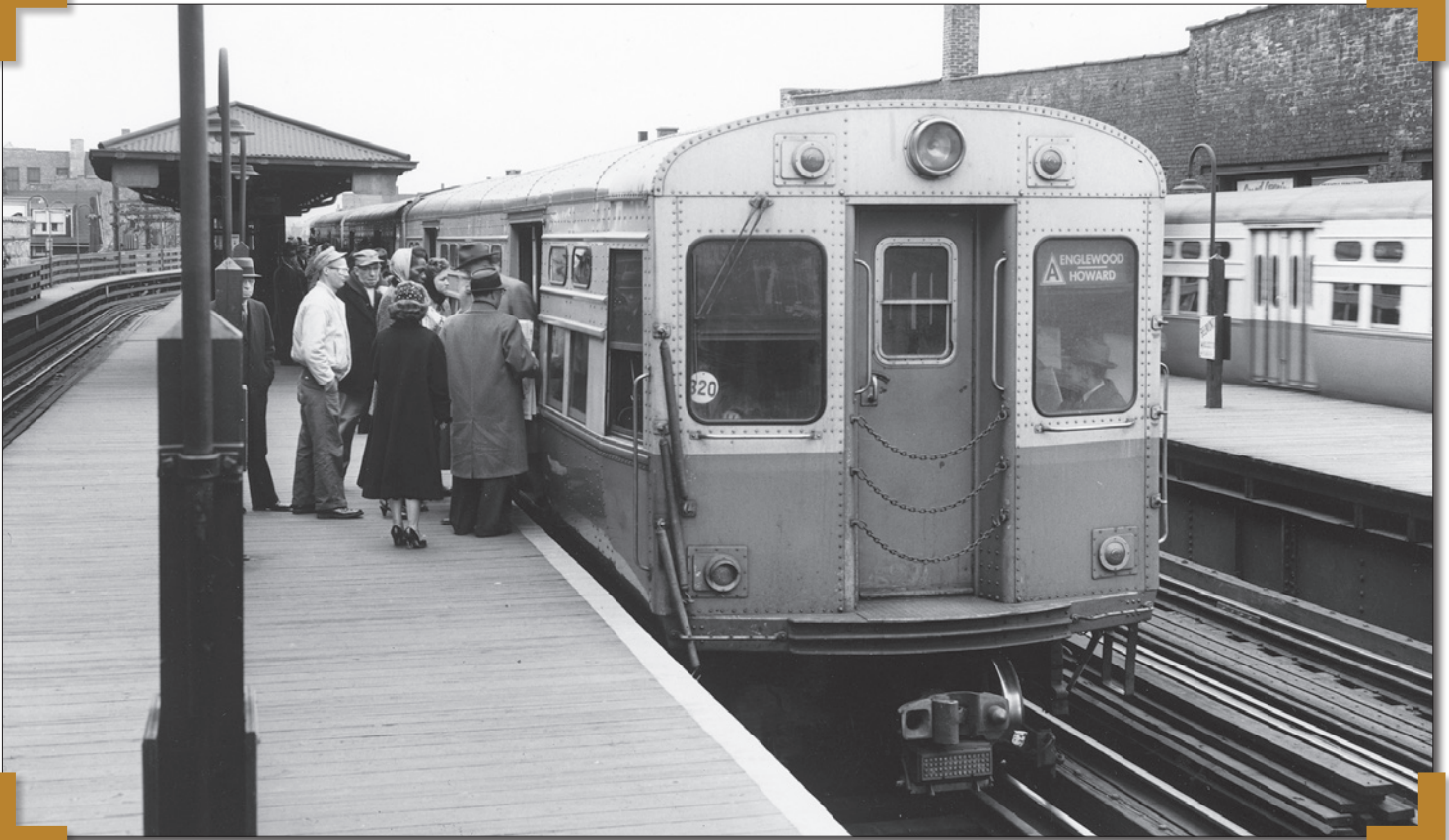
A southbound Englewood "A" train stops for passengers in this 1960 view of the Belmont station, on its way to Downtown and 63rd/Loomis. Note the narrow platform on the far left that was used exclusively by Chicago North Shore & Milwaukee interurban trains traveling from Milwaukee to Downtown.