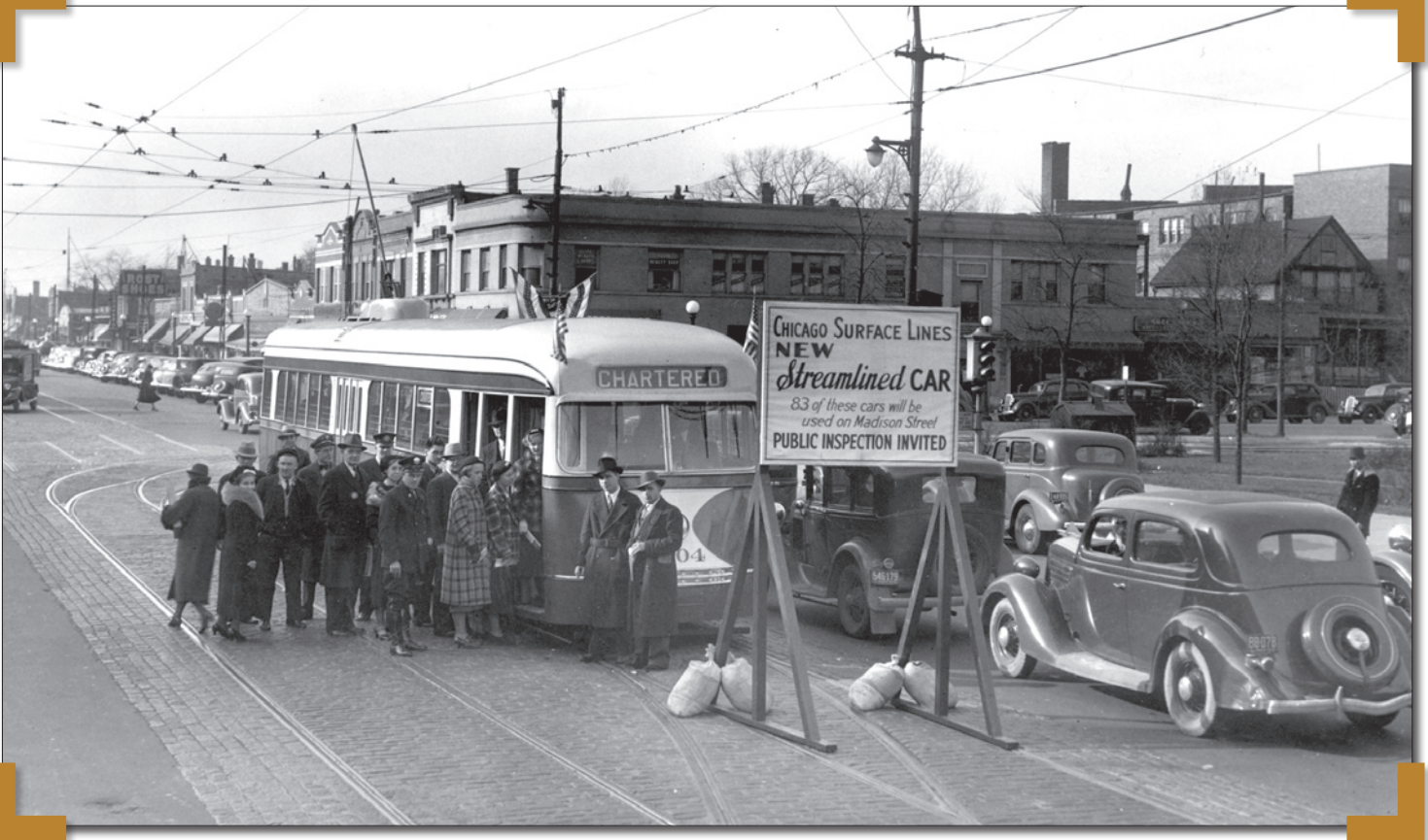
Eighty-three Presidents' Conference Committee (PCC) "Blue Geese" streetcars manufactured by the St. Louis Car Company entered service on the Madison Street route in 1936, introducing a new era of streamlined surface transit, as seen by this display on Madison at Austin.