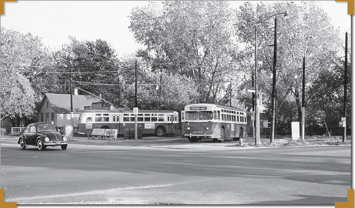
CTA trolley buses 9399 and 9369, built by St. Louis Car Company, wait at the Montrose/Narragansett loop before starting their eastbound runs on the #78 Montrose route in this 1959 view.