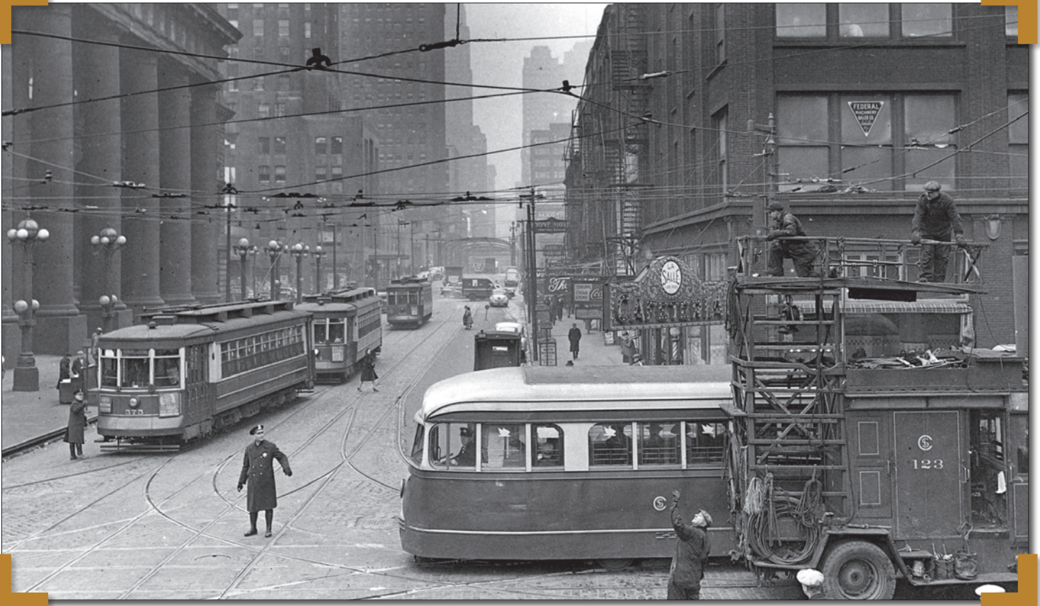
View looking east on Madison at Clinton, circa 1944. Several Chicago Surface Lines streetcars built by the Pullman Company in 1908 are lined up in front of the Chicago & North Western station. A 1936 "Blue Goose" streetcar, built by the St. Louis Car Company in 1936, is turning west onto Madison from Clinton to travel on the #20 Madison route out to Madison/Austin, as a Chicago Surface Lines Line truck and line crew prepare to do overhead wire work.