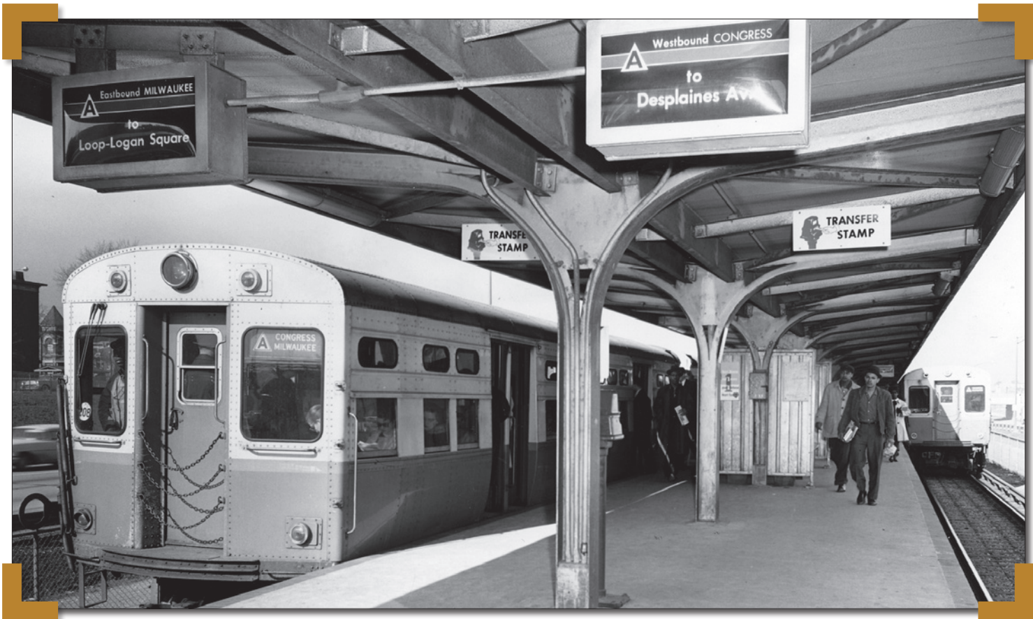
A flurry of activity takes place as passengers board and exit two 6000-series trains manufactured by the St. Louis Car Company at the Western station of the Congress rapid transit line, which opened for service fifty years ago, on June 22, 1958.