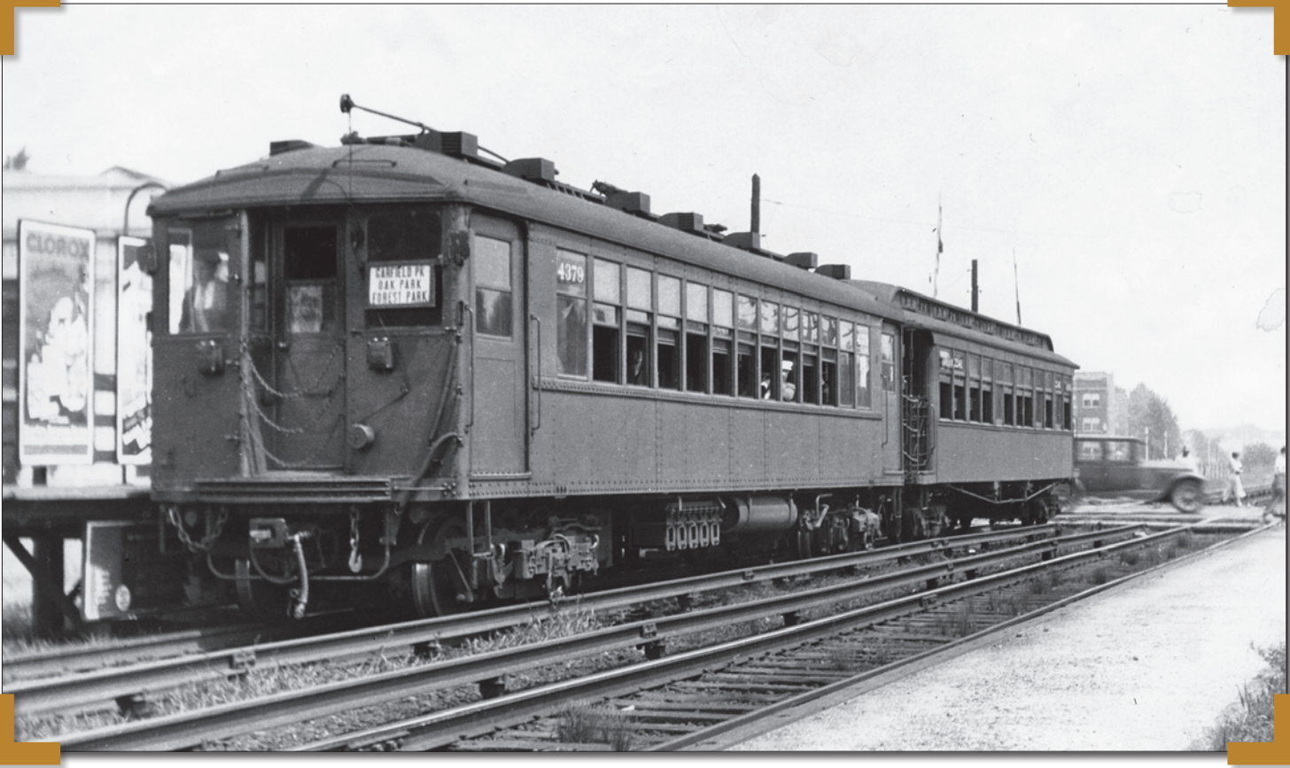
A westbound two-car Garfield Park train consisting of both a 4000-series car and wooden car traveling from the Loop stops for passengers at the Oak Park Avenue station in suburban Oak Park in July, 1935. This same location today is in the middle of the Eisenhower Expressway.