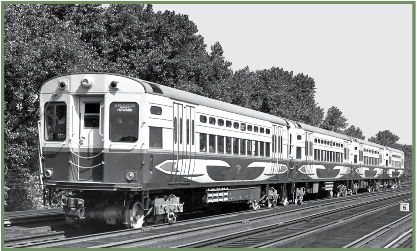
A four-car train set of 1-50 series cars, consisting of cars 1 through 4, is seen here in 1960 in a special livery of maroon, red, cream and silver with a distinctive stylized arrow design to differentiate them from the rest of the fleet on the system. Built by the St. Louis Car Company, cars 1-4 were designed to test new “high performance” equipment for improved acceleration and speed.