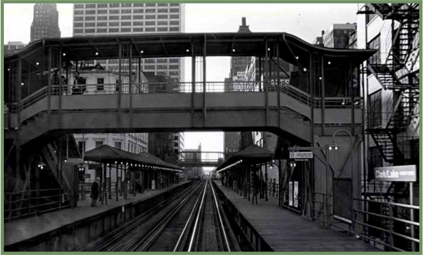
This is a train's-eye view looking west along the Loop Elevated above Lake Street of the original Clark/Lake elevated station as it looked shortly before construction of a replacement station began in 1988. Originally opened in 1895, this station and State/Lake were built by the Lake Street Elevated and actually predated the Loop 'L' by a few years, being incorporated into the downtown quadrangle in 1897. Almost everything seen in this photo is gone today, as this station has been replaced with a new, modern, ADA-accessible station with direct connection to the subway below it.