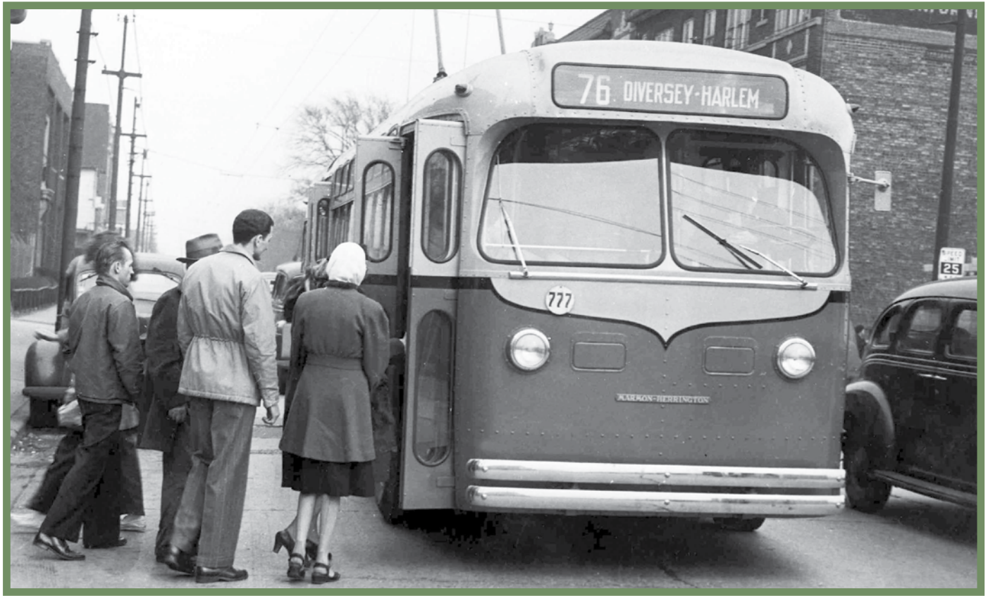
It is 1948, and a westbound trolley bus on the #76 Diversey route is boarding a group of passengers, on its way to its western terminus at Harlem Avenue. This bus is actually a demonstrator model, manufactured by the Marmon-Herrington Company. The public was very receptive to these buses, and the CTA subsequently ordered 349 of these coaches for its system.