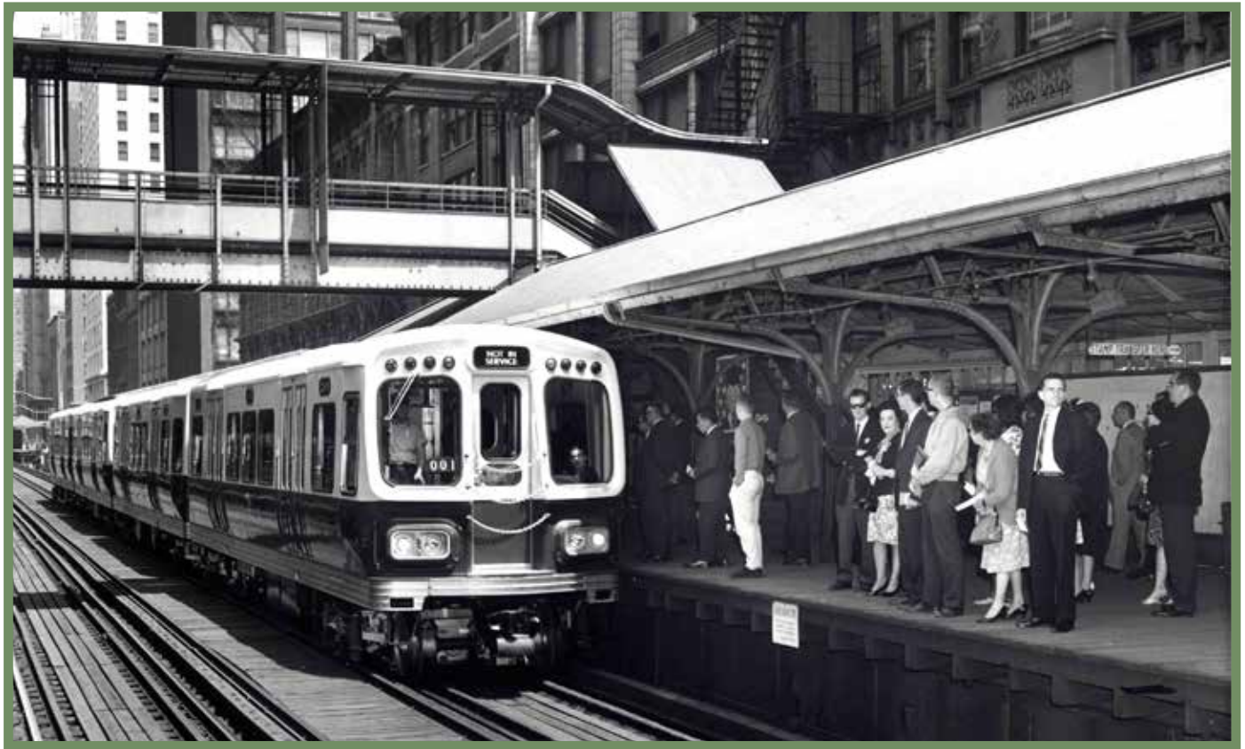
It is 1964; the first four cars of the 180-car order for the new 2000-series units are being introduced to the public. A noontime crowd is waiting at the Adams/Wabash station on June 11 to board the train of “New Look” cars for a free demonstration ride. The cars were built by the Pullman-Standard Company, and were the last ‘L’ cars actually manufactured in Chicago. These were the first air-conditioned rapid transit cars for Chicago, and their original livery of mint green and alpine white presented quite a sharp appearance.