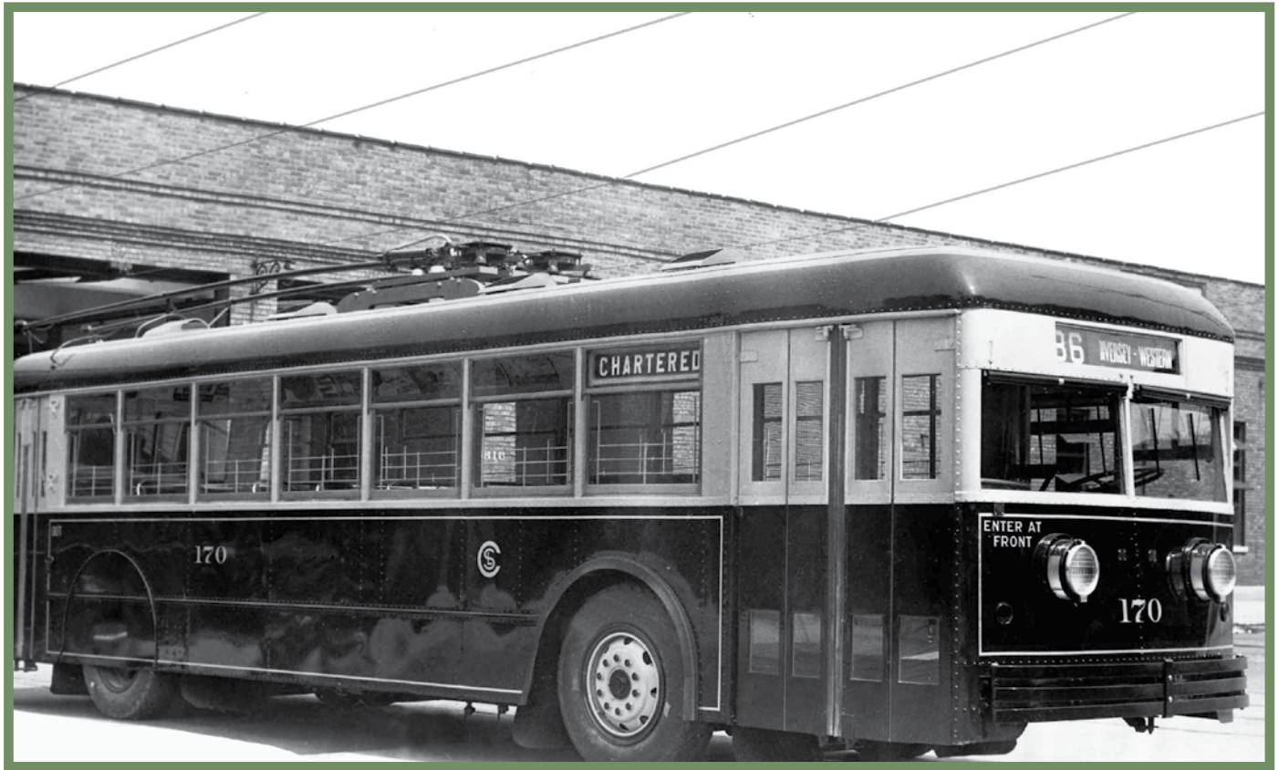
Chicago Surface Lines (CSL) trolley bus #170, just delivered from the Pullman-Standard Company in 1935, looks sharp in its red and cream color scheme, trimmed in silver, as it is posed for a photo outside of West Shops. Trolley buses were used as extensions of existing streetcar lines and, later, replaced streetcars on some routes during the CTA's conversion to an all-bus operation.