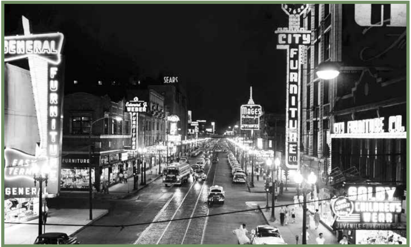
It is a warm summer evening in May of 1955 as shoppers are strolling along Halsted window-shopping. In this 1950s view looking south from 62nd Street, a wide variety of stores on both sides of the street can be seen as far as the eye can see. By this time, buses have replaced streetcars on the #8 Halsted route, as propane bus 5764 makes its way northbound on Halsted at 62nd. 63rd and Halsted was the largest and busiest shopping district outside of the Loop.