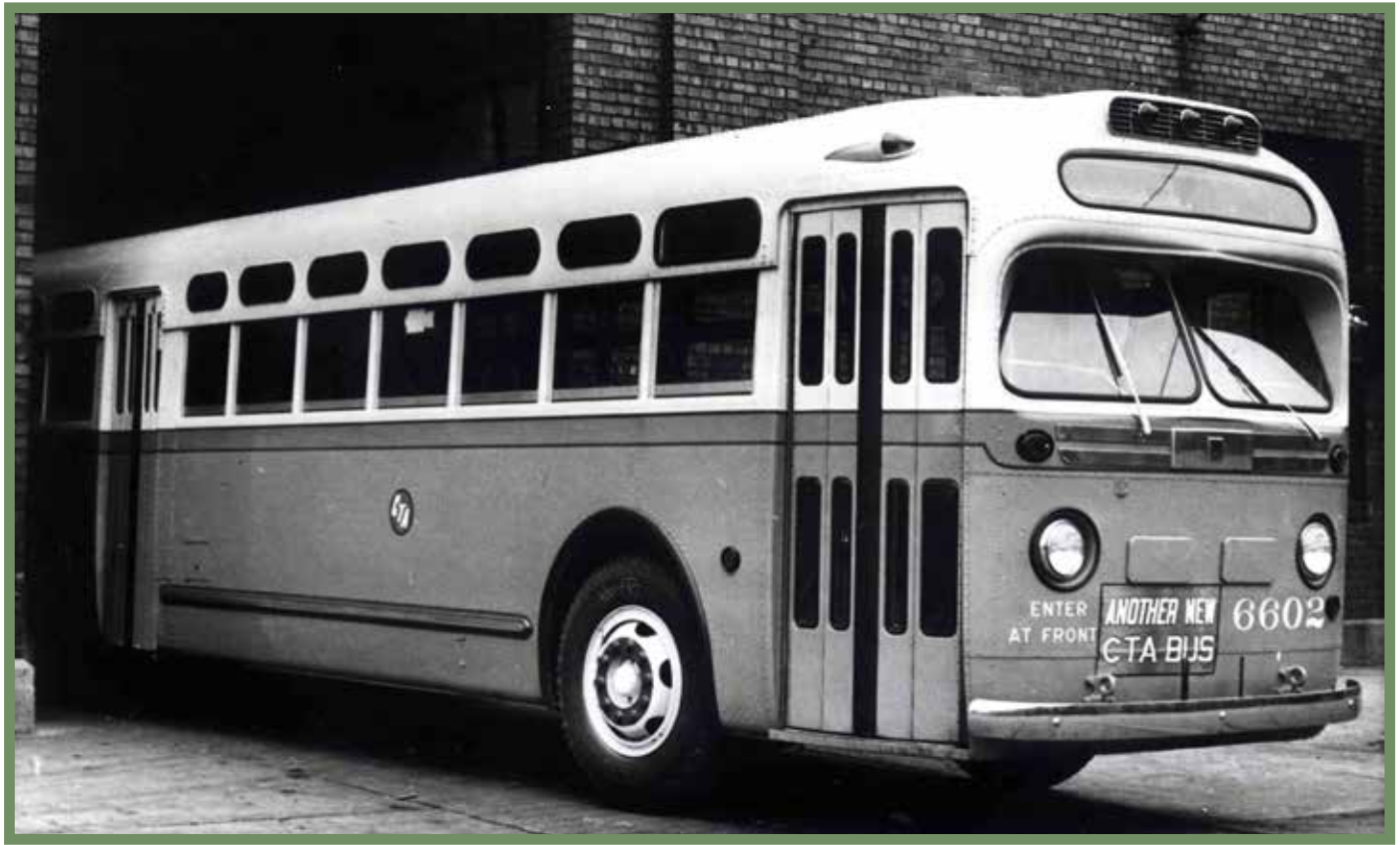
Another new bus has arrived for the city – ordered by the Chicago Surface Lines, but with delivery taken by the newly created Chicago Transit Authority in 1948. Bus #6602, manufactured by General Motors, was part of a fleet of 179 buses ordered between 1946 and 1947 that helped modernize the rolling stock inherited by the CTA from its surface division predecessor, CSL.