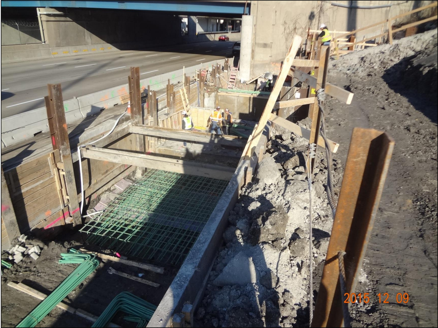
Water Main Protection Slab Reinforcement