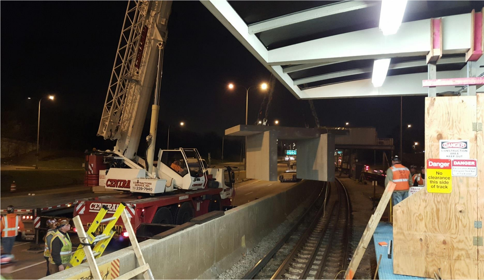
Addison Precast Platform Panel Placement