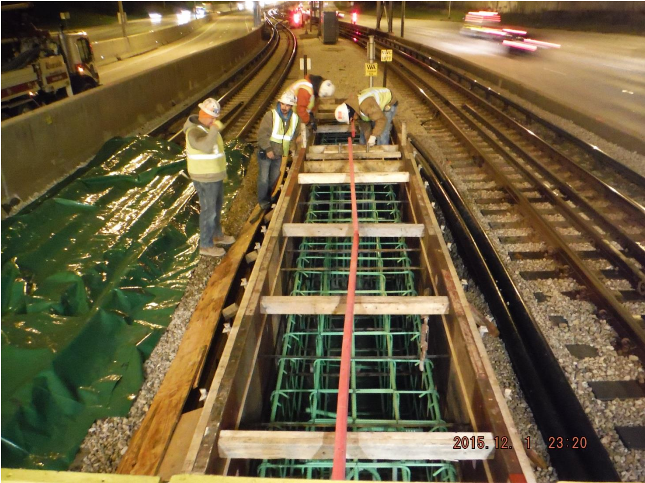
Addison Caisson Cap Form Work