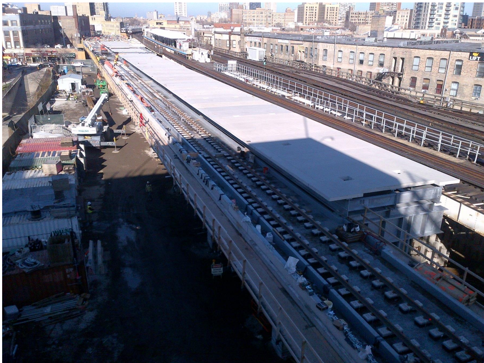
New Track Installation