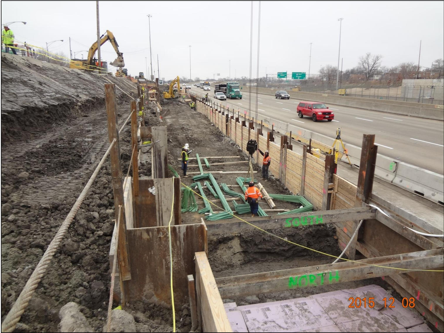
Earth Retention System for South Terminal Foundation Wall