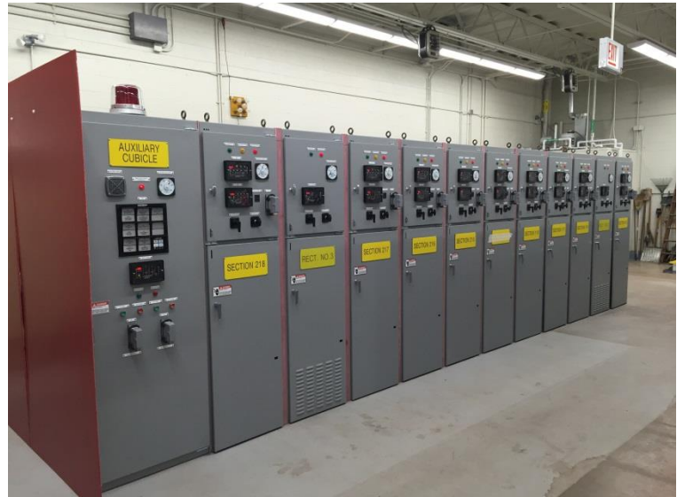
Princeton Substation: Substantial Completion