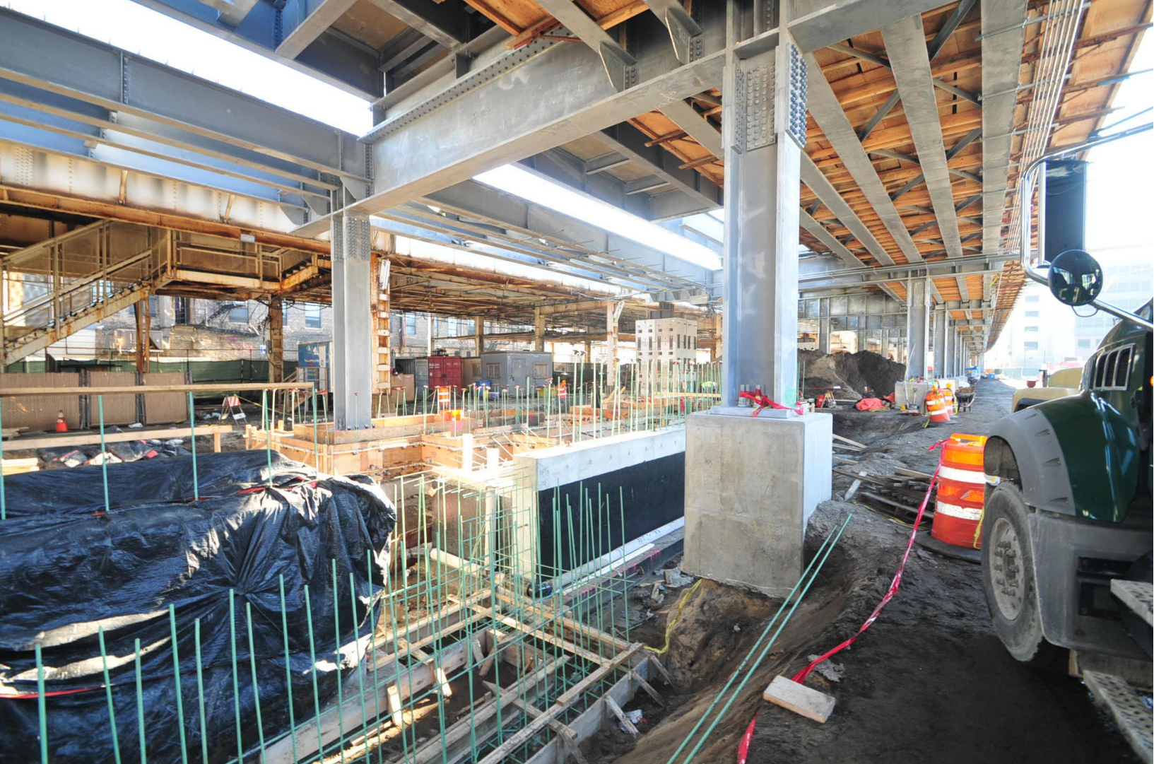
New Wilson Station Foundations